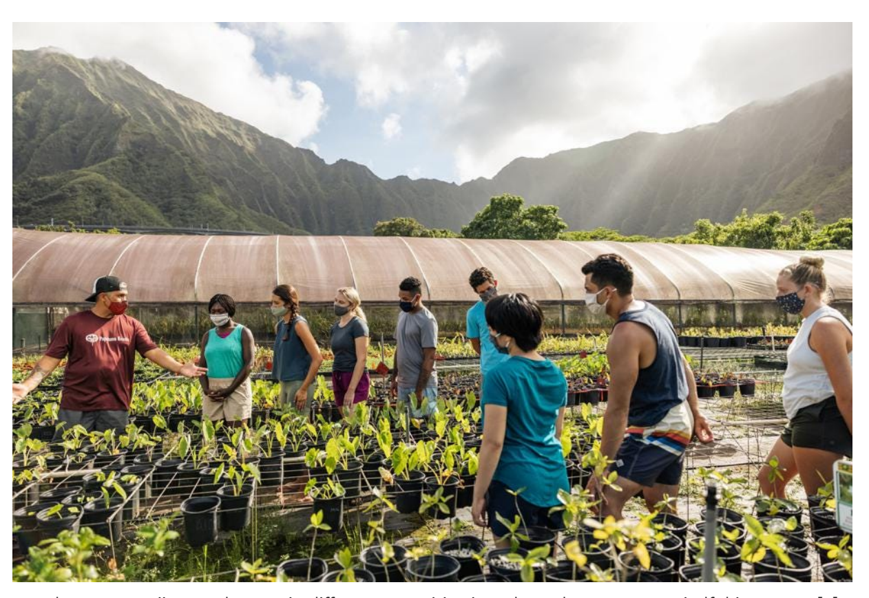
Travelers to Hawaii can volunteer in different capacities in order to have a more mindful impact ... [+] HEATHER GOODMAN

Let's face it, people go to Hawaii for many different reasons: adventure, relaxation, romance, culture, family fun, cuisine and more. They leave with wonderful memories of their vacation, but now they can deepen their