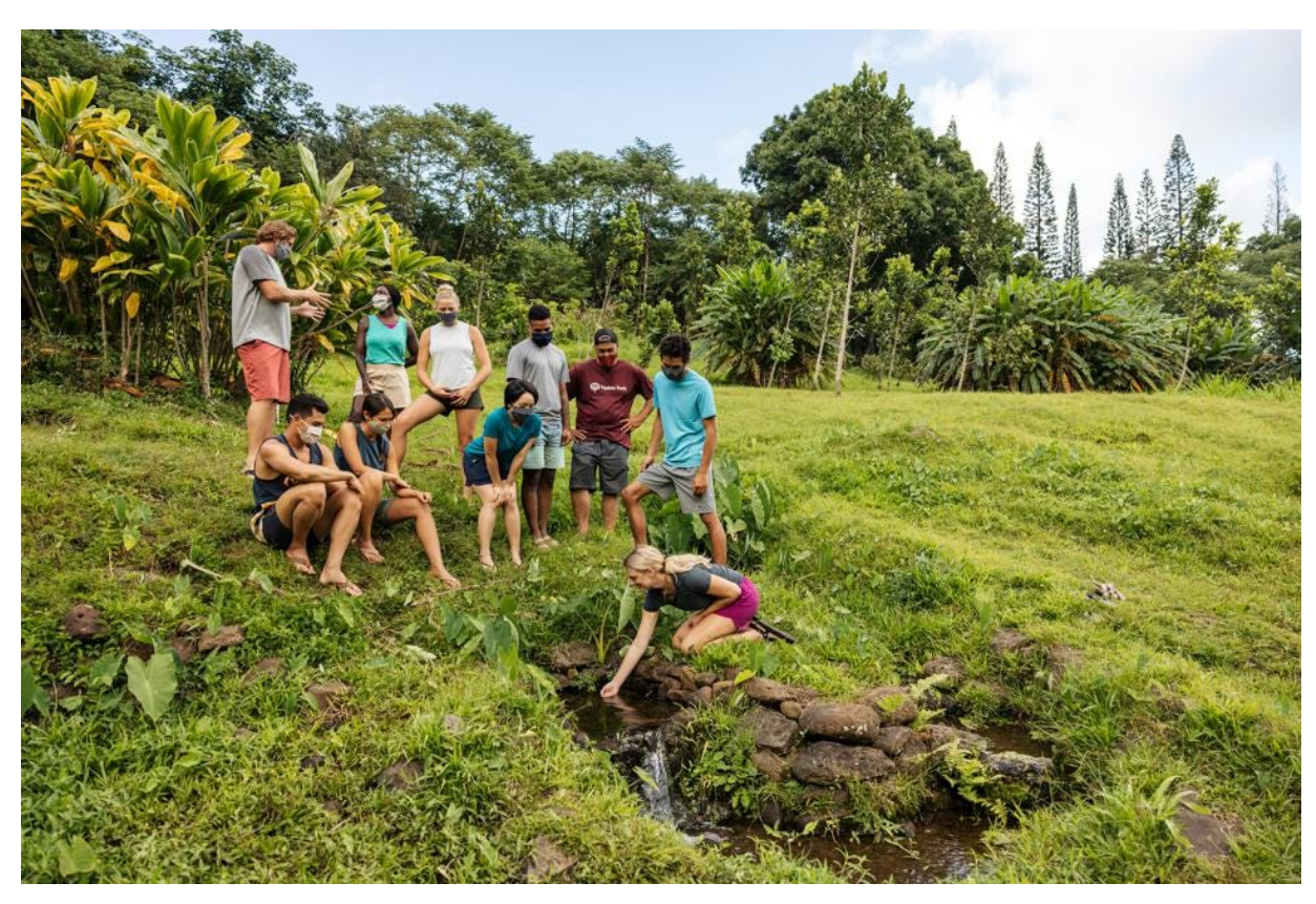
The word "malama" means "to care for" in Hawaiian and that's exactly that travelers are doing when ... [+] HEATHER GOODMAN

Hotels and volunteer organizations based in Hawaii have worked together to create a partnership where travelers can give back to the destination while they are on their vacation. Volunteer projects range from reforestation and tree planting to self-directed beach cleanups, ocean reef preservation, and even creating Hawaiian quilts for the kupuna (elders).