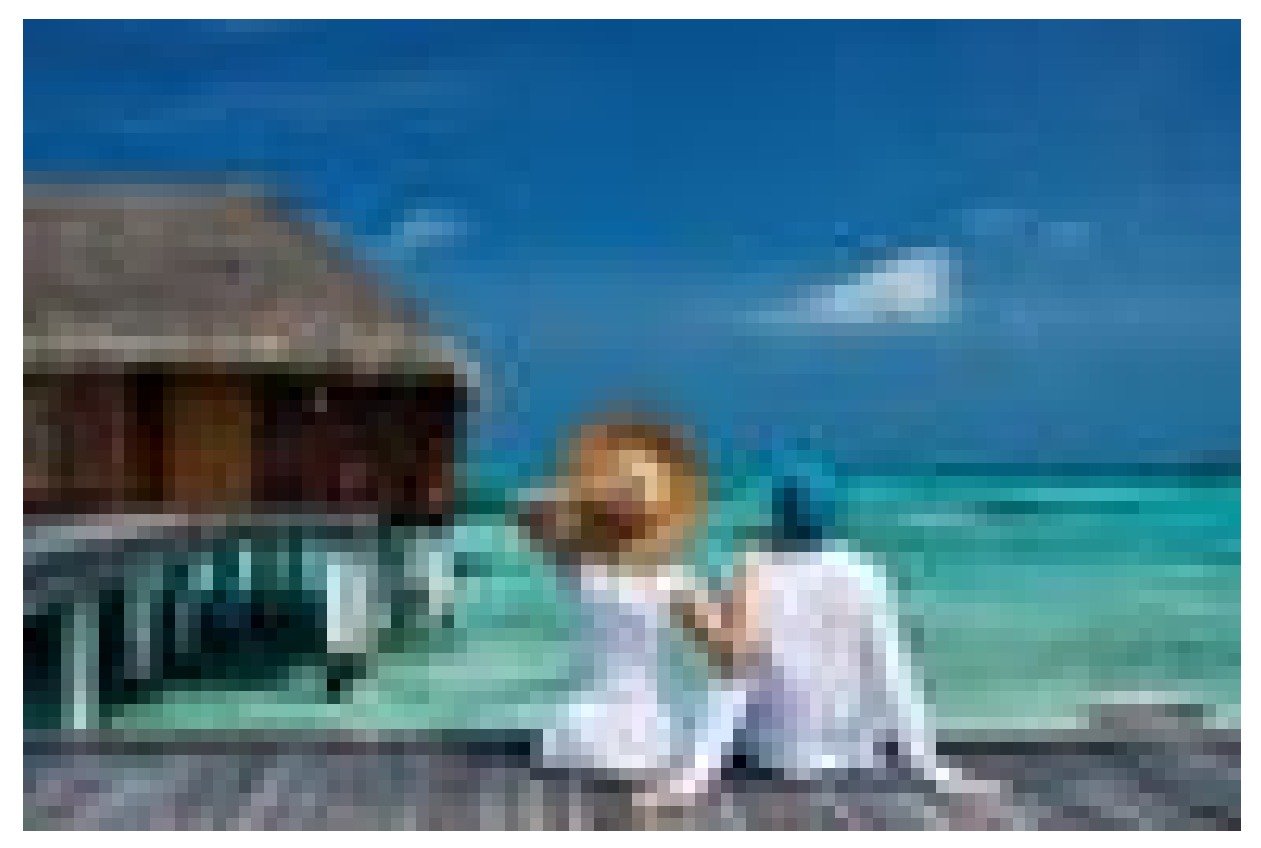
Travelers are asked to wear masks in public areas and social distance from other travelers. It's ... [+]

In the same spirit of hospitality workers being vaccinated, travelers must also show that they are Covid negative. While travelers are not required to be vaccinated prior to arrival, they are required to show a negative PCR test before embarking on their flight to the Maldives. This test must be administered no more than four days prior to departure. (Many airports, including New York's JFK, offer PCR tests with results in less than two hours.) Once at the resort in the Maldives, travelers must be tested again. While many vacationers tend to stay at just one resort for an extended period of time, if you are planning to travel from resort to resort, be aware that Covid tests are required at each property.