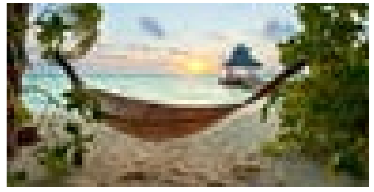
The resorts do all the back-end work to make things clean and safe and running smoothly, so ... [+]

Most resorts in the Maldives have extensive safety and health protocols in place, including plexiglass at the reception area and other frequented areas. Restaurants space out diners and serving times. Food is allowed to be consumed only in specific areas. And high-trafficked areas—like spas and yoga classes—are limited throughout the day. The effect is a well-thoughtout, safe, and secure vacation experience.