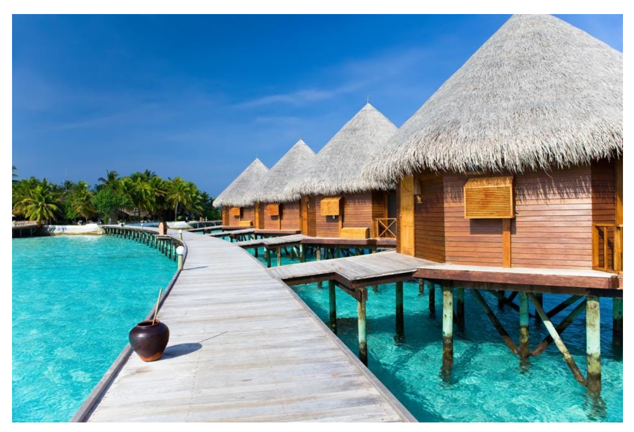
The Maldives are known for their overwater bungalows, many of which have private plunge pools and ... [+]

Traveling during a global pandemic is not the easiest, but certain places are aggressively doing their part to slow the spread of Covid-19, so that travelers can feel safe and hopefully visit . Tourism is a huge economic factor for many countries, and the push to bring back travelers, and to do so safely,