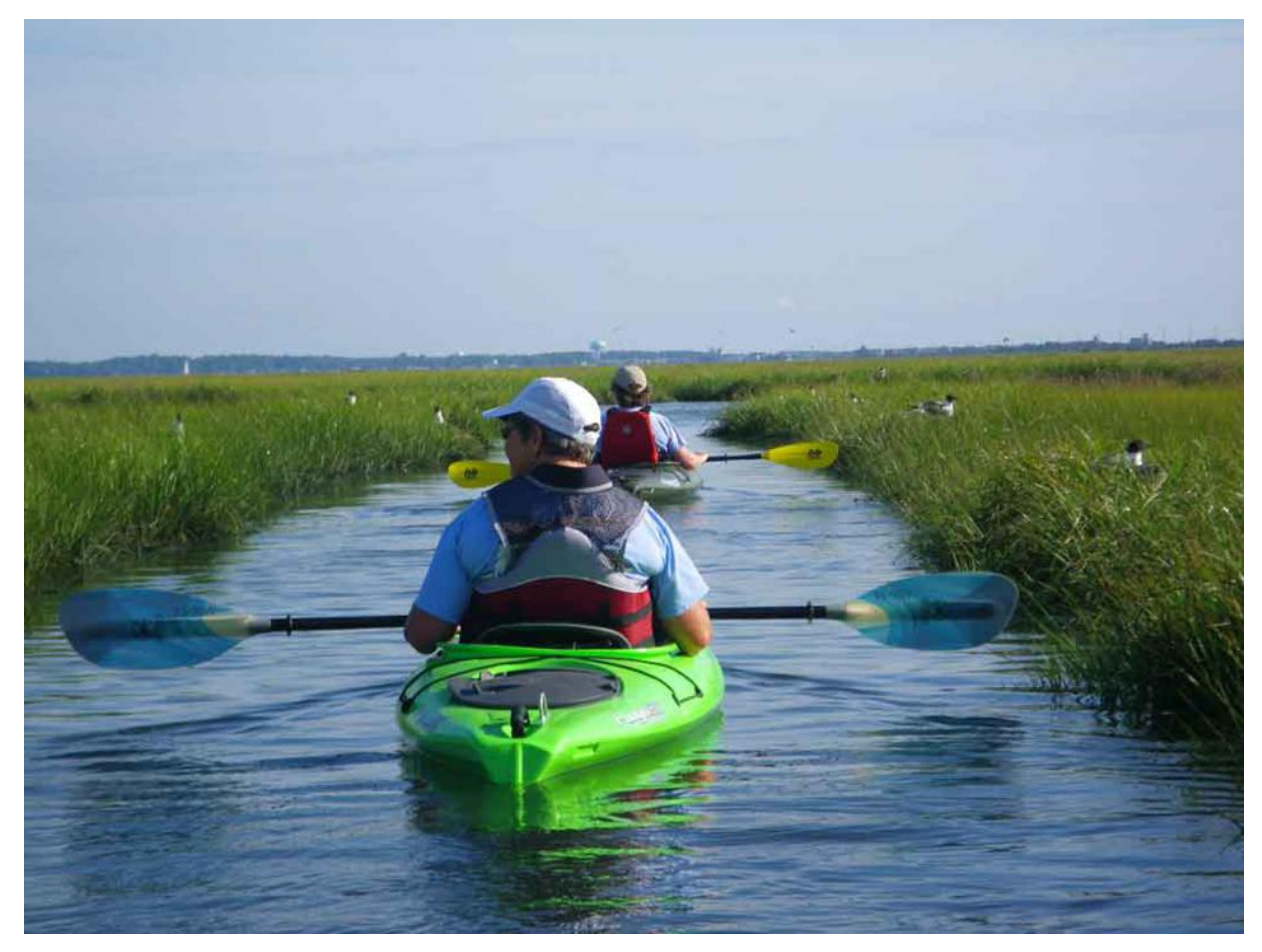
Burton's Island Wildlife tour is a favorite among families.

What's so wonderful about this area is that there are so many outdoor activities to do. If you're into biking and hiking, be sure to check out the trails at Cape Henlopen State Park. They vary in difficulty, but the views are all pretty amazing. Another good option for active adventure is Delaware Seashore State Park. Two great biking trails are Gordon's Pond Trail and Junction and Breakwater Trail. Both are flat (so great for kids), but really pretty with lots of places to stop along the way.