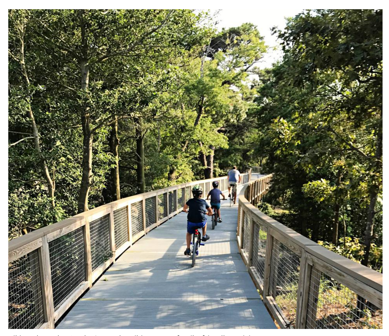
Biking along the Gordon's Pond Trail is a great family-friendly activity.