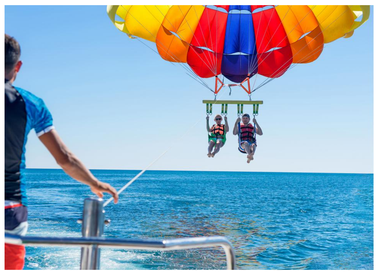
Parasailing is a great way to see the region from the air and sea.

area looking for a variety of beach life including fiddler crabs, starfish, moon snails, and clams. The tour is about two hours, and children between the ages of 7 and 11 go tandem with an adult.