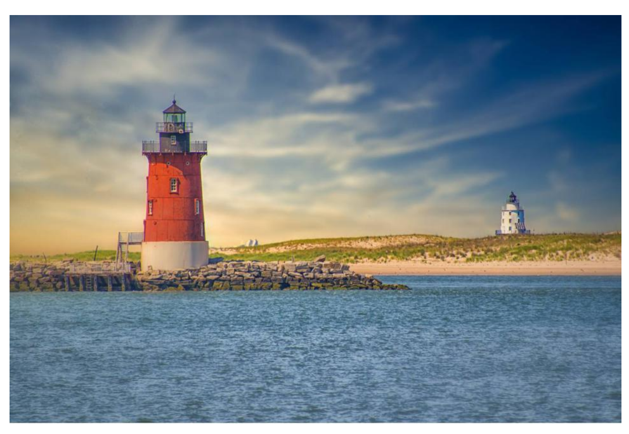
The beaches in southern Delaware are known for their views and lighthouses.

This summer is all about road trips, and the beaches in Delaware on the shores of the Atlantic Ocean are pretty hard to beat. This destination is great for families—there's plenty to do, great places to stay, and plenty of restaurants that serve up fresh fish and other summer treats.