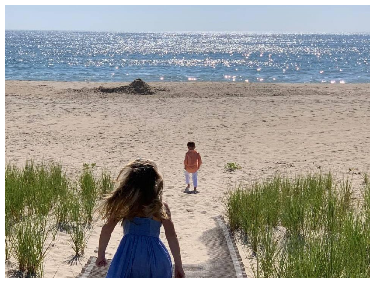
Many accommodations are located walking distance to the beach.

It's important to pick the right accommodations for your family. A good option for families looking for campground fun, but for those who don't