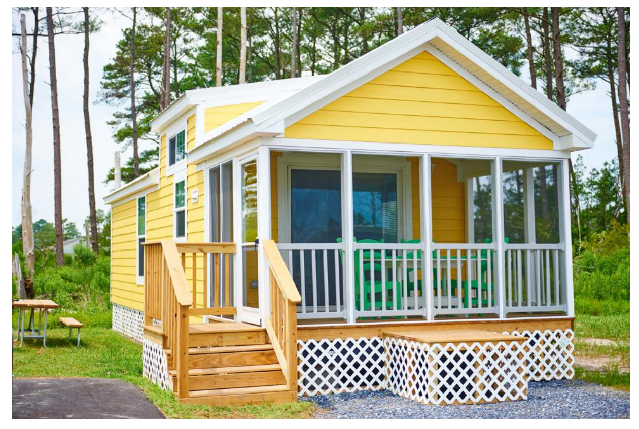
The cottages at Massey's Landing have a kitchen, bathroom, two bedrooms and screened-in front porch. ... [+] MASSEY'S LANDING

Staying at a cottage is a great way to have the luxury of a real bed, a real bathroom, and a kitchen, but still have all the perks of campground life including campfires, outdoor pools, and the camaraderie that campgrounds are known for. (It's one of the easiest places to make friends.) It's camping fun without the work.