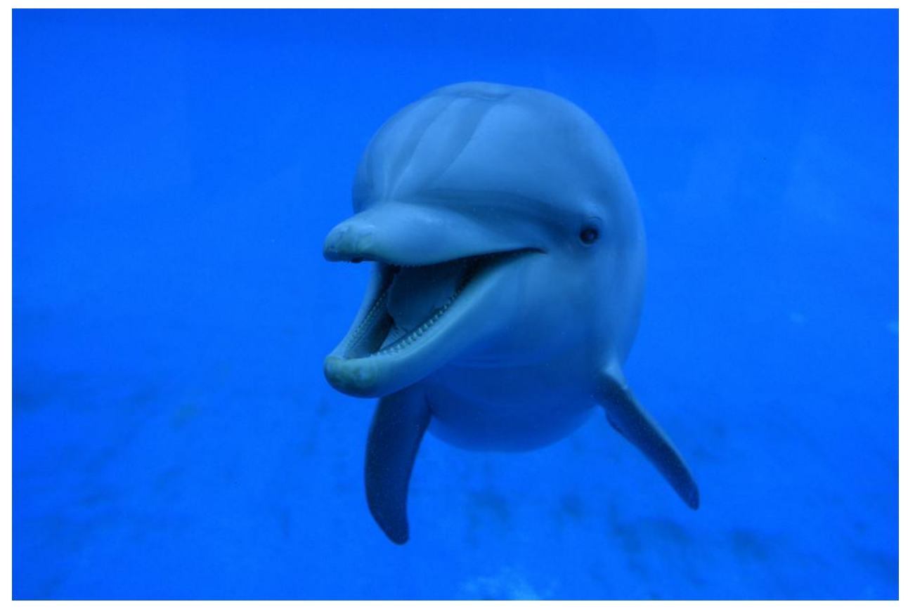
Dolphins use sonar to communicate