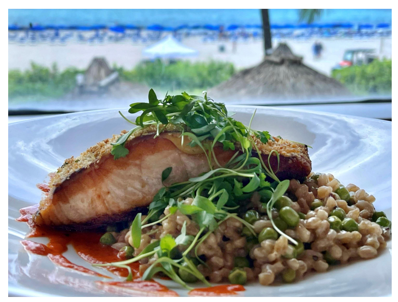
Seared salmon in a Dijon Gremolata crust DISCOVER THE PALM BEACHES

The living room area is also very spacious and is separated from the kitchen by a granite island with bar stools. The living room has a large couch, TV, comfortable chairs. The bedroom is very spacious as well, with amazing views. The bathroom has an oversize tub, and a separate shower and toilet.