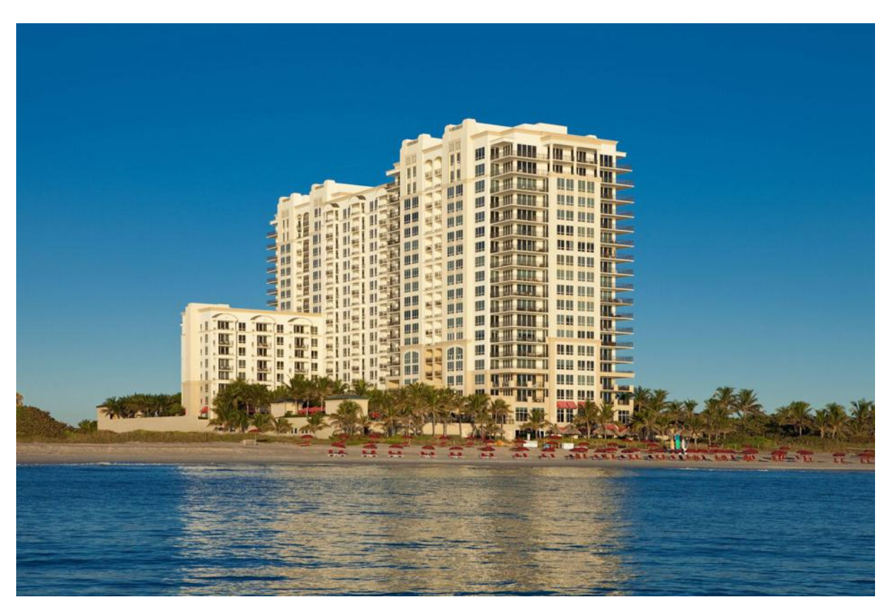
The resort is near some of the top diving and snorkeling spots in the country. PALM BEACH MARRIOTT SINGER ISLAND BEACH RESORT & SPA

Just like in real estate, where a resort is located is the key to its success. The Palm Beach Marriott Singer Island is just steps away from the beach and is in close proximity to the top dive and snorkel sights, including Blue Heron