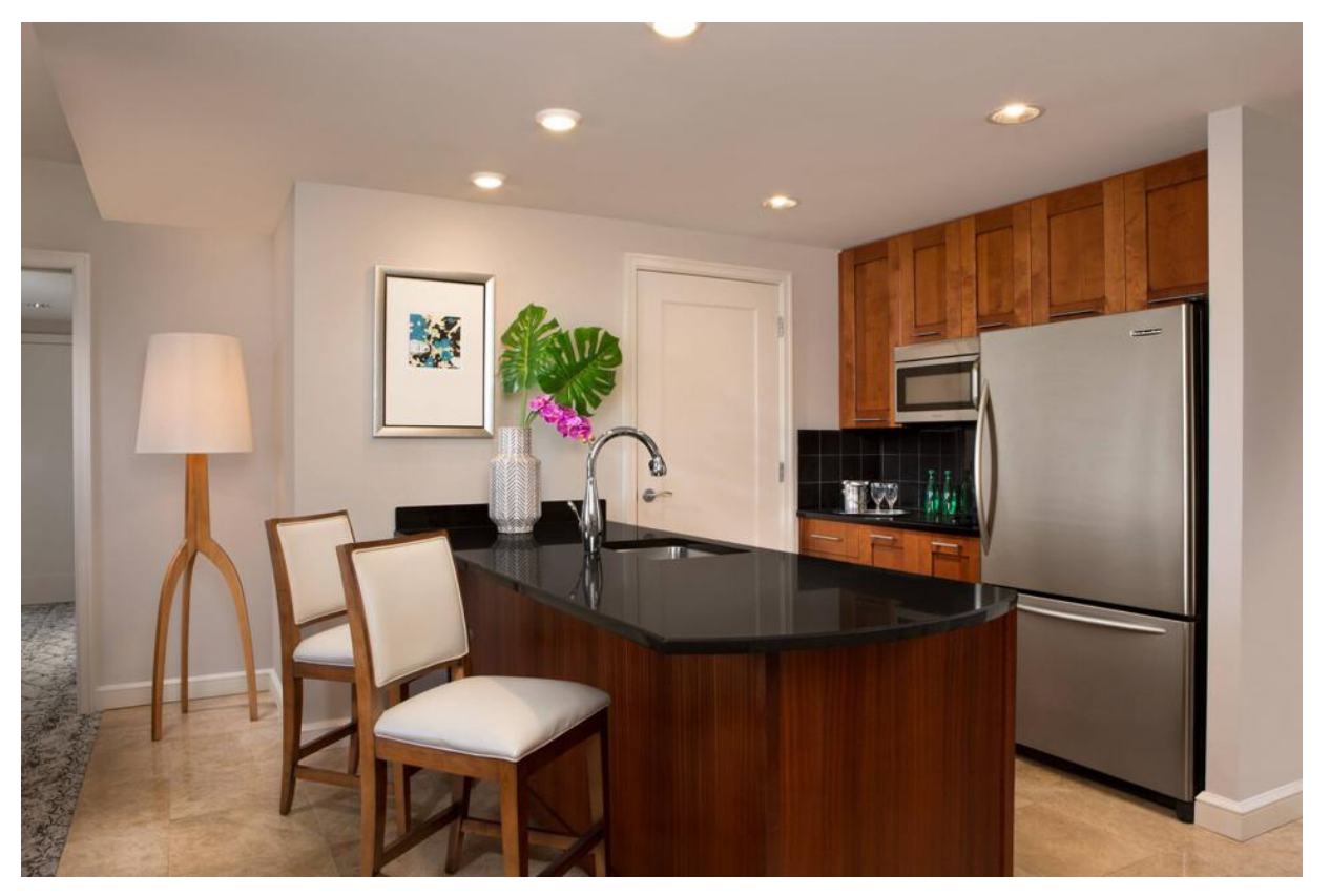
The all-suite property has fully equipped kitchens. PALM BEACH MARRIOTT SINGER ISLAND BEACH RESORT & SPA

Beach Marriott Singer Island Beach Resort & Spa is the place to be. It's just 13 miles north of the Palm Beach International Airport, and close to both the Fort Lauderdale and Miami airports.