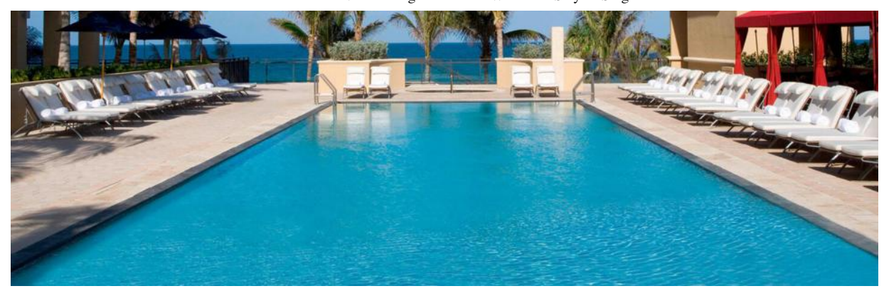
The pool area is popular with families. PALM BEACH MARRIOTT SINGER ISLAND BEACH RESORT & SPA

Palm Beach Marriott Singer Island has a private beach with a natural reef; an outdoor infinity pool with poolside cabanas; a lagoon pool with a two-story slide; watersports; a fitness center and a kids club.