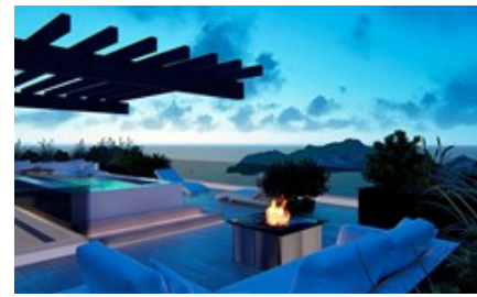
Ground breaks on Royal Mill resort in St. Vincent