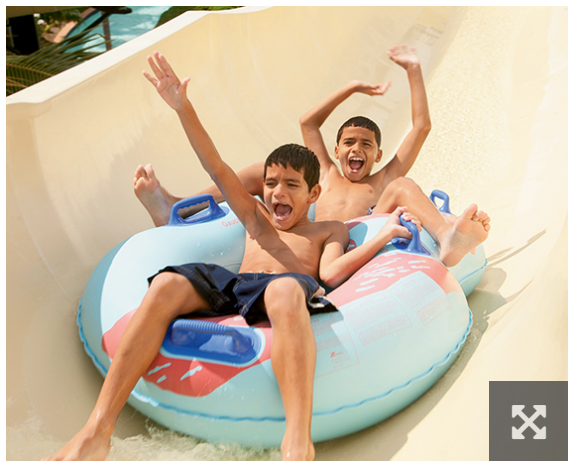
The 2-acre Coqui Water Park at El Conquistador Resort in Puerto Rico features water slides, a lazy river and an 8,500-square-foot infinity pool.

Located about 45 minutes from San Juan Airport, the property sits atop a rugged cliff overlooking the Caribbean Sea – it has great curbside (or, in this case, boatside) appeal.