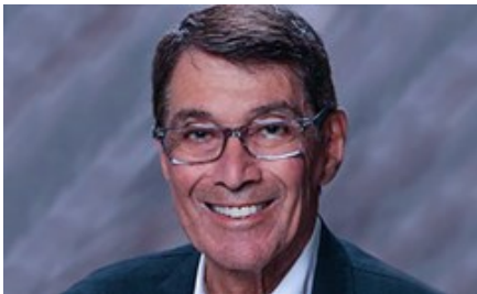
Friends & Colleagues