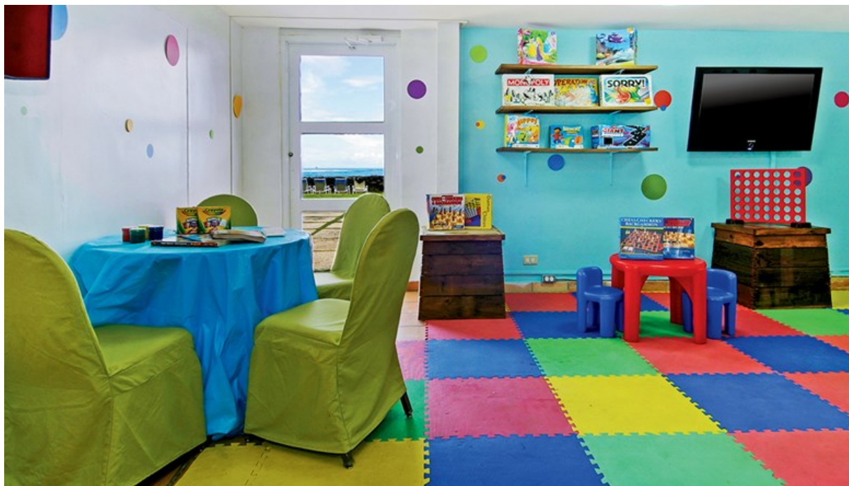
The children's activity area at Condado Plaza Hilton in Puerto Rico.

If parents are into gaming, they'll be pleased to note that the property boasts the largest casino in Puerto Rico. With 571 rooms, the property has two towers, offering balcony views of the Atlantic on one side and the lagoon on the other. There are eight restaurants, from the upscale Pikayo to the casual Cafe Caribe. There are also three pools: one with a swim-up bar; one with a water slide and shallow area for toddlers and babies; and a saltwater pool.