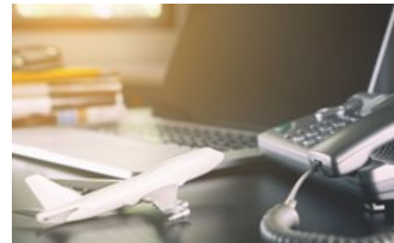
Agents find it helps to keep calm and communicate with clients