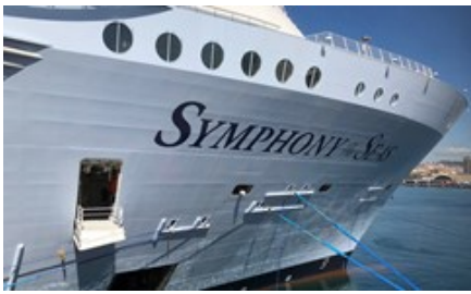
CLIA agrees to temporary halt of cruising from U.S. ports