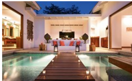
Natural escape at the Ka'ana Resort in Belize