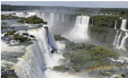
Brazil tourism lays out its 2020 agenda