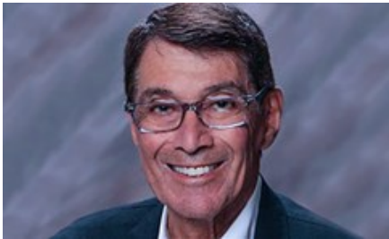
Friends & Colleagues

5 With incentives not moving the needle, cruise lines cut prices