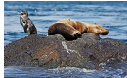
Galapagos encounters on Quasar Expeditions cruise