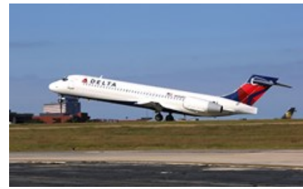
Delta parking up to 300 planes in 40% capacity cut

4 River lines upset to be included in advisory against cruising