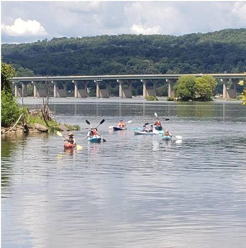
Kayaks on the Susquehanna River.