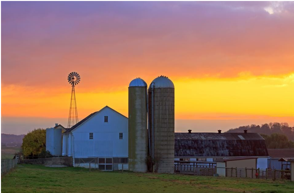
An Amish farm in Lancaster County, Pennsylvania at sunrise.

The coronavirus has a lot of people doing staycations this summer and a popular place to visit is Lancaster County, Pennsylvania. These five places have taken extra precaution when it comes to Covid-19 safety.