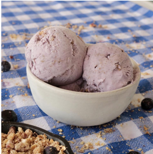
Blueberry Crumble Ice Cream FOX MEADOW CREAMERY

Fox Meadows Creamery is a farm-to-table restaurant with amazing views of the Lancaster County farmland. Come for the juicy burgers, freshly-made salads and tangy pulled pork, but stay for the one-of-a-kind cow-to-cone ice cream. It's a little piece of heaven in a cone. They create hand-crafted ice cream made on-site with milk from the family's small dairy farm just across the field. The Fox family purchased the