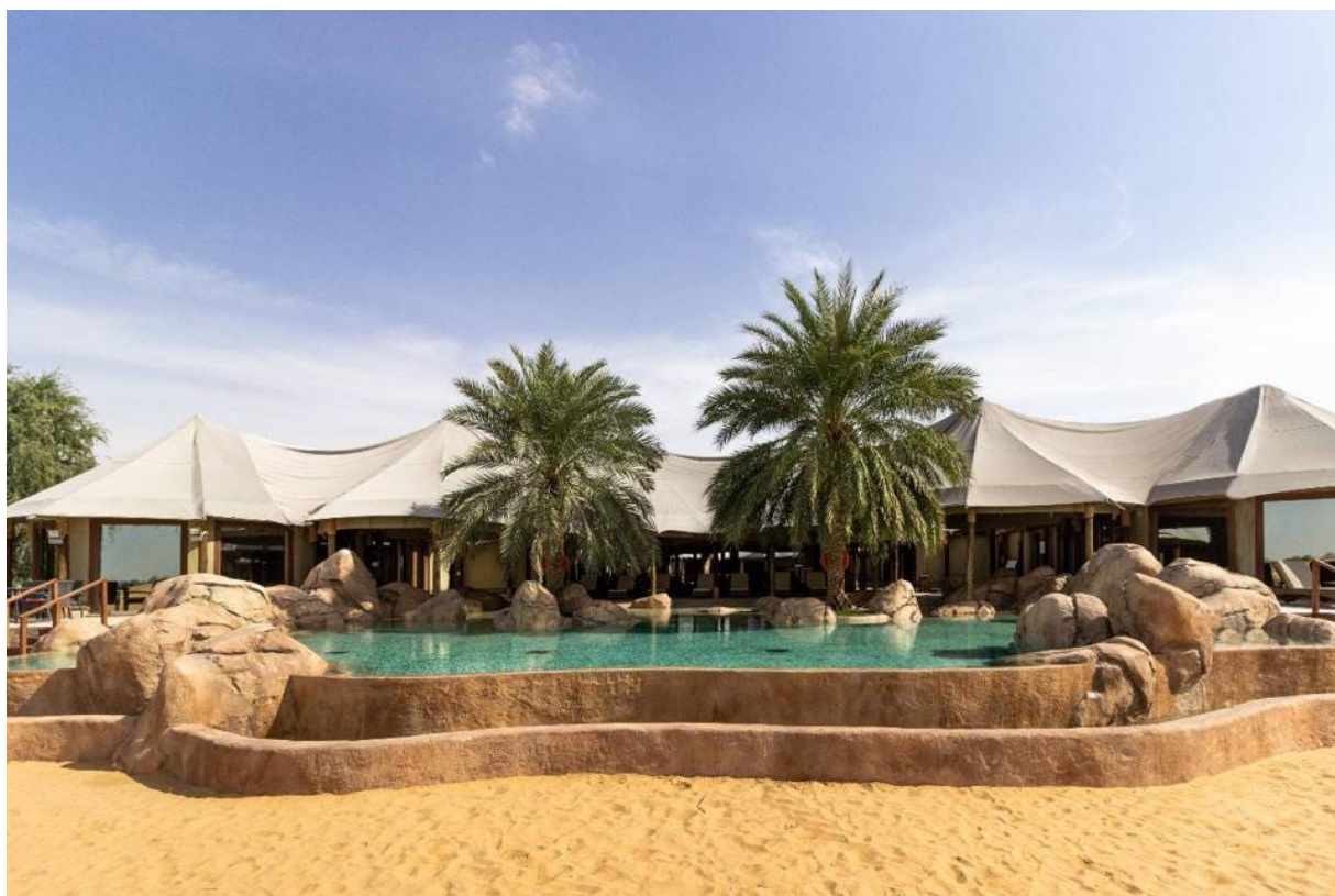
Telal Resort Al Ain ABU DHABI