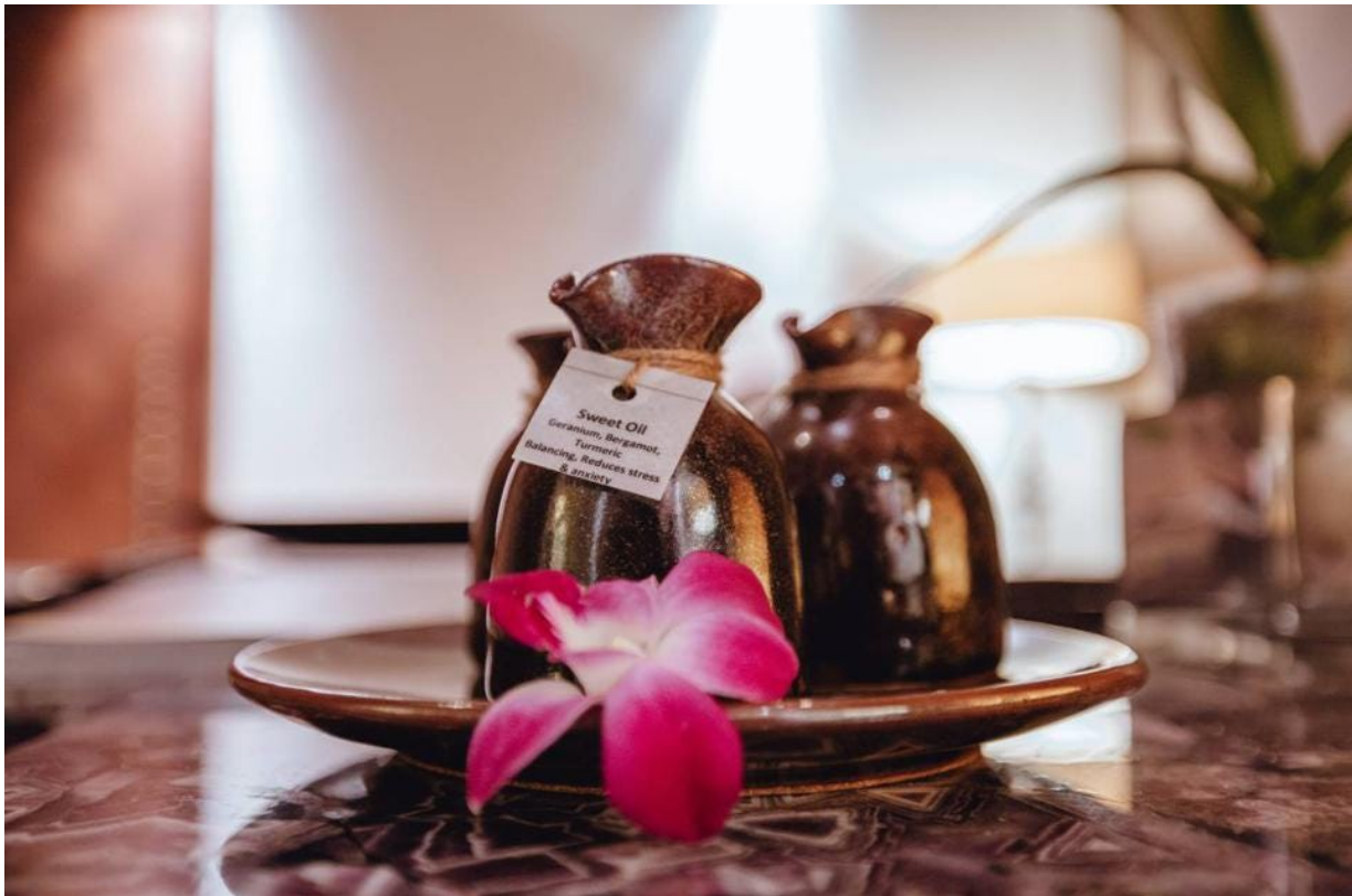
The Anantara Spa at Eastern Mangroves Hotel is one of the top wellness spas in Abu Dhabi. ABU DHABI

Abu Dhabi is known for a lot of things, but a spa destination may not be the first thing that comes to mind. But maybe it should. These wellness spots have a loyal following for those in the know.