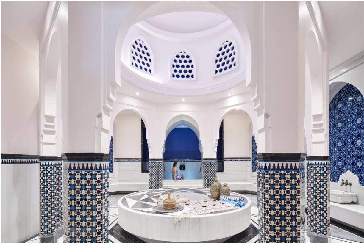
Anjana Spa RIXOS PREMIUM SAADIYAT ISLAND

Nestled on the shores of Saadiyat Island is this Turkish-inspired spa, which is also the largest spa in the area. It attracts travelers from all over the world. Designed in the style of Ottoman architecture, this 7,000-square-foot spa specializes in a variety of menu options including the traditional hammam treatment which includes the Turkish bath. For those seeking something a little different, the spa has the only Snow Room in Abu Dhabi. For couples looking for romance, the VIP suites are the ultimate indulgence at the Rixos Premium Saadiyat Island .