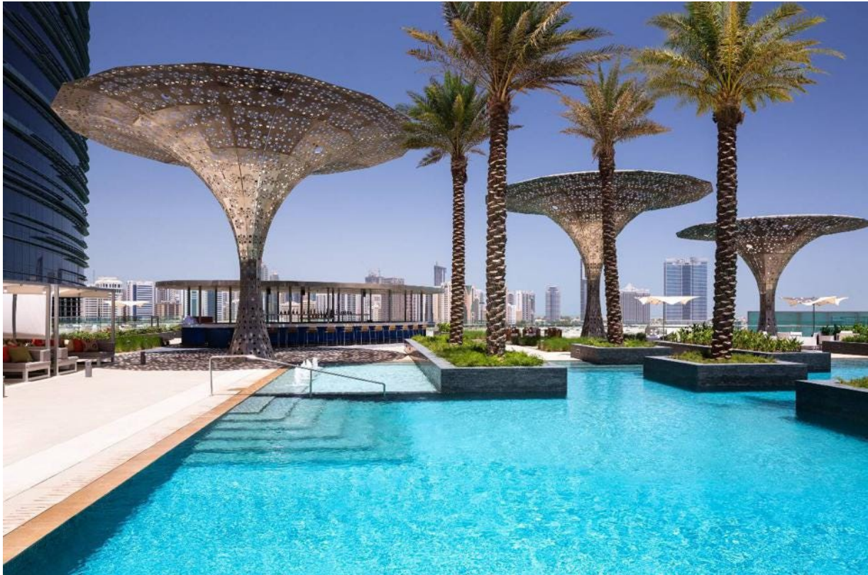
Rosewood Abu Dhabi ABU DHABI

From the textures of crystalline stone and sun-bleached driftwood in the relaxation areas to the cold mist showers and citrus-rich body scrubs, the five-star Sense spa at Rosewood Abu Dhabi aims to stimulate all senses. Nestled in Al Maryah Island, Sense A Rosewood Spa has nine state-of-the-art treatment rooms, a whirlpool Jacuzzi, a sauna with fiber-optic lighting, and a steam room with color therapy. One