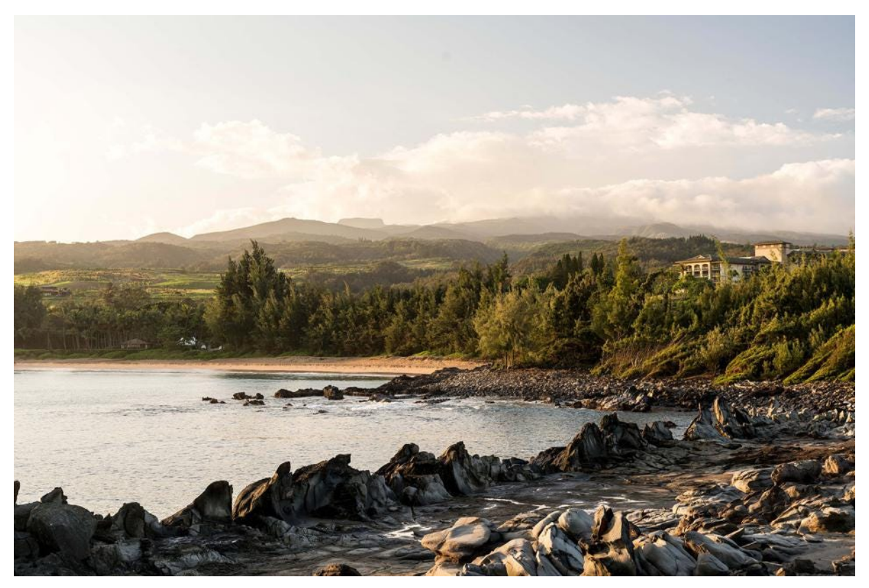
The stunning landscape is a big reason the Ritz-Carlton, Kapalua is such a popular hotel choice.

The Burger Shack is a casual oceanfront spot that is popular with couples, families and friends. Be sure to get one of their signature milkshakes, which are arguably some of the best sweets of its kind on the island. Other menu favorites including the burgers and chicken sandwich. Cocktails and local and craft beers are also on the menu. Sitting outside you'll take in the view of the ocean, watching the surfers and checking the horizon for whales. The restaurant can also put together a beach-friendly to-go kit if you want to take your meal and head down to Kapalua Bay beach.