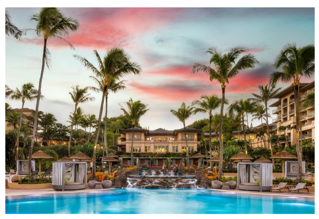
The Ritz-Carlton, Kapalua is a five-star property on Maui. THE RITZ-CARLTON, KAPALUA

The Ritz-Carlton, Kapalua is a luxurious, upscale property located on 54 acres. It's surrounded by 36 holes of championship golf set on the site of a historic pineapple plantation. Overlooking a pristine golden-sand beach, The Ritz-Carlton, Kapalua is located just minutes from downtown Lahaina on