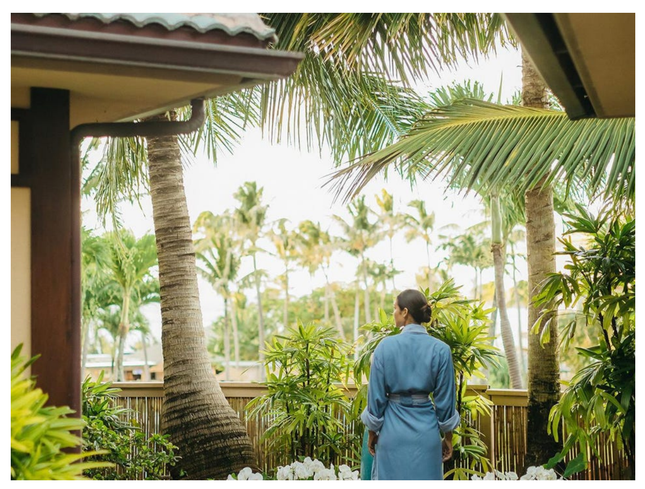
The Ritz-Carlton Spa, Kapalua is famous for its authentic Lomilomi massage.