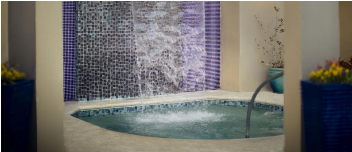
Be sure to allow time to indulge in treatments at the spa. CHRISTOPHER CYPERT