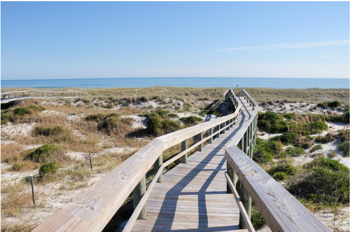
An elevated boardwalk across the protected sand dunes of Amelia Island's main beach.

You can't come to Florida without spending a good amount of time in the water. The resort has indoor and outdoor pools, and families can book a private cabana for the ultimate pool experience. Families can also book one of the beach experiences, which include surfing, stand-up paddleboarding, kayaking, and boating. If you're looking to experience nature, you've come to the right spot. Located on vital migratory routes and between two protected state parks and nature preserves, the resort's serene environment is the perfect spot to take advantage of birding and hiking adventures. Guests can explore beach and dune ecology on a walk with the resort's naturalist to identify coastal birds, dune flora, and wild animals indigenous to the area.