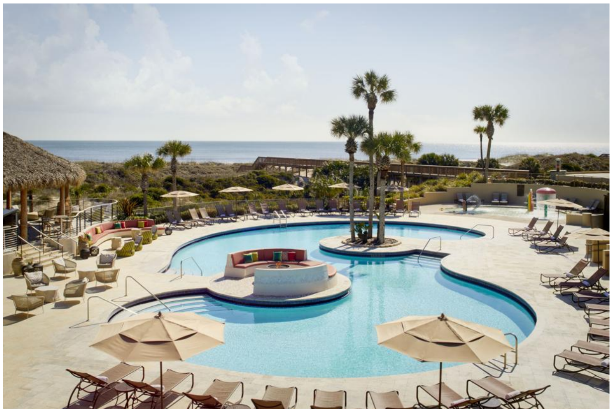
The Ritz-Carlton, Amelia Island is debuting a whole new look for its 30th anniversary.

The Ritz-Carlton, Amelia Island , has unveiled a new look, just in time for family summer travel and to celebrate its 30th anniversary. The iconic