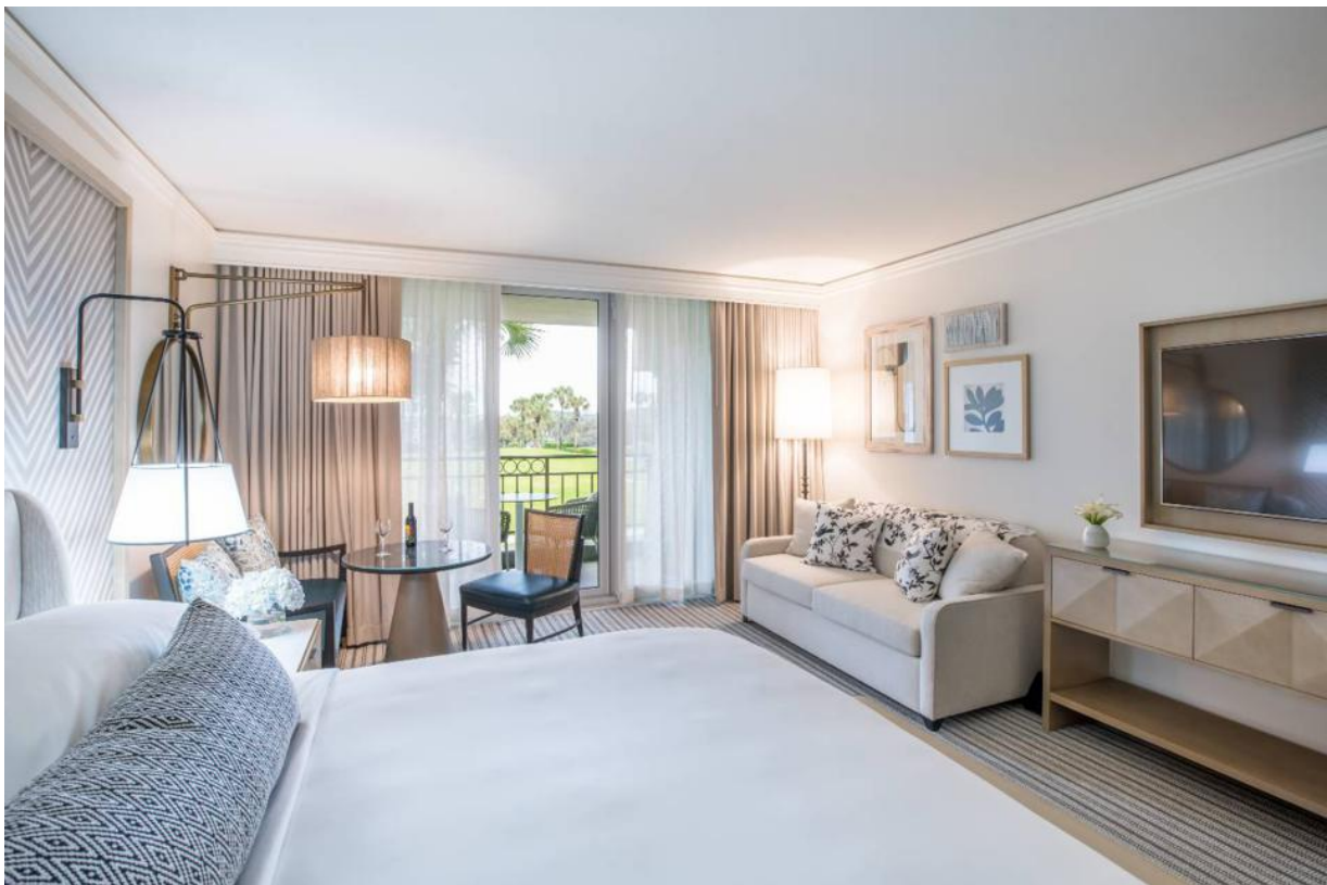
The guest rooms have been remodeled and updated. THE RITZ-CARLTON SPA, AMELIA ISLAND.

The 446-room property has a variety of room choices including ocean view, oceanfront, and coastal view. All rooms and suites have a private balcony or terrace and come with either a king bed or two queens. The beds are some of the comfiest to be found with luxurious 400-thread-count Egyptian Frette 100 percent cotton linens and goose-down and non allergenic foam pillows. The marble baths with dual vanities and showers are spacious and modern. Each room has a 55-inch flat-screen television.