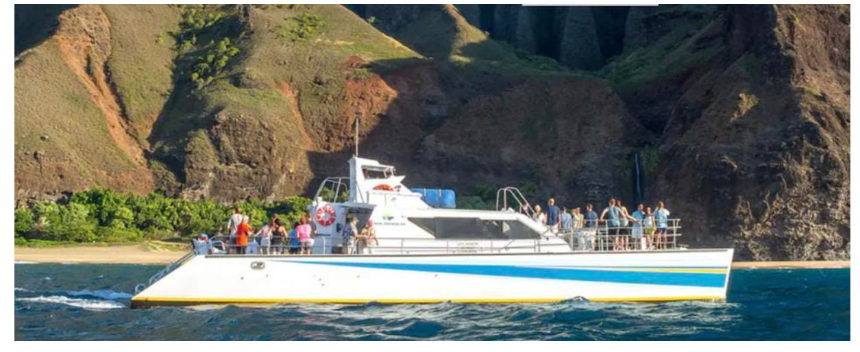
On the Napali Coast sunset dinner tour, travelers will cruise on the company's flagship 65-foot... [+]