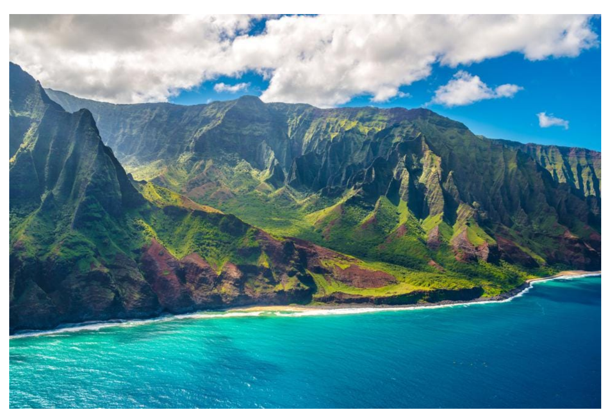
THE Napali Coast on Kauai.

Kauai is known as the garden island because it's so lush and green. It's known for its postcard-worthy emerald valleys, jagged cliffs and tropical rainforest (there are plenty of waterfalls to be found here). Kauai is the oldest island in the Hawaiian chain and it is also the northernmost one. Some parts of Kauai are only accessible by boat or helicopter (which makes helicopter and sailing tours well worth it).