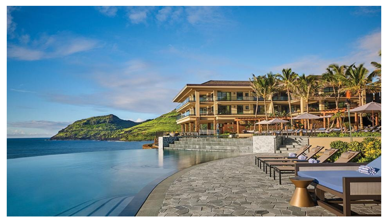
Timbers Kauai at Hokuala has an infinity pool that overlooks the ocean. TIMBERS KAUAI AT HOKUALA

Koʻa Kea Hotel & Resort at Poipu Beach has the ideal location on Poipu Beach. The the intimate boutique resort has an enviable location as Kauai's closest accommodation to the ocean. There are 121 rooms—each one has either a balcony or patio. Be sure to indulge in a spa treatment at The Spa at Ko'a Kea—the spa utilizes indigenous ingredients and the outdoor seaside cabana treatment areas are decadent (getting a massage while hearing the sound of the waves crashing on the beach just feet away). The property also has a pool with ocean views, an outdoor bar and a lava hot tub, along with fire pits and Adirondack chairs. The award-winning Red Salt Restaurant features locally-sourced Hawaiian ingredients for dishes with a modern take including vanilla bean seared mahi; ahi tartare and the famous Red Salt burger.