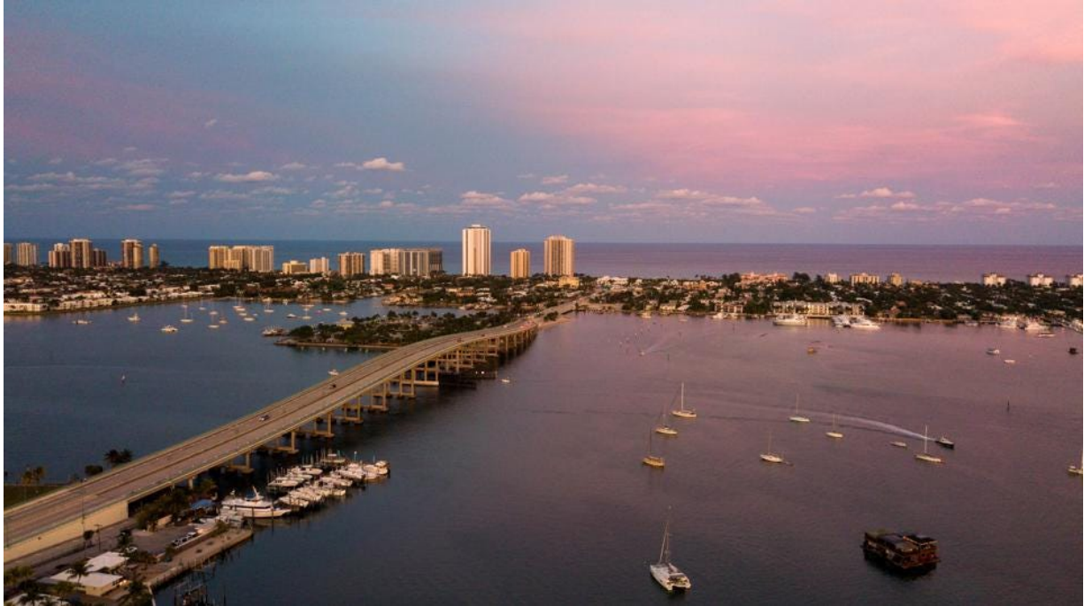
The Palm Beaches in Florida boast world-class diving spots.

I've been thinking about getting my diving certification for years. I've traveled all over the world, to many fabulous dive sites—Maldives, Fiji, Seychelles, Hawaii, the Caribbean, Tahiti, Palau—and always remained on top of the water as a snorkeler. While I loved seeing all the colorful fish and coral from the surface, I really wanted to go below to have a deeper understanding on what that world was like under the sea.