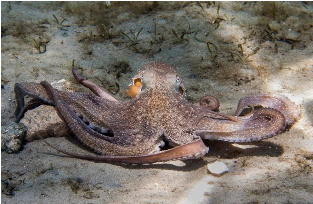
This area in Florida has amazing sea life, including the chance to see an octopus.