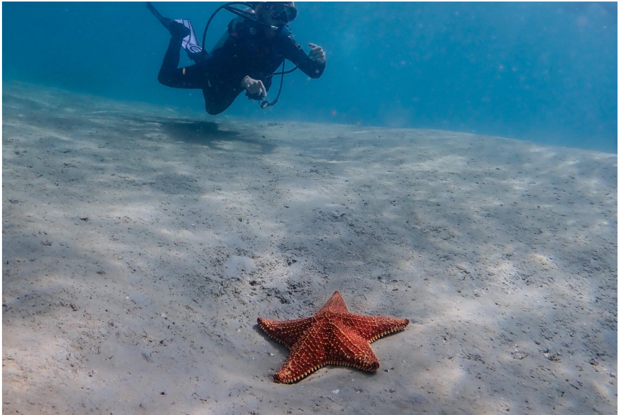
A diver admiring a starfish at the Blue Heron Bridge.