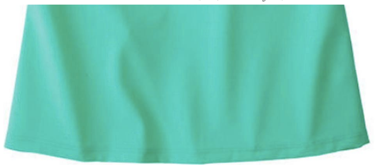
Pele Tankini Top TITLE NINE

Title Nine has a great collection of clothes that look great but are also comfortable and practical. The Set It And Forget It Tankini lets you decide how much support you need with the adjustable ties. The UPF 50 swim fabric is strong, so it doesn't stretch out quickly, and the colorfast hues keep the look lasting wash after wash. It's a classic style and one of Title Nine's bestsellers.