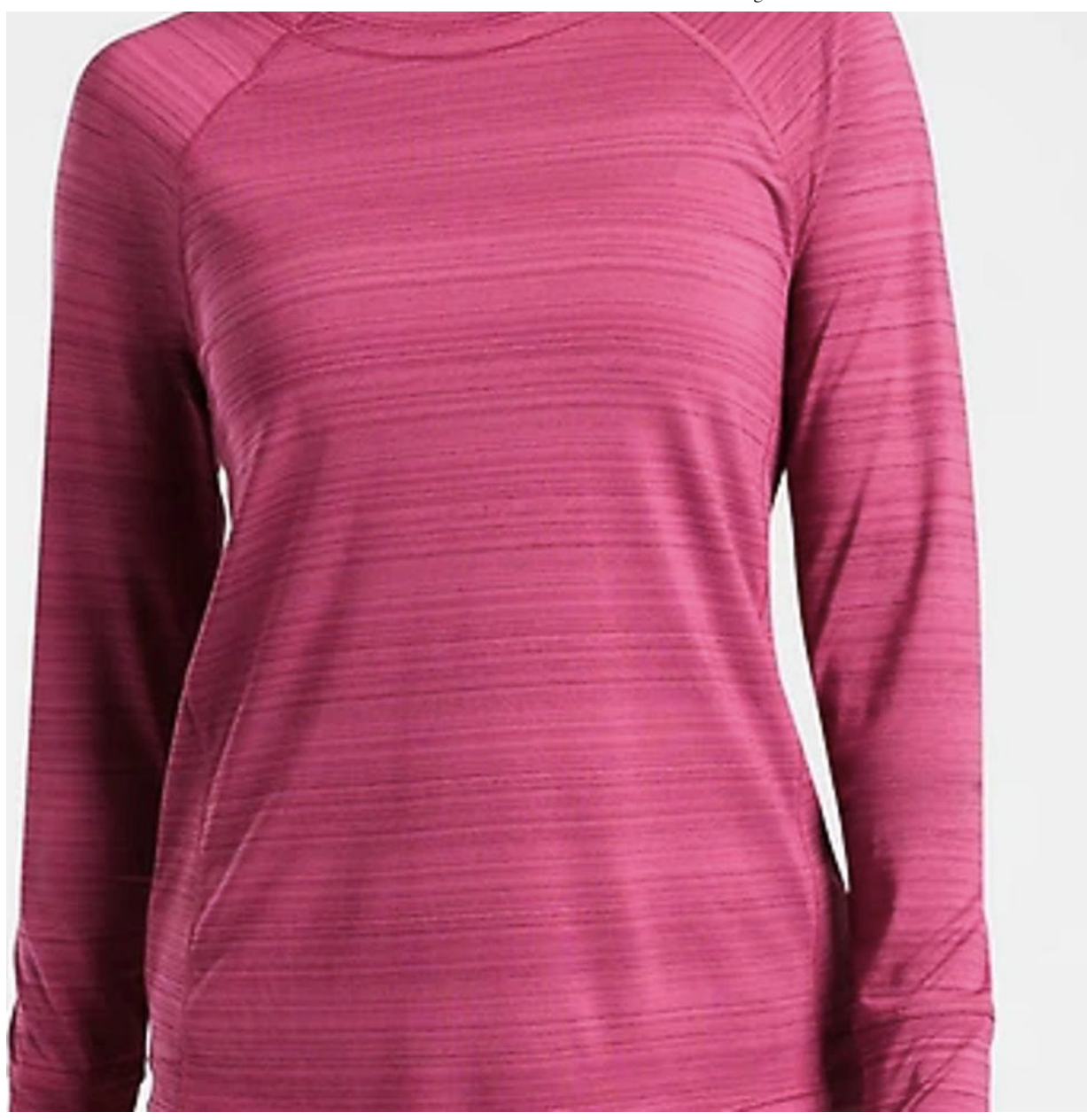
Pacifica Illume UPF Relaxed Top ATHLETA

Athleta is known for its active wear. Take the North Point Rashguard—it's ideal for all your summer water activities including swimming, surfing, SUP, and kayaking. It's made from recycled fabric (so you can feel good that you're doing your part to protect this earth) and has a back-pull zipper for ease of getting on (and off). The fabric is strong and stretchable, which means it will last a long time. It has UPF 50 sunscreen, and it's quick drying.