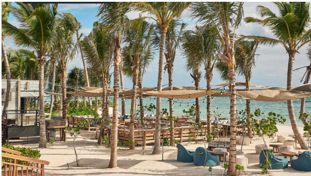
Sotavento restaurant is located on the beach and has amazing views. ANDAZ MAYAKOBA RESORT RIVIERA MAYA

and a lagoon. It's a part of the Mayakoba complex consisting of four properties and over twenty restaurants. The Andaz has 214 rooms, including 41 suites. Complimentary bikes are scattered through the resort, making it easy to get around (golf carts are also available to transport people).