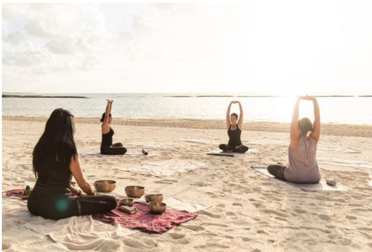
Beach yoga is one of wellness offerings at the property. ANDAZ MAYAKOBA RESORT RIVIERA MAYA

The Andaz Mayakoba Resort Riviera Maya's Naum Wellness & Spa is a 10,000-square-foot oasis. The spa is home to six open and airy treatment cabins and two hydrotherapy areas with many of the treatments incorporating indigenous Mayan methods. The spa recently debuted a new menu that incorporates many local and natural ingredients into the treatments, in addition to bringing in traditional Mayan rituals into the service.