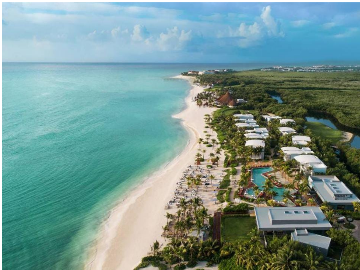
An ariel view of the Andaz. ANDAZ MAYAKOBA RESORT RIVIERA MAYA

Andaz Mayakoba Resort Riviera Maya is located on the Caribbean beachfront in an exclusive gated community just north of Playa del Carmen, in Mexico. The resort sits on 590 acres surrounded by the ocean, mangroves