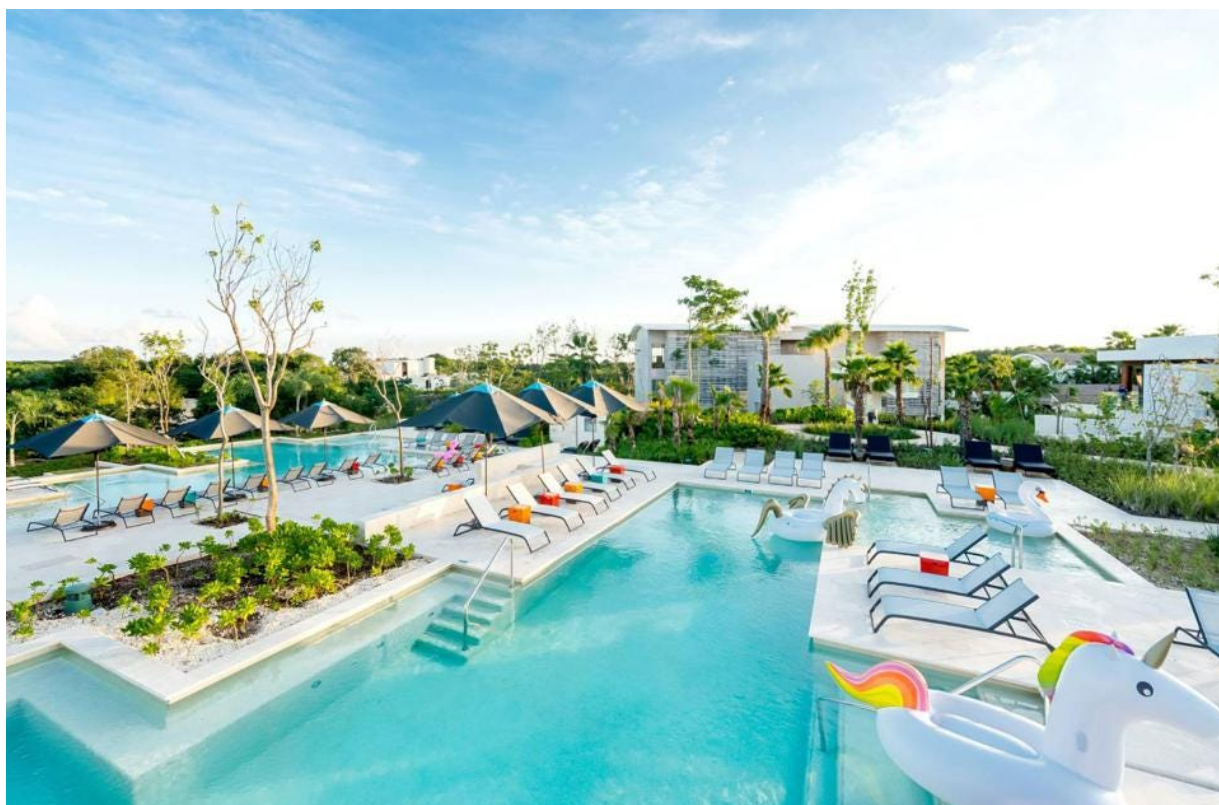
The pool near the spa has cabanas and plenty of lounge chairs. ANDAZ MAYAKOBA RESORT RIVIERA MAYA

classes in the pool, HIIT cardio and personal training sessions. Activities are held on the resort's beach, lawn or pool area and are limited in size.