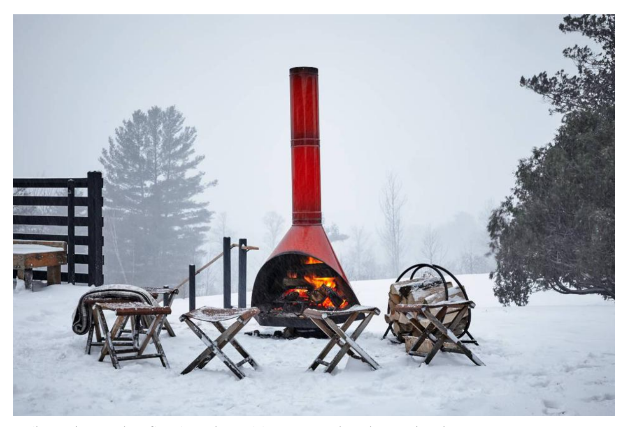
Scribner's has outdoor fire pits to keep visitors warm when the weather drops.