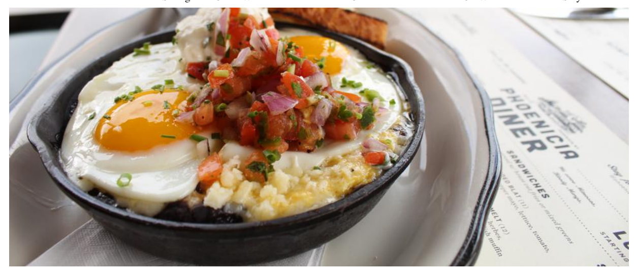
The breakfast skillet dishes are very popular.

The Phoenicia Diner is a local favorite. It offers traditional diner favorites, sometimes with a modern twist, using seasonal and local fresh ingredients. They are open during the Covid-19 pandemic for both takeout and outdoor dining. People can order online or at the outdoor Airstream. The pavilion area has extended outdoor seating. Favorite breakfast items include the pancakes, breakfast burrito, and the corned-beef skillet. Popular lunch and dinner items include the spicy chicken sandwich, the panfried trout, and the Cobb salad. All the bread (except the bagels) are made from scratch inhouse, and all the proteins are from local farms. All the veggies and produce are sourced locally as much as possible. Even the bar is designed around using distilleries, breweries, and other companies (like shrubberies and syrup businesses) throughout the Hudson Valley. When you order a Sugar Shack Shake, you're drinking Catskill bourbon, Ronny Brook ice cream, and maple syrup all fresh and locally made.