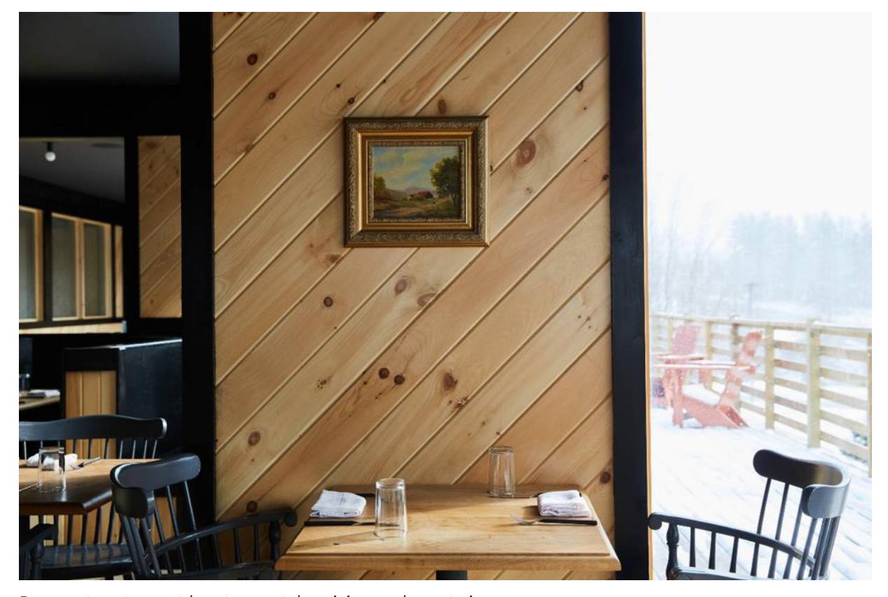
Prospect restaurant has top-notch cuisine and great views.

The Prospect restaurant, located at Scribner's Catskill Lodge, is known as much for its top-charting views as its amazing cuisine. The dining room has