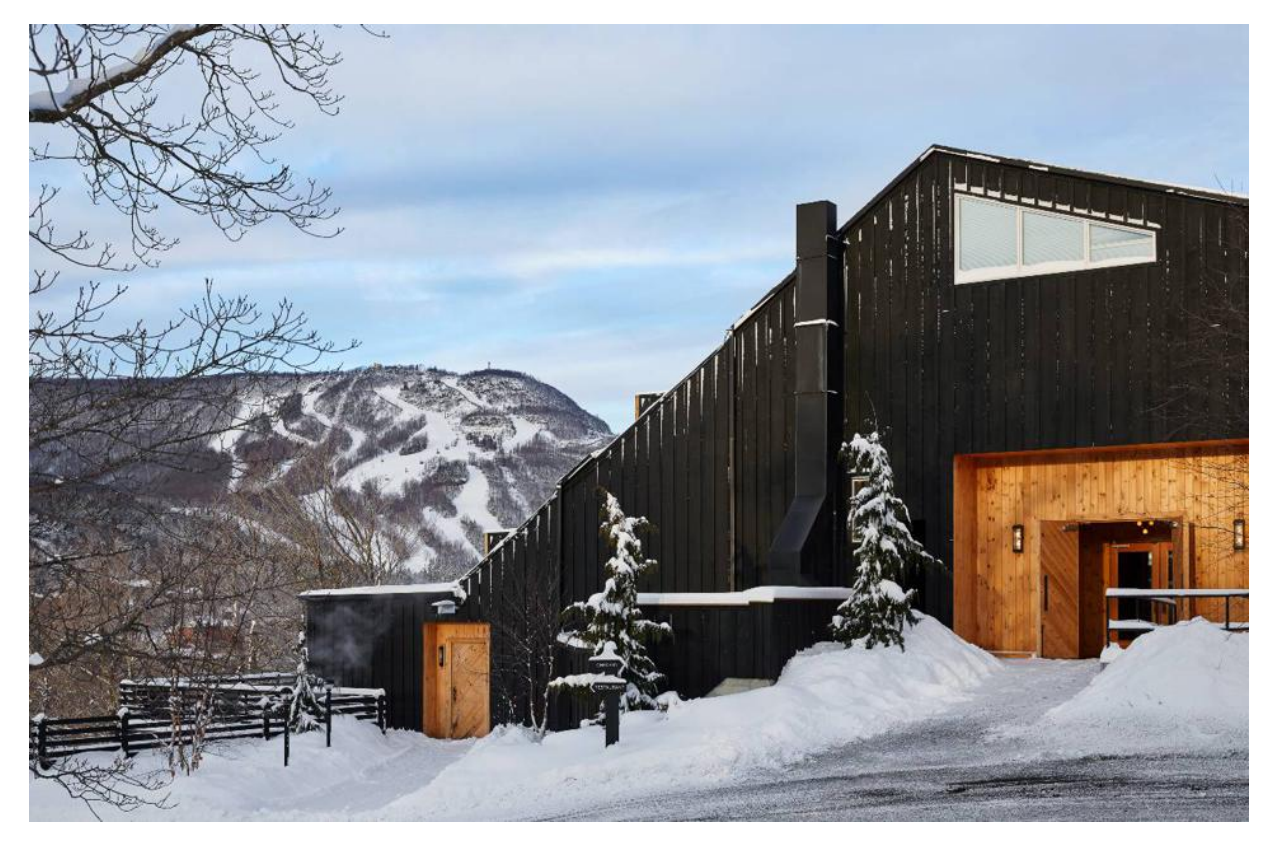
The property is near both Hunter and Windham Mountains.