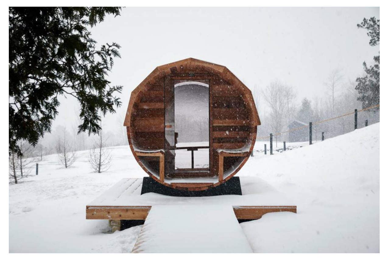
The sauna is a favorite amenity on property.

The two-story lobby has plenty of sunlight coming from the overhead skylights. Interior spaces include the 1,850-square-foot library, a private multipurpose studio room, and a whiskey lounge. The boutique property has 12 different configurations for its 38 rooms. Several rooms feature high-peaked ceilings while others offer lofted gathering and sleeping spaces; some also offer in-room cast-iron fireplaces. Terra-cotta shower tiles and overhead rain showers are standard in all bathrooms. Additional amenities available in all rooms include Frette linens, local magazines, complimentary s'mores kit, and Scribner's Guide to the Catskill Mountains.