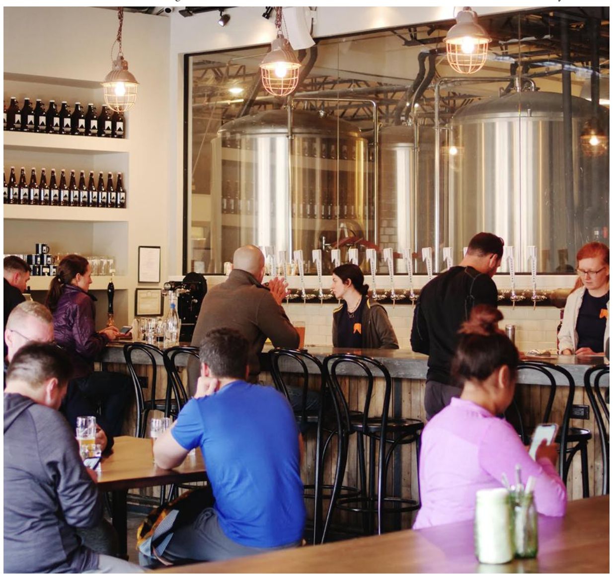
Woodstock Brewing has had a steady and loyal following since it's opening.

Woodstock Brewing opened in 2018 by two friends with a passion for beer. It has grown from a half-barrel pilot system in a Woodstock garage to a 15-barrel brewery. The extensive tap list includes IPAs, sour ales, pale ales, wheat pales, lagers, and more. They also serve a variety of beer cocktails, wine by the glass, and nonalcoholic drinks. The vibe in the taproom is casual and inviting with plenty of indoor and outdoor seating. While the brewery is cultivating a loyal following for its drinks, the food alone brings in a steady clientele. From the green pozole soup with pork, the báahn mìi, and extensive vegetarian and vegan options, the menu is as innovative as it is tasty. Favorites include the taquitos, the cauliflower wings, the brussels sprout tacos and the Woodstock lager—battered cod.