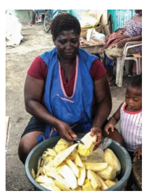
A woman preparing fruits and vegetables for sale at Georgetown's Bourda Market.

What makes Guyana so unique is that 77 percent of the country is rainforest and about 7 percent is savannah. Authenticity is the new currency in travel, and exploring this region is as anti-touristy as it gets. Travelers should venture into the interior of the country to really get to see the heart-and-soul of ecotourism. One of the highlights is the Rupununi region—where savannah, mountains and rainforests meet. This area is home to many endangered and protected species. Be sure to stay at Karanambu ranch, where you'll get to see the giant otter rehab project, which helps rehabilitate injured and orphaned otters and re-introduce them to the wild. Spend some time with the otters during the day before partaking in the caiman project once night falls. The giant black caiman is the one of largest freshwater crocodilians on the planet, and the Caiman House has been conducting research on these amazing creatures for more than 10 years. They take guests out in the dry season to catch the caimans and record data—you'll