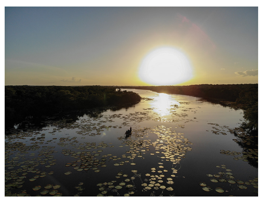
Giant water lilies at Mobay Pond near Karanambu Ranch

Guyana is also a birder's paradise, with travelers coming from all over the world to glimpse some of the 900 species of birds that live in this country, including brightly colored toucans, parrots, macaws, woodpeckers, trumpeters and the famous bright orange Guianan cock-of-the-rock.