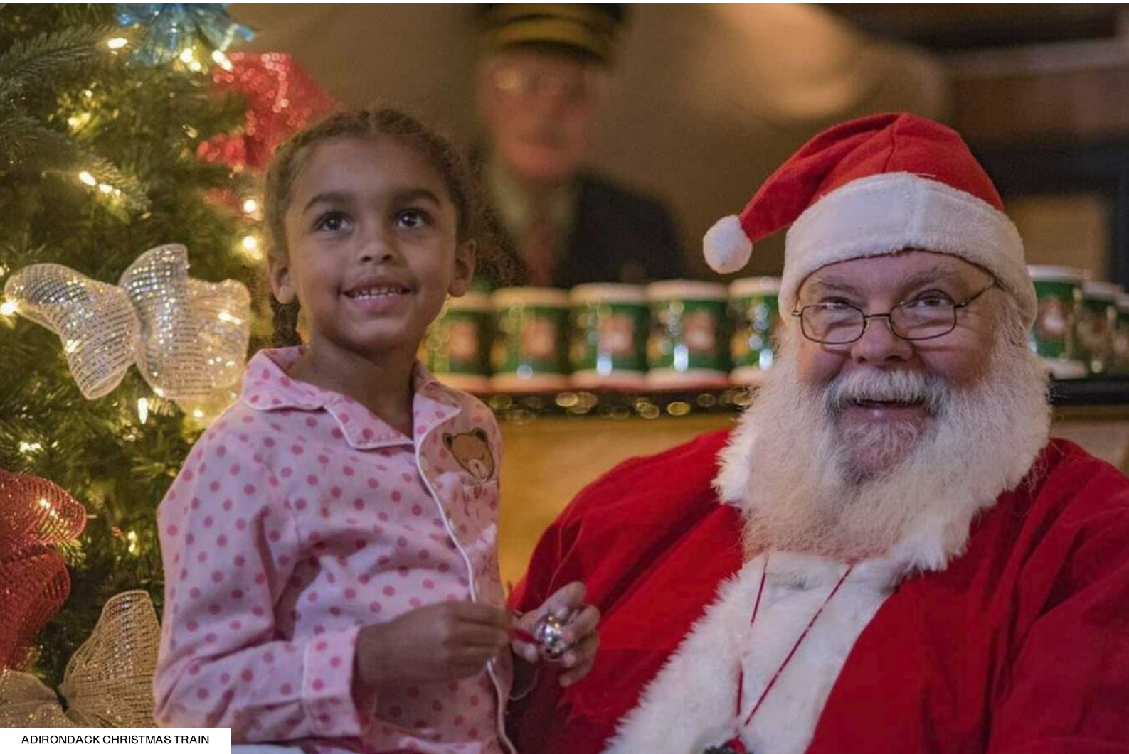
ADIRONDACK CHRISTMAS TRAIN