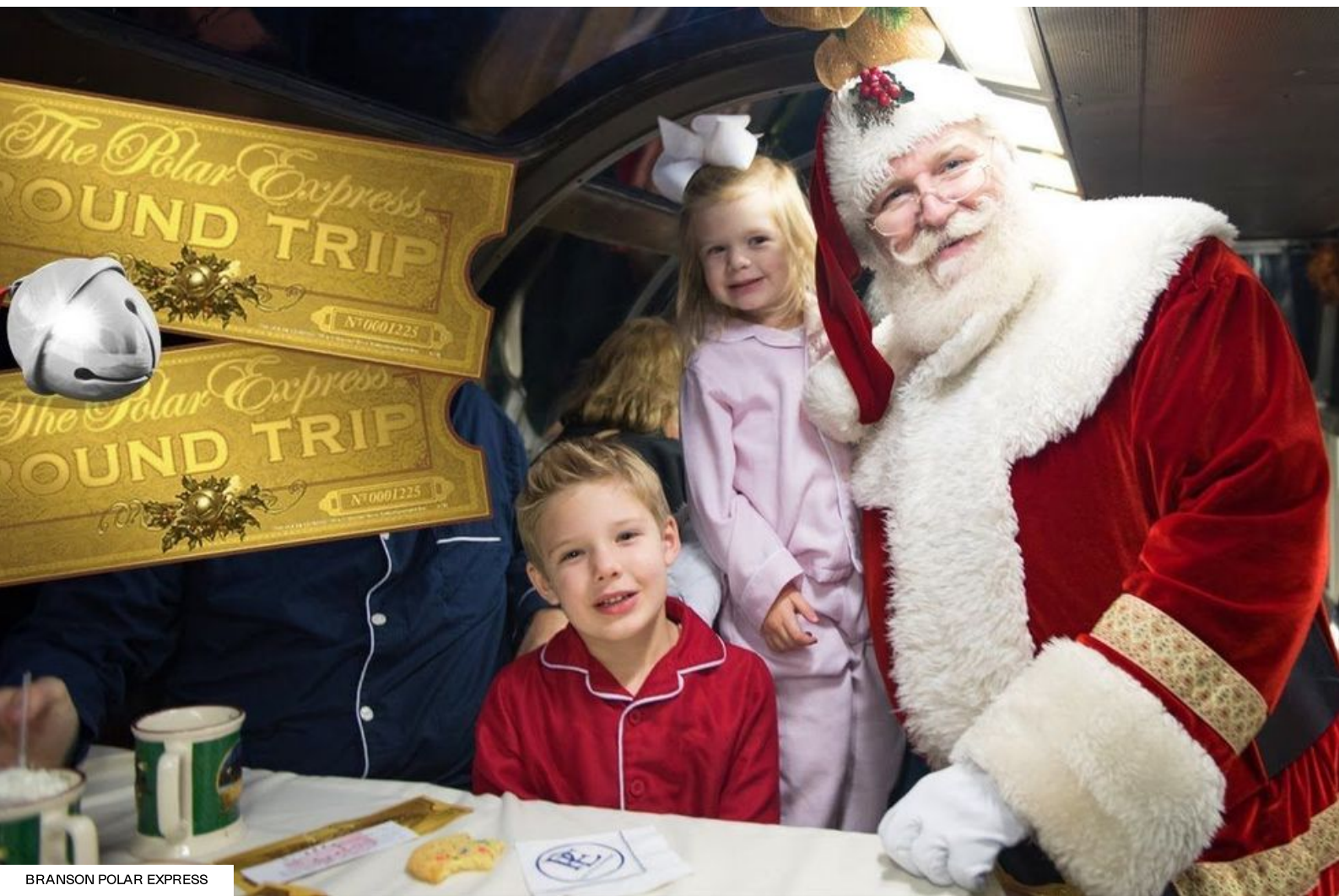
BRANSON POLAR EXPRESS