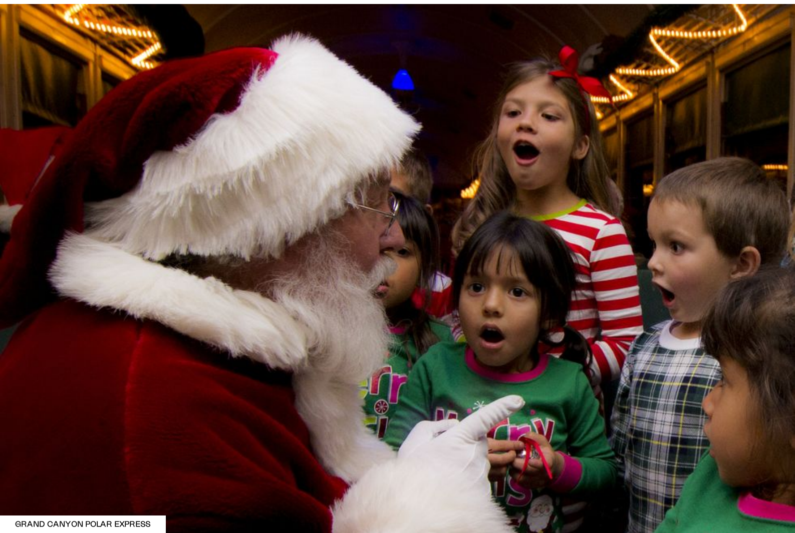
GRAND CANYON POLAR EXPRESS