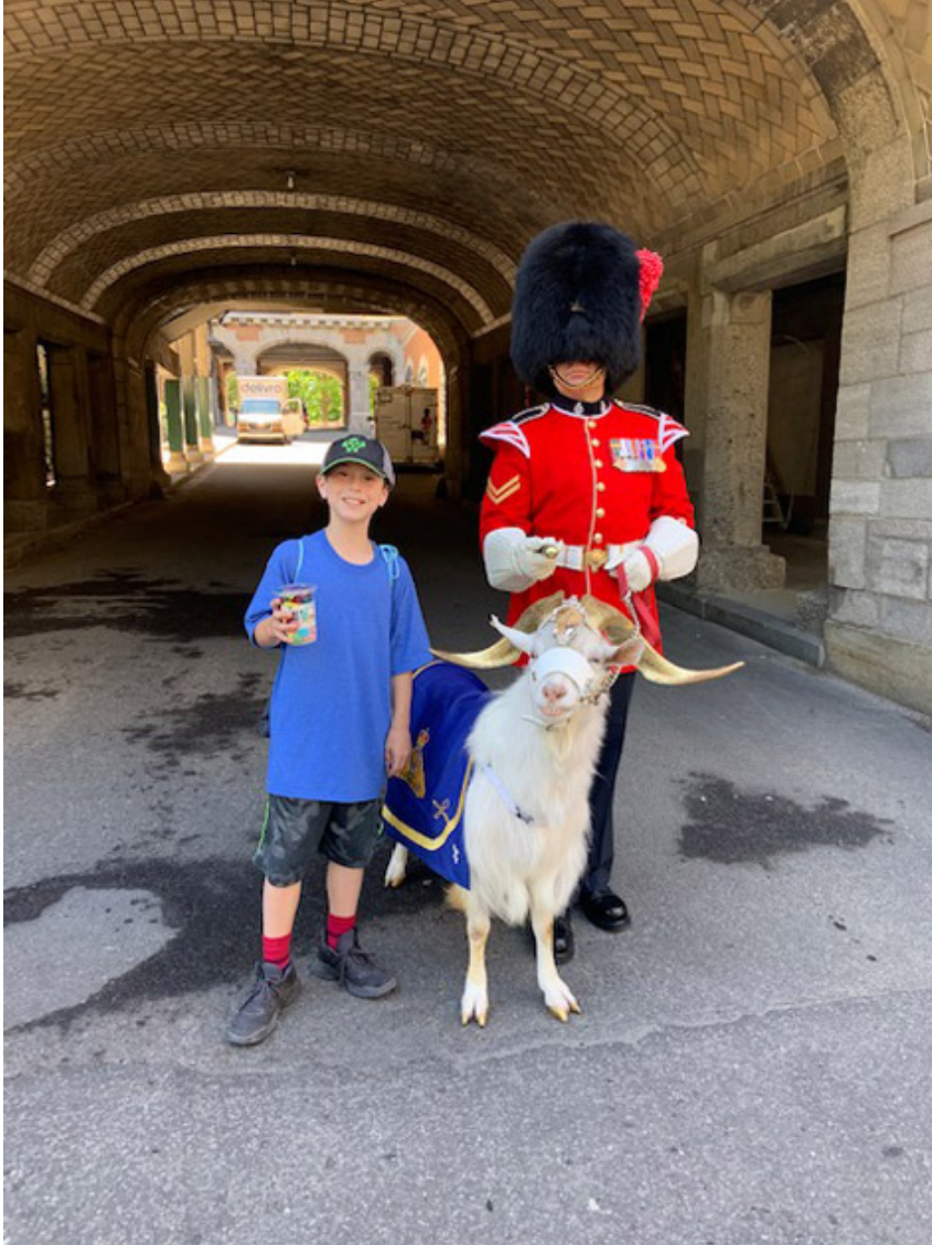
The author's son with a guard in Québec City, Canada

This activity was packed with both adults and kids—many people agree that it's a highlight of a visit to Québec. It's walking distance from the port, the Fairmont Le Château Frontenac, and the downtown area. Tours of the citadel are given hourly, but be sure to get there at 10am each morning when the changing of the guard happens. It's full of pomp and circumstance—complete with marching band—and the entire event takes approximately 35 minutes (even the little kids, with short attention spans, were spellbound, with mouths gaping).