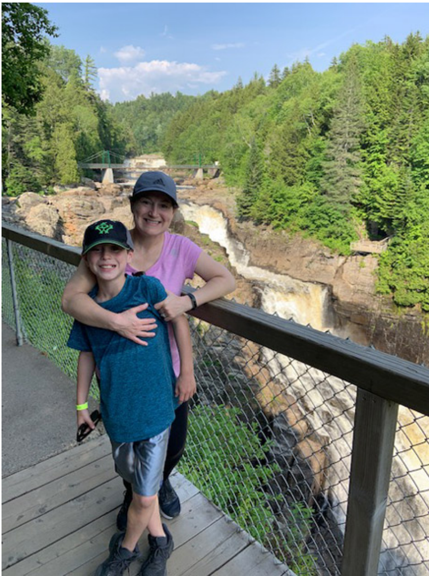
The author and her son at Canyon Sainte-Anne in Québec