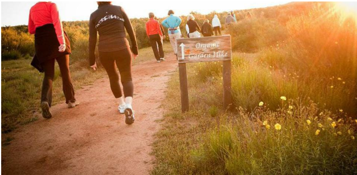
The Ranch attracts women traveling in groups as well as solo travelers. RANCHO LA PUERTA