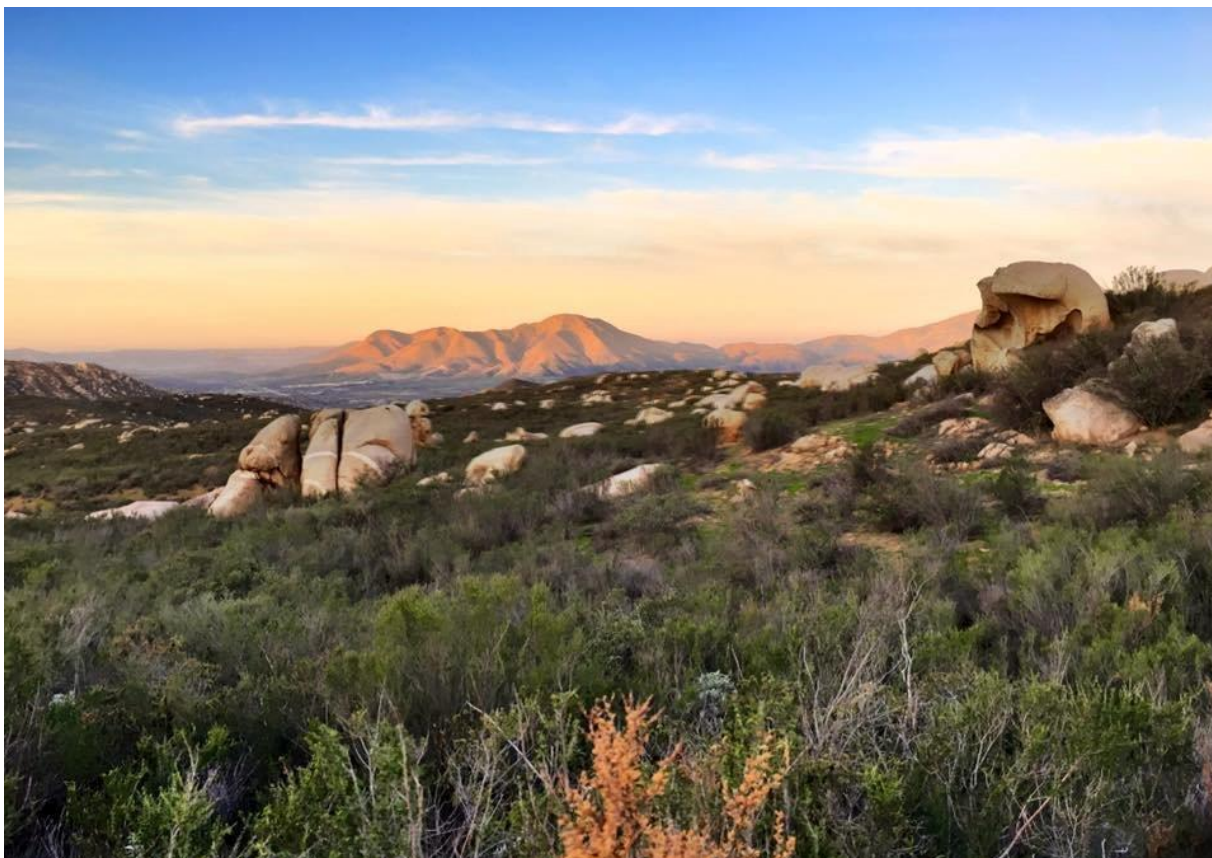
The Ranch is considered one of the best destination spas in the world. RANCHO LA PUERTA