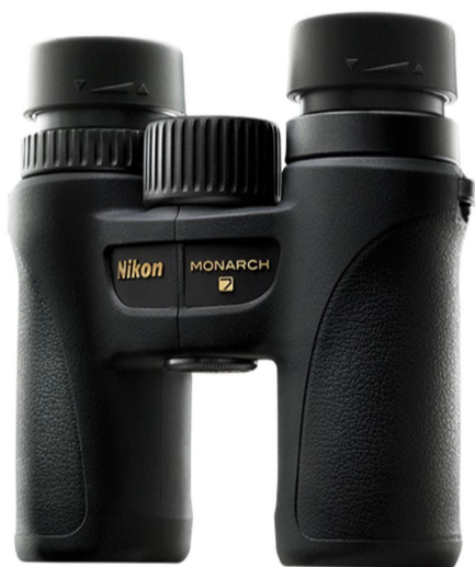
MONARCH 7 8x30 NIKON

Nikon: A great thing to have on a long a hike (whether mom is hiking in the Rocky Mountains, on an African safari, or bird watching in Guyana) is a great pair of binoculars.