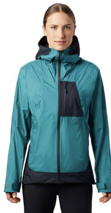
Gore-Tex Paclite jacket MOUNTAIN HARDWEAR

Mountain Hardwear : Speaking of rain, waterproof pants