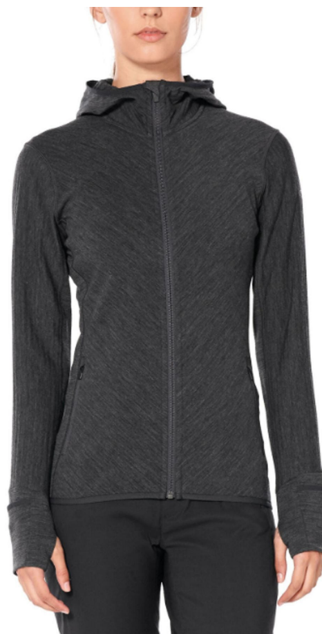
REALFLEECE DESCENDER LONG SLEEVE ZIP HOOD ICEBREAKER

The Pocket Hat is a nice option. It's made with 100 percent merino wool, reversible (so it's two colors in one), easy to carry and keep in your pocket, and lightweight. Another good option to keep mom's ears warm on cool spring or fall days is the Cool-Lite Flexi Headband . It's made of odor-resistant, moisture-wicking, and quick-drying fabric. If mom is more of a beanie than a headband person, the Cool-Lite Flexi beanie offers the same qualities as the headband but in an ultralight merino wool hat. If she needs something for colder weather, the Tech Trainer Hybrid Beanie is great for rainy, windy days. It will keep her warm but it's also