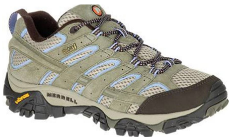
Moab 2 Waterproof boot MERRELL

The Moab 2 are a best-selling, classic waterproof boot. The breathable mesh lining, the rubber toe cap, the shock-absorbent heel, and the Vibram traction means mom won't slip and slide, no matter the weather. The