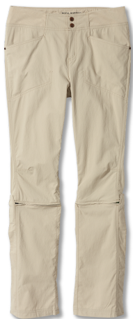
Women's Jammer Zip n Go pants ROYAL ROBBINS

You may opt out any time. Terms and Conditions and Privacy Policy .