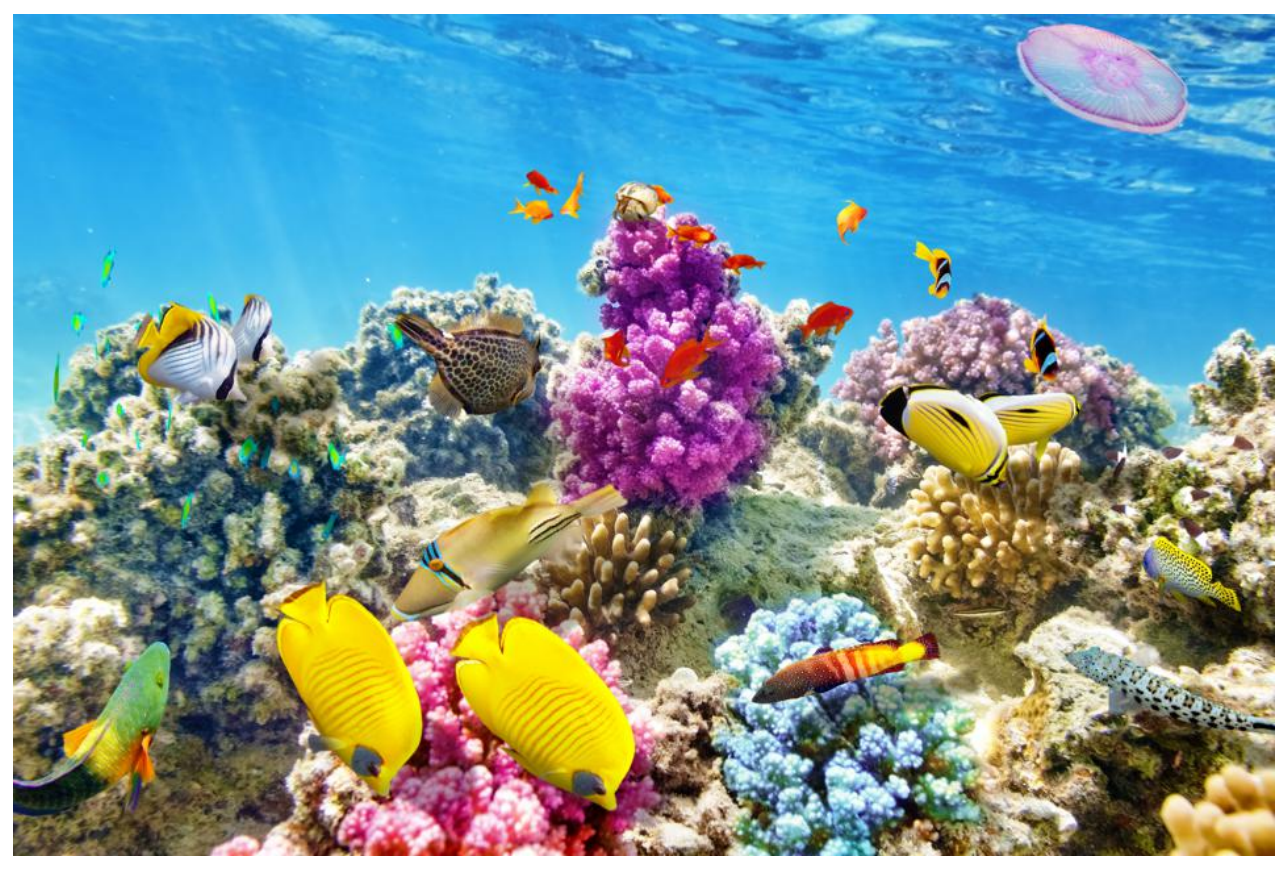
Belize has an expansive underwater world with colorful corals and tropical fish.

With more than 200 miles of coastline, Belize is world famous for its beautiful Caribbean landscapes. Travelers can snorkel, scuba dive, fish, windsurf, kayak, and enjoy the beautiful waters of Belize.