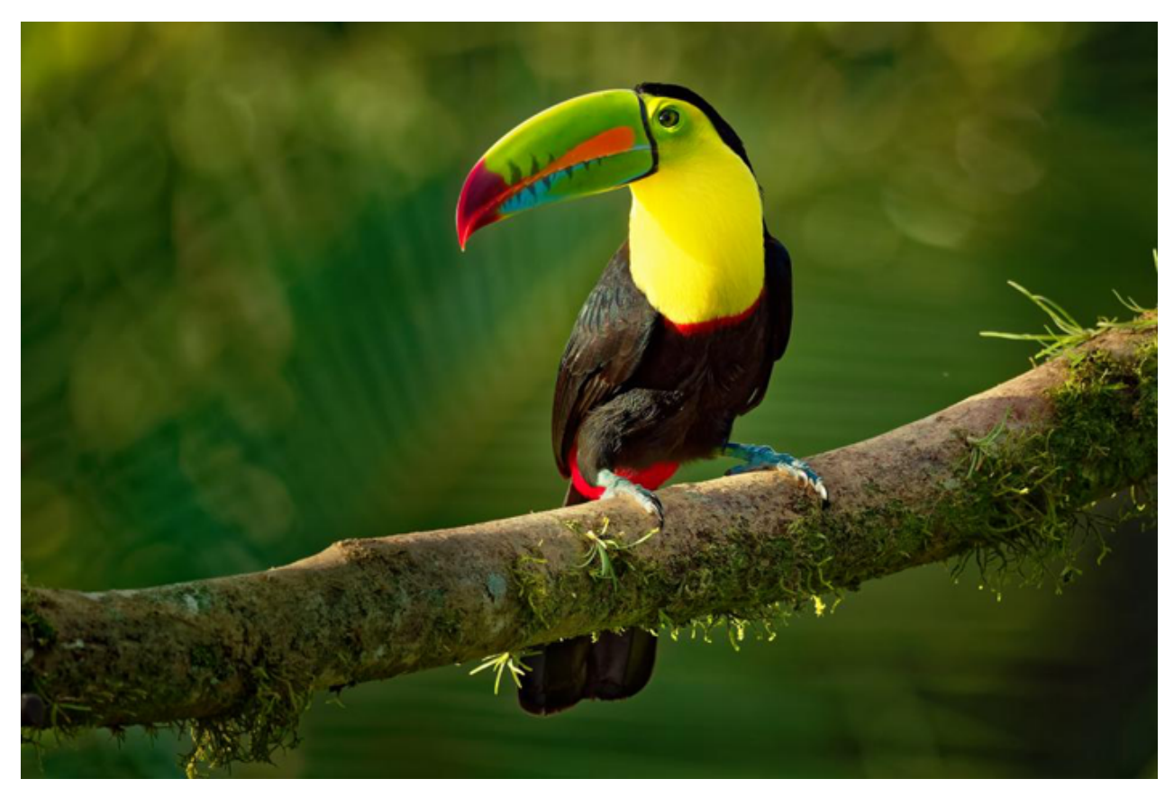
The toucan is the national bird of Belize.

There are direct flights from New York on United, American, and Delta. Anyone traveling with kids knows that direct flights are key. Plus, many people don't realize that Belize is the only English-speaking country in Central America—so language barriers are never an issue. Add to that the combination of so many activities and landscapes—Belize has the second-largest barrier reef in the world, plus impressive Mayan ruins, and