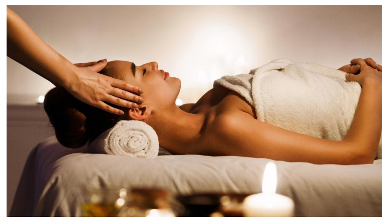
Wellness, including yoga and spa treatments, is a big draw in Belize.

Whether travelers are looking for a challenging yoga session, an inspirational hike, or a relaxing soak, the Placencia area of Belize—located in the southern part of the country—is the place to be.