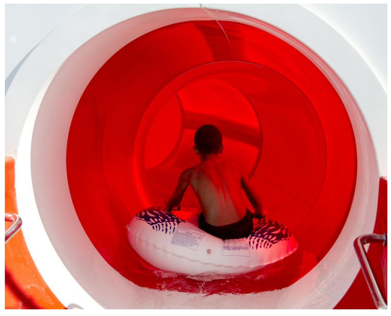
There are slides in the Dr. Seuss WaterWorks area.

The younger kids will love the Dr. Seuss WaterWorks, which has slides designed to combine thrill and whimsy. This water zone area, located on deck 12, includes The Cat in the Hat slide, which has 450 feet of twists and turns. The Fun Things slide, named after Thing 1 and Thing 2, is another kid-pleaser with 213 feet of twists, turns, and special effects like lights and polka dots. There's also a splash zone with a 300-gallon tipping bucket (always a kid favorite) and other fun water features.