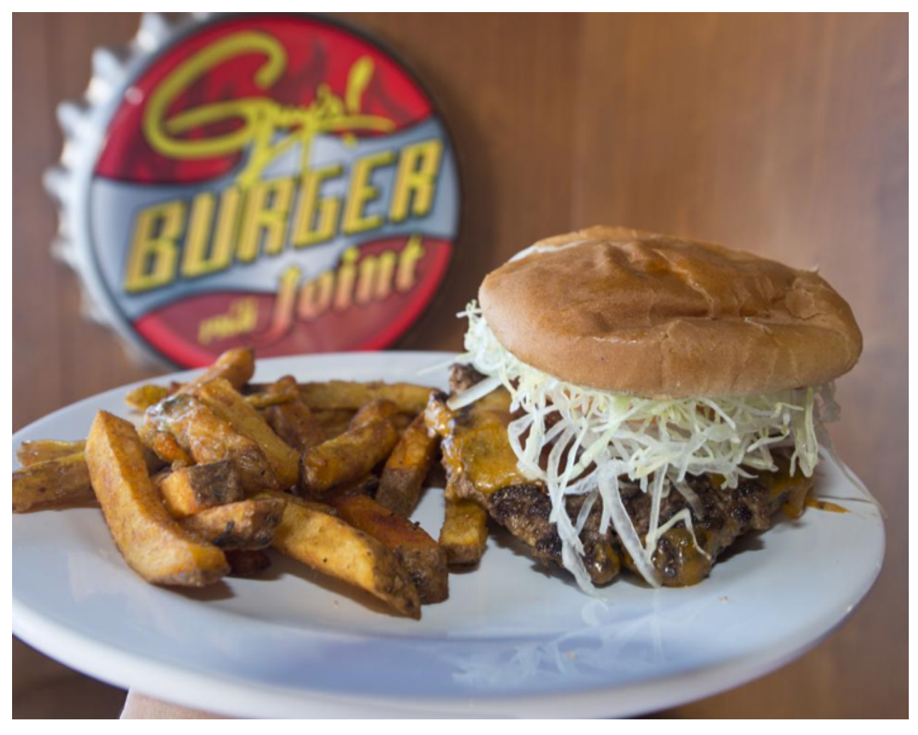
One of the favorite eateries aboard Carnival Horizon is Guy's Burger Joint.