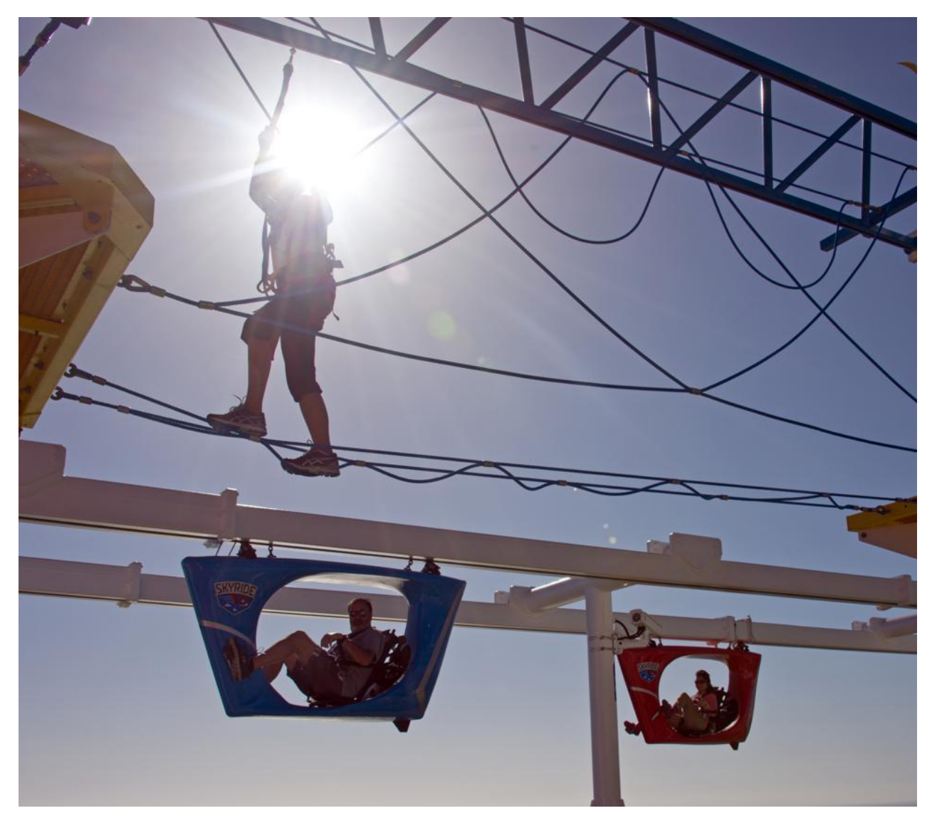
The SkyRide--a bike-ride-in-the-sky attraction--and the open-air ropes course were both big hits ... [+]