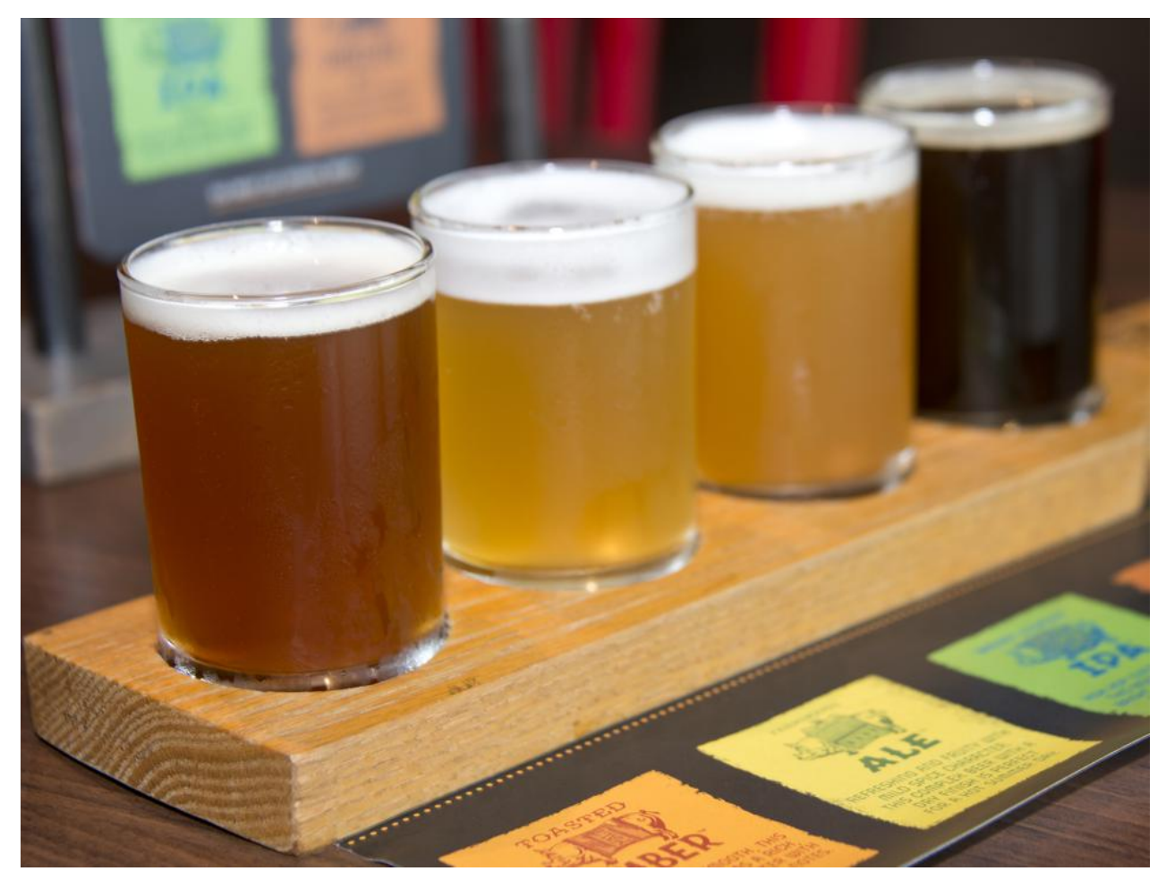
There are plenty of places to get an adult beverage aboard Carnival Horizon.

There are plenty of places for adults to have fun on the Horizon including the many bars onboard.