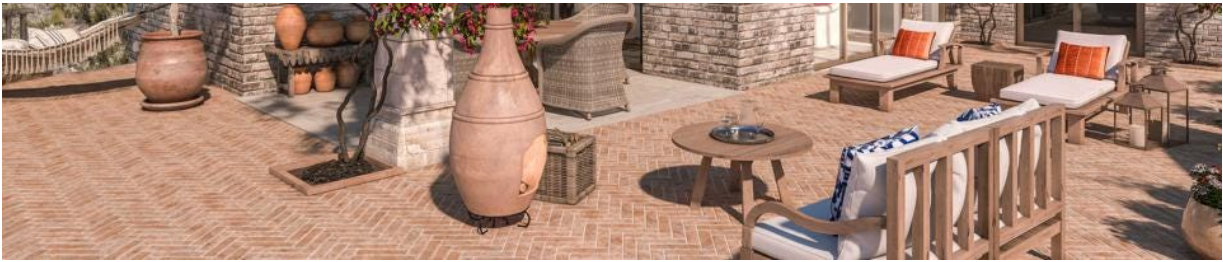
The Residences RANCHO LA PUERTA

Rancho La Puerta has announced plans for The Residences, a private, wellness-focused village nestled beside a vineyard with sweeping views of Mt. Muchumaa—in essence both connected, yet separate from, The Ranch. A Mediterranean-inspired landscape, the extensive gardens and walking paths will connect the village and vineyard to the surrounding mountains and canyons. Homeowners will have access to year-round amenities and concierge-style services.