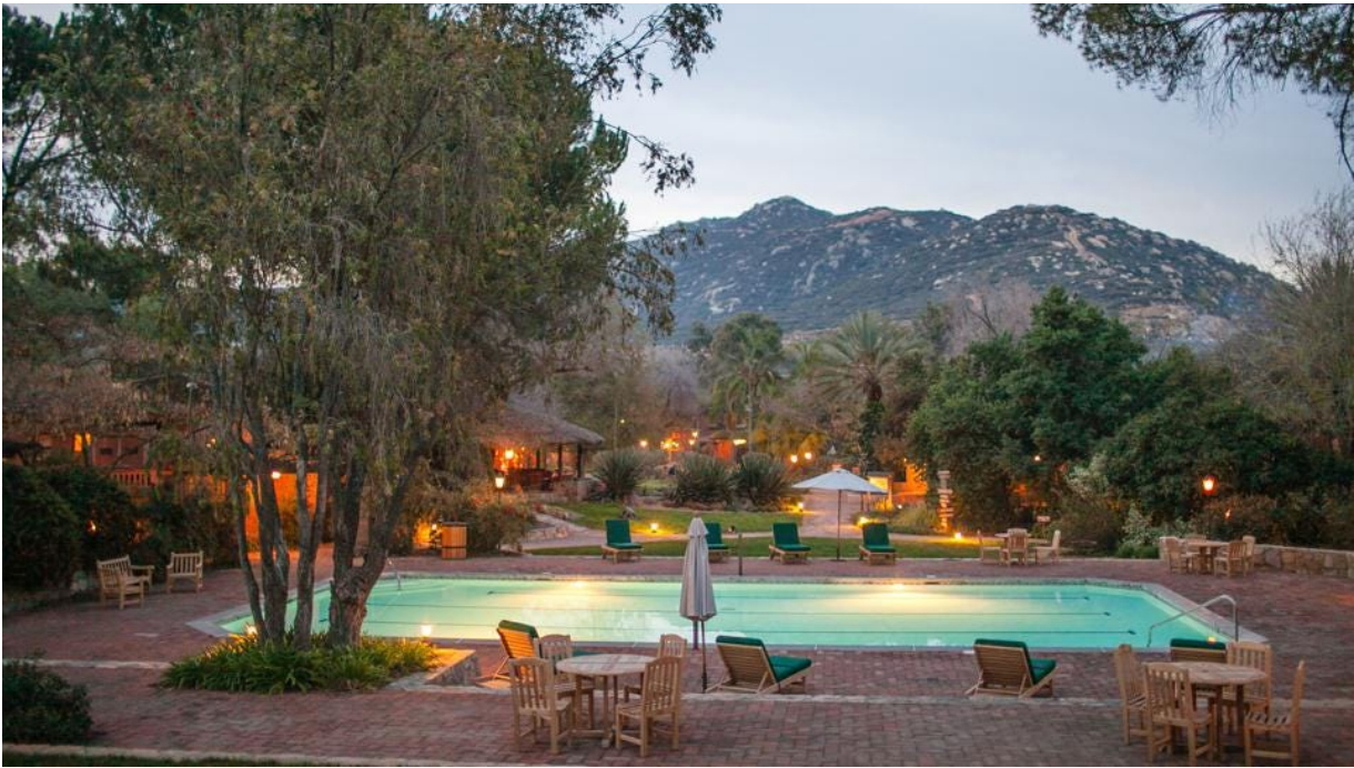
The sabbatical program focuses on balancing work and life. RANCHO LA PUERTO

Another new offering is the 21-Day Perfect Balance Sabbatical program. It's a work-life balance retreat. Those in the program will focus on their health by recharging with fitness classes, spa treatments and workshops, while also staying digitally connected to maintain a flexible work-life balance. The program includes private Villa Cielo accommodations with in-room Wi-Fi; spa treatments; private wellness and fitness consultations; cooking classes; and access to the Ranch's programming including yoga, meditation and nutritional classes.