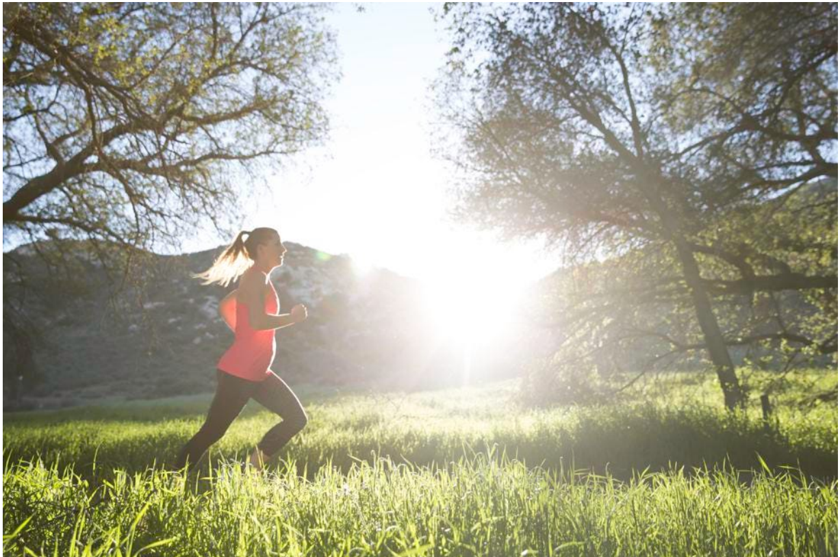
There are a variety of fitness classes and programs. SCOTT DRAPER

You may opt out any time. By signing up for this newsletter, you agree to the Terms and Conditions and Privacy Policy .