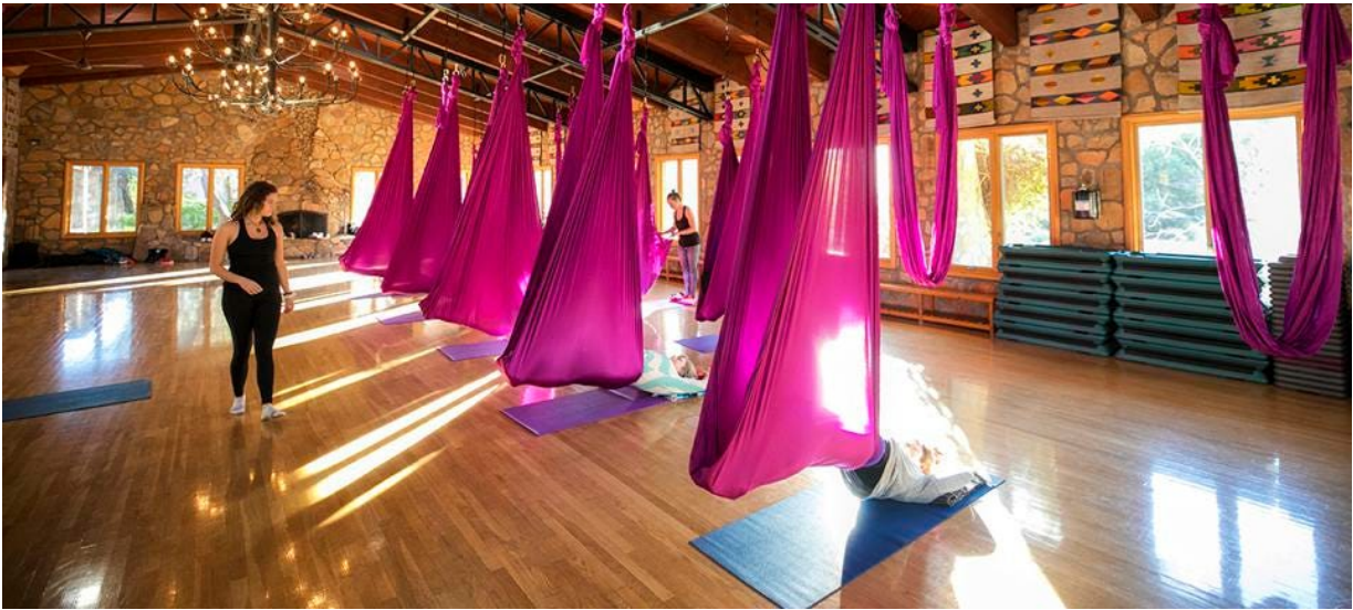
Aerial yoga SCOTT DRAPER

Aerial yoga has been added to The Ranch's list of activities. This class focuses on hip stretches and restorative yoga moves all performed in a silk-like hammock suspended in the air. Ranch has also added new programs including water-related classes like Aqua Board, Deep Water Training, H2O Boot Camp, Feel Comfortable In The Pool, Shallow Water Workout, Swim Conditioning, Swim Clinic, Water Jogging, Water Polo On The Noodle, and Water Volleyball. Additionally, pickleball has been added and classes are offered for beginner, intermediate and advanced levels. Bounce programming is another new addition—these classes focus on core strength, and improve coordination while bouncing on a trampoline while putting less stress on the joints.