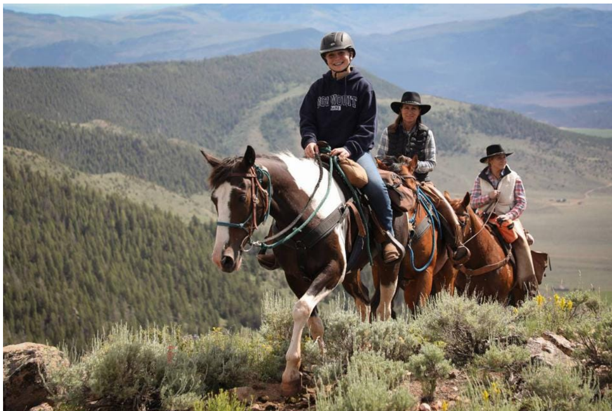
Black Mountain Ranch offers plenty of activities, including daily rides.

Black Mountain Ranch located in the Rocky Mountains of Colorado is an all-inclusive dude ranch and includes plenty of activities for families looking for a one-stop-shop vacation. There's unlimited horseback riding, whitewater