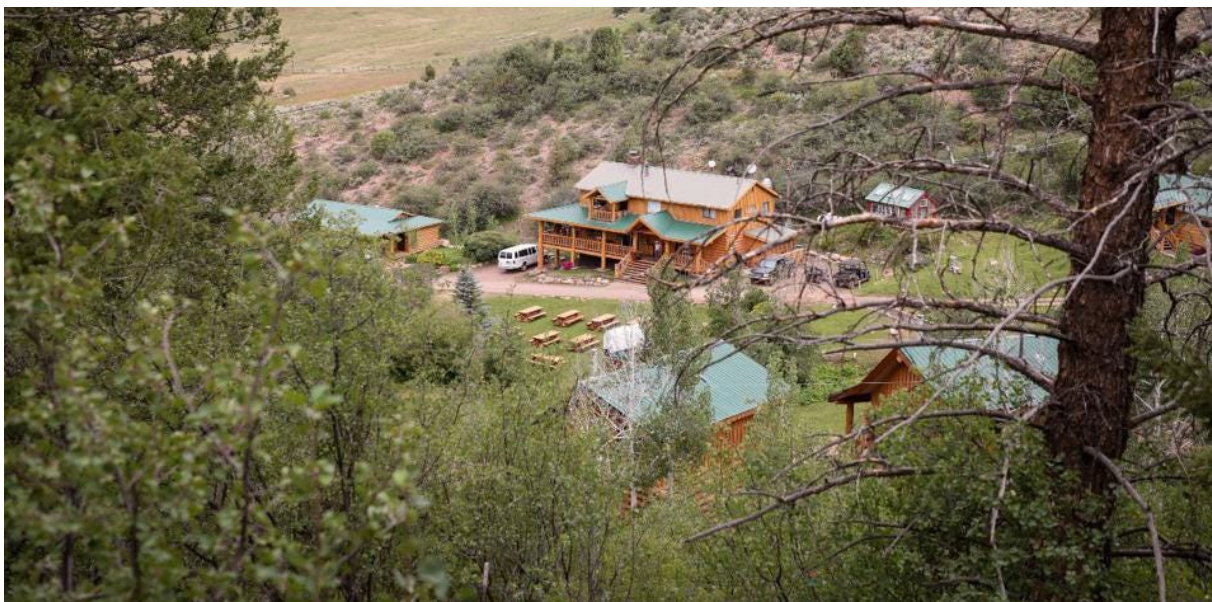
Black Mountain Ranch has 12 lodging options. NICOLA CORNWELL

The accommodations are nice. Rustic, but lovely. Cabins differ in size (how many bedrooms, bathrooms), but they also have a porch with a view. There are 12 lodging spots in total—eight cabins and four standard studios. The occupancy is 40 guests maximum and that makes for a great size for socializing and getting to know each other. The ranch also has washers and dryers on-premise which is a wonderful way to pack light, knowing you have the option to wash the clothes. Getting dirty and dusty during the day is part of the fun, and being able to wash all that grime off and wear the same clothes is ideal. There's also a saloon where the parents can have an evening drink, while the kids play ping pong or cards.