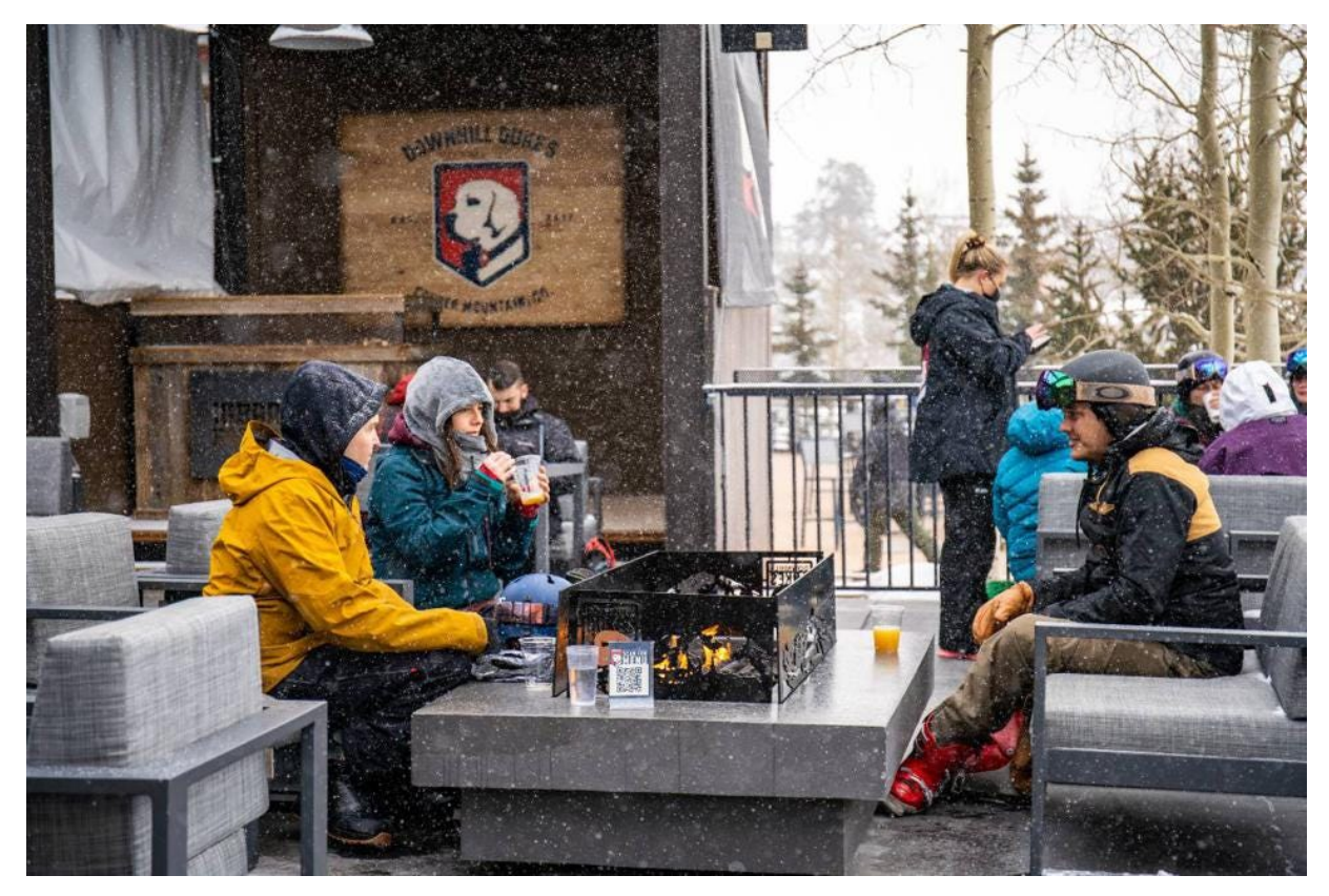
Downhill Duke's COPPER MOUNTAIN

Copper Mountain has three pedestrian villages, which means it has plenty of restaurants that offer up specialty craft beer and cocktails as well as tasty meals. Sit down to a freshly-prepared Italian meal at Sawmill Pizza & Taphouse, Copper's newest restaurant in Center Village. Or head to JJ's Rocky Mountain Tavern in the East Village for some of the best burgers to be had. For morning grab-and-go options before hitting the slopes, there's Jack's Slopeside grill, which has tasty breakfast sandwiches and a nice selection of coffee drinks.