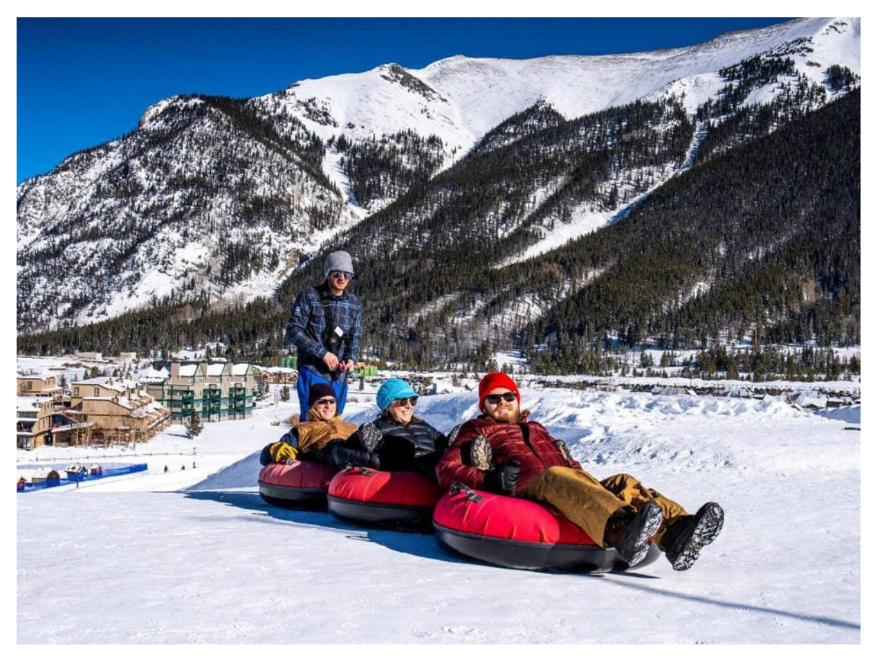
Tubing is a popular activity. COPPER MOUNTAIN

Kids (and adults) like variety and after a day or two of skiing, it's time to hit the Woodward Barn—a 20,000 square foot playground for all ages. It has it all—including multiple skate, scooter and BMX zones, indoor ski training tools, plus five Olympic-grade trampolines. It's a great way to get off the slopes for a few hours and still have a lot of fun.