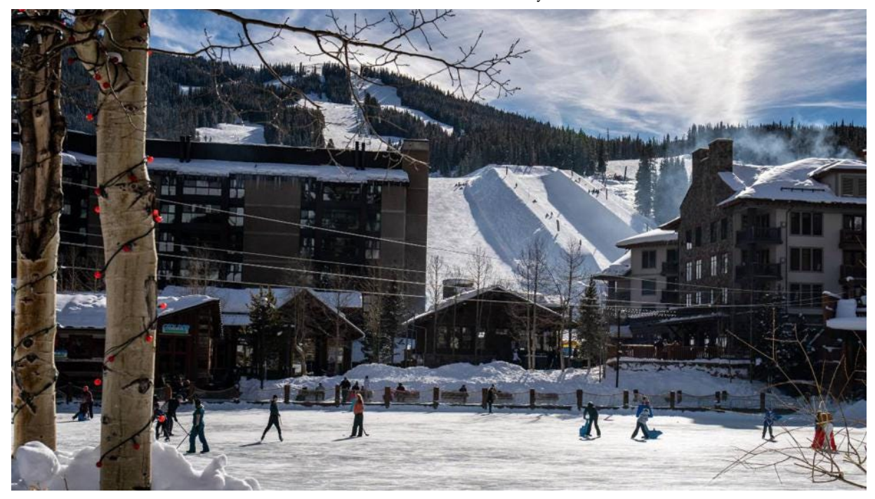
Ice skating is another family-friendly activity. COPPER MOUNTAIN

The tubing, coaster rides, ice skating and snowshoeing are especially ideal for those members of the family who don't ski (or prefer a diverse array of activities on their active winter vacation).