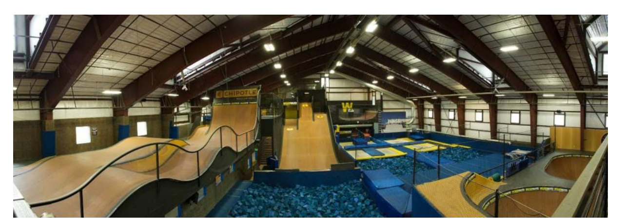
Woodward Barn COPPER MOUNTAIN

You may opt out any time. By signing up for this newsletter, you agree to the <u>Terms and Conditions</u> and <u>Privacy Policy</u>