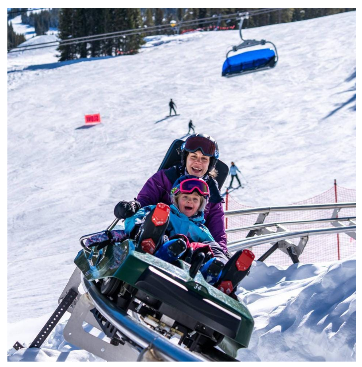
Rocky Mountain Coaster COPPER MOUNTAIN

Don't forget to set aside some time for tubing, coaster rides, ice skating and snowshoeing. Experience the thrill of sliding down Copper's four-lane tubing hill. Located in East Village, the tubing hill offers the thrill of racing down a snowy slide, reaching high speeds while navigating banked turns.