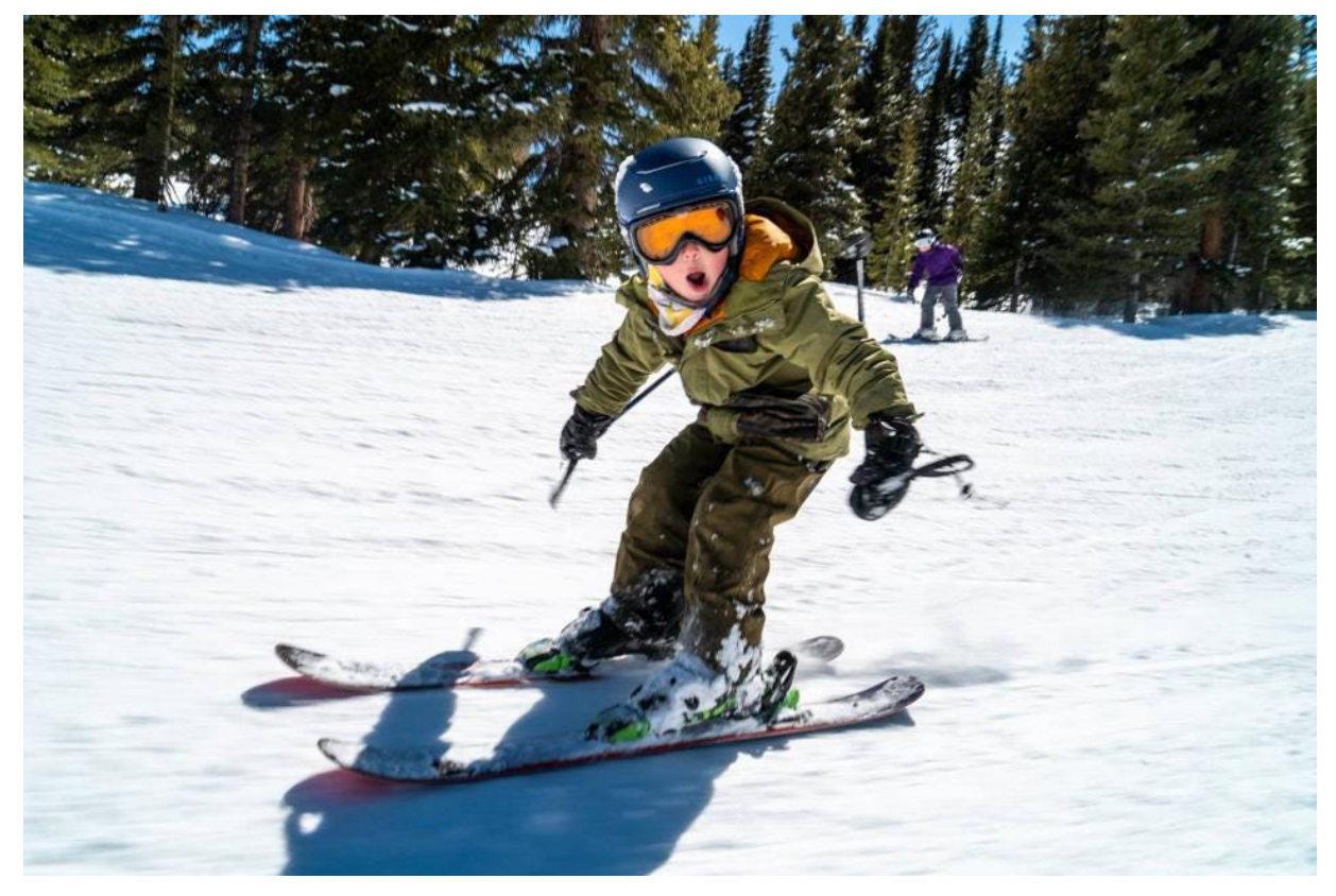
Lessons are for both kids and adults.

One of the best ways to improve skills is through half-day or full-day group and private lessons. Lessons run the gambit between beginners and those seasoned skiers looking to hone their jumps. Individual lessons are a great way to customize and tailor your experience. Group lessons are available for both kids and adults and group sizes are limited.