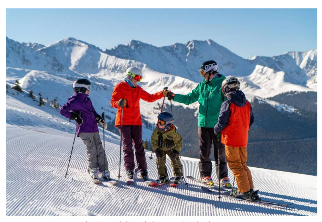
Copper Mountain attracts families with kids of all ages and ski levels. COPPER MOUNTAIN

Copper Mountain is located just 75 miles from Denver and is an ideal getaway for families looking for adventure on and off the slopes.