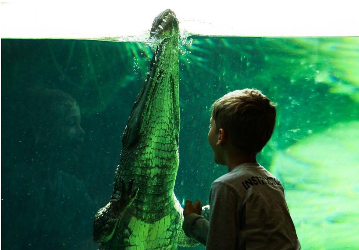
Al Ain Zoo ABU DHABI

A day or two at Sir Bani Yas Island is often on the itinerary for families. It's one of eight islands making up the desert islands of Al Dhafra. Sir Bani Yas Island has a variety of water sports, including sailing, snorkeling, diving and kayaking. For more laid-back fun there's a sunset cruise. At the Arabian Wildlife Park families can go on 4x4 safaris with guides to see a variety of animals including Arabian oryx, gazelles, giraffes, hyenas and cheetahs. The reserve is home to more than 17,000 free-roaming animals and is an ideal way to teach kids about nature. For fans of equestrian activities, the Sir Bani Yas Stables, allows kids and adults to go horseback riding in nature.