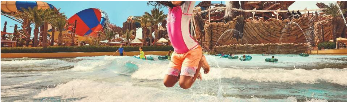
Yas Waterworld Abu Dhabi waterpark ABU DHABI

The Yas Waterworld Abu Dhabi waterpark is another family-favorite spot. It has over 40 rides and attractions. One of the most popular is the Dawwamma, the hydromagnetic-powered, 780 foot-long, six-person tornado waterslide. There's also the nine-foot-high waves on Bubble's Barrel, which boasts one of the world's largest surfable sheet wave for flow boards and bodyboards. The Bandit Bomber, boasts onboard water and laser effects, with riders shooting jets of water at targets, dropping water bombs and triggering special effects. The waterpark also has a variety of on-site restaurants as well as a souk and pearl-diving exhibits.