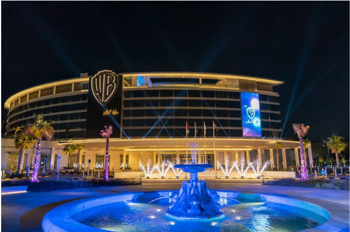
The WB Abu Dhabi Hotel ABU DHABI

The world's first Warner Bros. hotel opened in Abu Dhabi on Yas Island late last year.