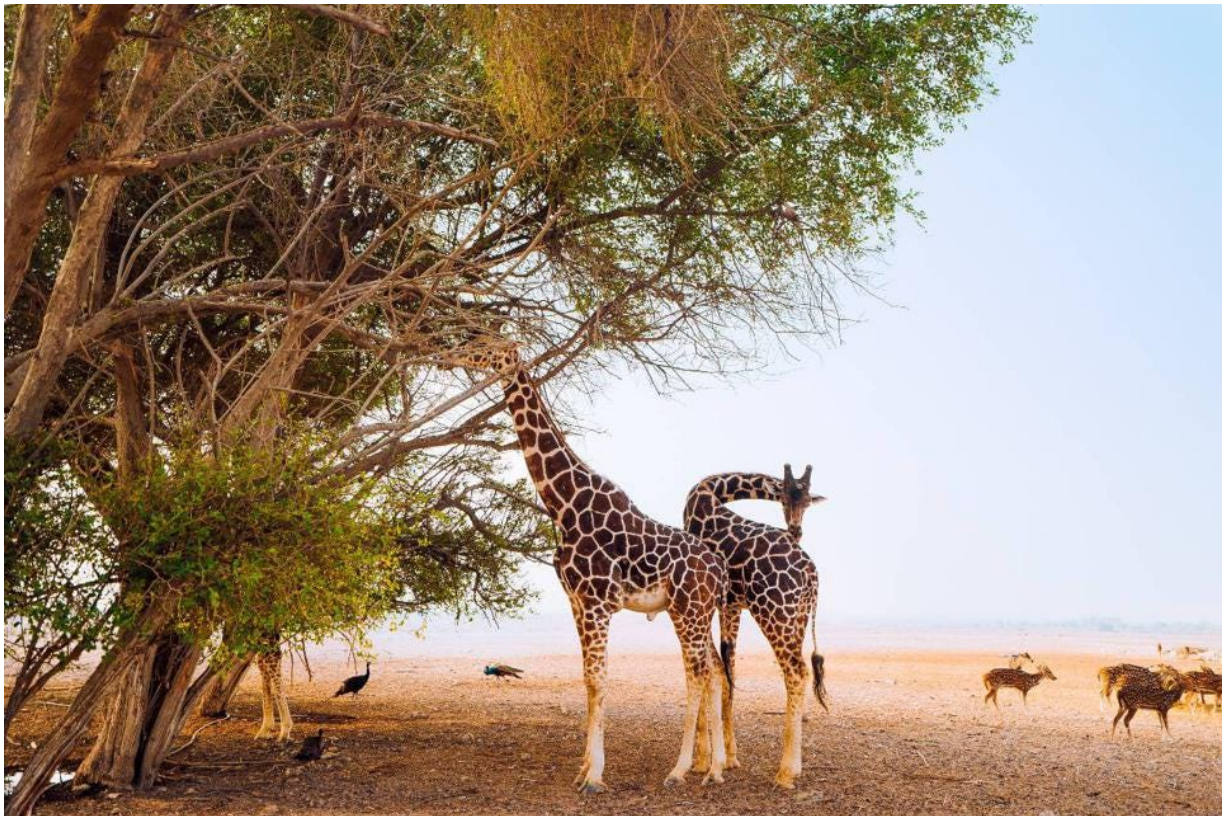
Free roaming giraffes and other animals can be seen at the family-friendly Arabian Wildlife Park. ABU DHABI