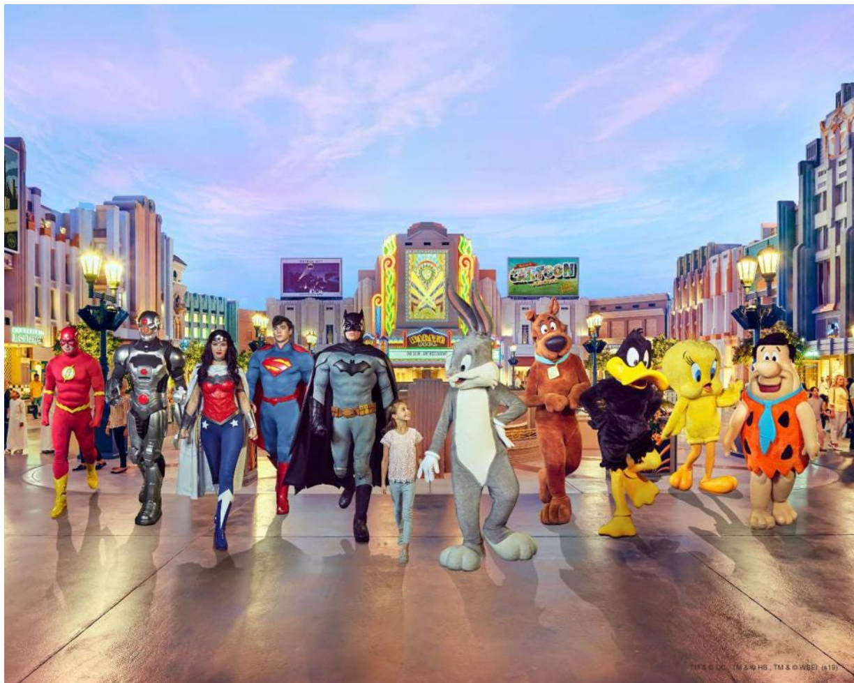
The Plaza at Warner Bros. World Abu Dhabi. ABU DHABI