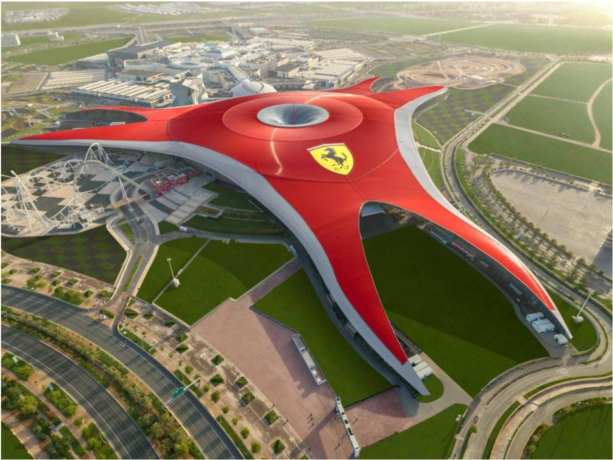
Ferrari World ABU DHABI

Other nearby attractions include Ferrari World, the world's first Ferrari-branded theme park. It is open every day of the year and has over 20 rides and attractions, plus shopping and dining. One of the highlights is the Formula Rossa—the world's fastest roller-coaster. It goes from 0 to 240km/h in 4.9 seconds, while soaring to heights of over 170 feet. The park also has a family zone, state-of-the-art simulators, electric-powered go-karts, live shows and a vast collection of racing memorabilia.