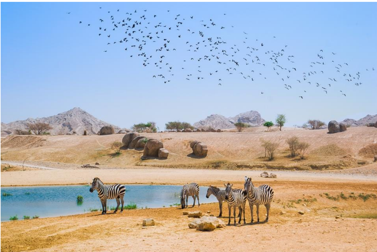
Sir Bani Yas Island Arabian Wildlife Park ABU DHABI

The Yas Waterworld Abu Dhabi waterpark is another family-favorite spot. It has over 40 rides and attractions. One of the most popular is the Dawwamma, the hydromagnetic-powered, 780 foot-long, six-person tornado waterslide. There's also the nine-foot-high waves on Bubble's Barrel, which boasts one of the world's largest surfable sheet wave for flow boards and bodyboards. The Bandit Bomber, boasts onboard water and laser effects, with riders shooting jets of water at targets, dropping water bombs and triggering special effects. The waterpark also has a variety of on-site restaurants as well as a souk and pearl-diving exhibits.