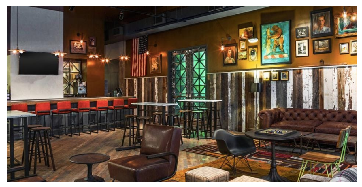
The restaurant within The Westin Cleveland Downtown focuses on farm-fresh ingredients. THE WESTIN CLEVELAND DOWNTOWN

Their brownie hot fudge sundae and their root beer floats are just two fan favorites.