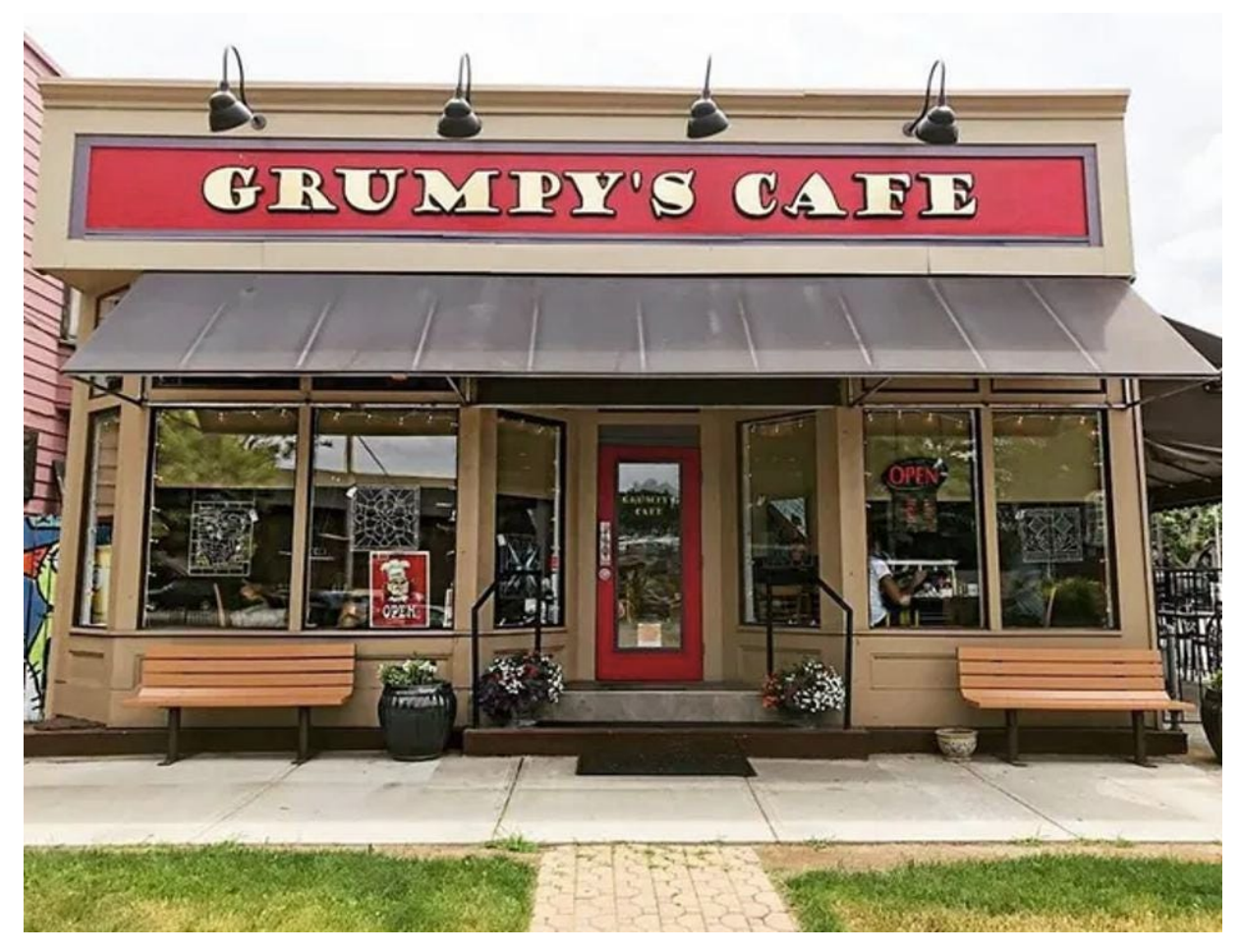
Fresh food served with a warm slice of hospitality. GRUMPY'S CAFE

Located in the Tremont neighborhood Grumpy's Café is a local favorite—and for good reason. It features fresh "feel good" ingredients in the Cleveland-style comfort food way. Breakfast favorites include omelets, eggs benedict, breakfast tacos, waffles, French toast and pancakes. Lunch specialties include meatloaf, burgers and a variety of sandwiches. While the the name is Grumpy's the staff is anything but. Yummy food served up with a smile and Cleveland's friendly hospitality.