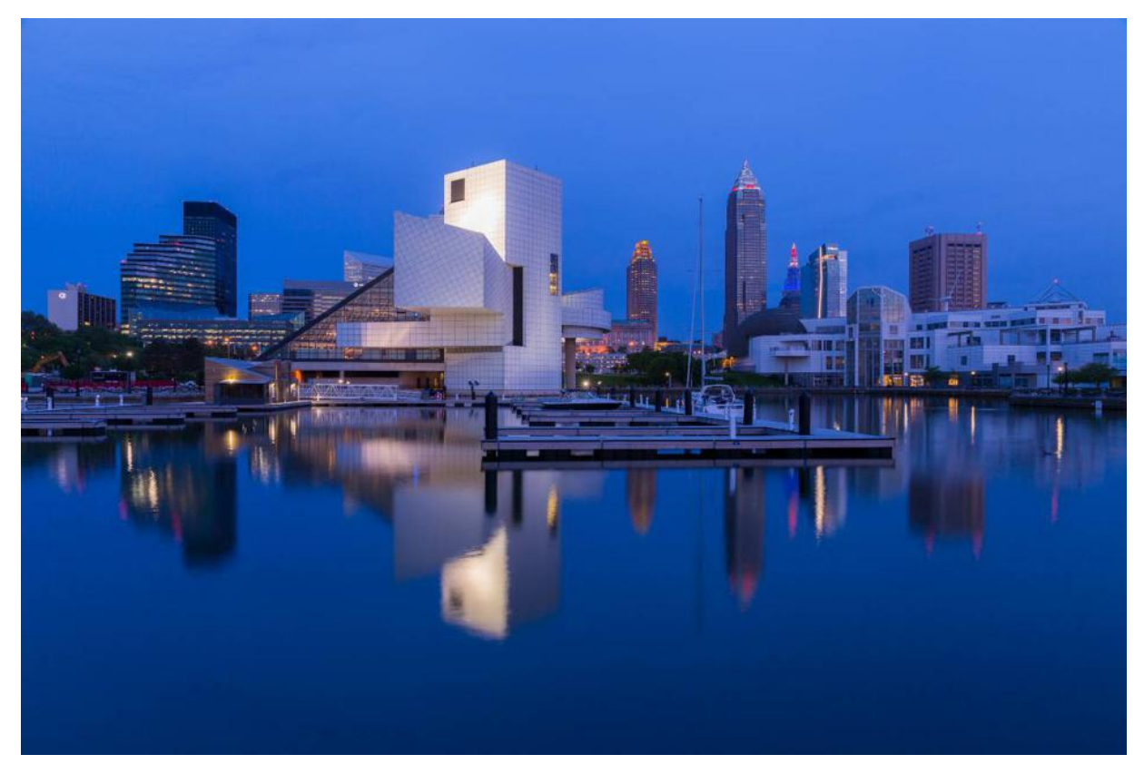
There are plenty of great hotels in Cleveland, including those on the water. CLEVELAND

Westin Cleveland Downtown has a great location just a short distance from the Rock & Roll Hall of Fame, Great Lakes Science Center, and Cleveland Convention Center. The Drury Plaza Hotel Cleveland Downtown is an upscale 189-room property located in a historic building. The newly renovated Crowne Plaza Cleveland at Playhouse Square has thirty-six new chandelier suites, which mimic the adjacent Playhouse Square chandelier.