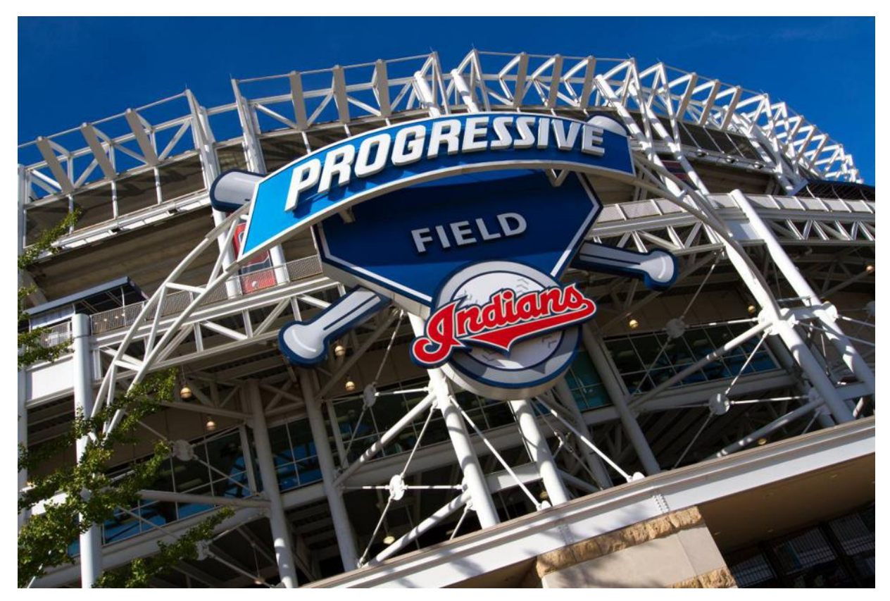
The Browns, the Indians, and the Cavaliers all call this city home.