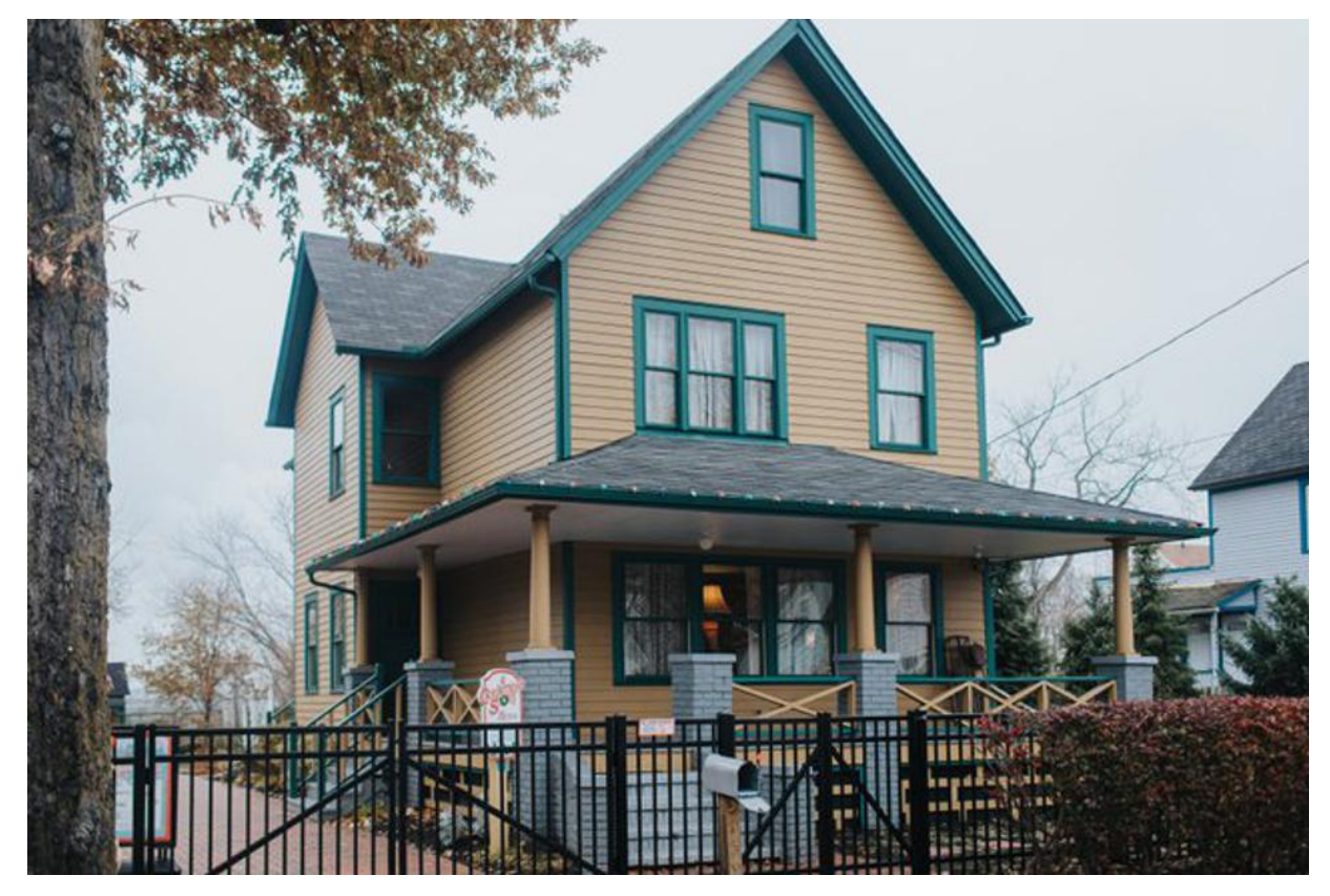
The house made famous in A Christmas Story.

Looking for something a little different? Visit "A Christmas Story House" to see the original "fra-gee-lay" leg lamp from the favorite holiday movie. Or take a trip to the National Cleveland-Style Polka Hall of Fame, which traces the story of the city's homegrown sound from its roots in the old Slovenian neighborhoods to nationwide popularity. Lastly, take the family to the Troll Hole Museum, which is in the Guinness World Records for the largest collection of troll dolls.