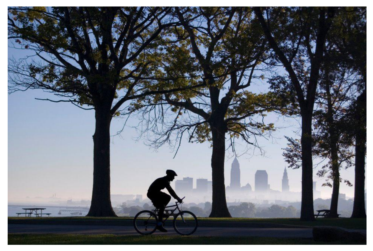
Many people don't realize how biker-friendly this city is.

The 55,000 acres of parkland between the Cuyahoga Valley National Park and the region's metro park system, affectionately known as the "Emerald Necklace," provide plenty of opportunities for urban outdoor adventure. For a unique experience, climb aboard the Cuyahoga Valley Scenic Railroad, one of the oldest tourist excursion railways in the country, to experience a train ride through the national park. Or hike one of the amazing trails found