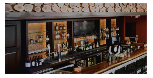
Sausalito is known for their drinks as well as their food.

Sausalito on 9th has a great location walking distance from all the sports stadiums, so it's a great spot for lunch, dinner or drinks either before or after a Cavalier, Browns or Indians game. Fan favorites include the burgers,