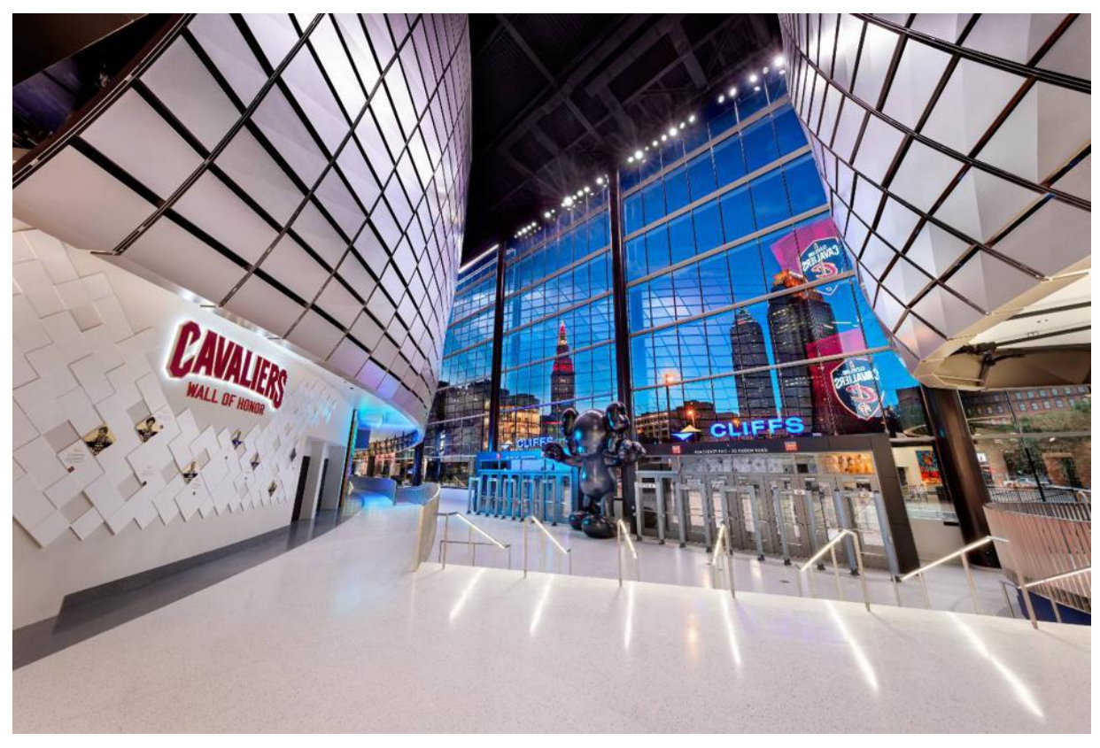
Rocket Mortgage FieldHouse recently underwent a $185 million transformation.

Are you a sports enthusiast? Did you know that Cleveland currently hosted the 86th NFL draft? Plus, it has been tapped to host many big sporting events like the 2022 NBA All-Star Game and 2024 NCAA Women's Final Four, solidifying the destination as a world-class sports hub. This summer the area is slated to host the Pro Football Hall of Fame's Enshrinement Festival on August 5 to 9, in Canton, Ohio, a short drive from Cleveland. Sports fans can see and interact with their icons as more than 100 Gold Jackets (living Hall of Famers) return each year to be a part of Enshrinement Week. And, of course, you can't visit Cleveland without taking in a game—The Browns, the Indians, and the Cavaliers all call this city home.