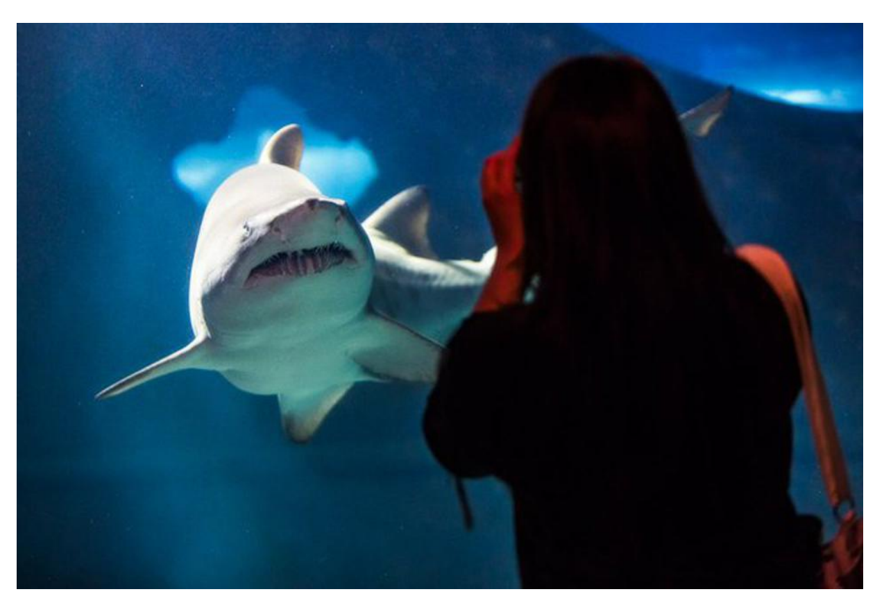
The Greater Cleveland Aquarium

There's the Cleveland Metroparks Zoo (tiger cubs are the newest addition and they are adorable!), The Cleveland Botanical Garden, the Greater Cleveland Aquarium, and plenty more. Plus, Cedar Point's 150th Anniversary Season opens on May 14. It featured a daily festival in the park's Frontier Land with live music, interactive games, street entertainers, and special food and drink menus, along with a nightly multisensory parade with more than 100 performers and a dozen illuminated floats.