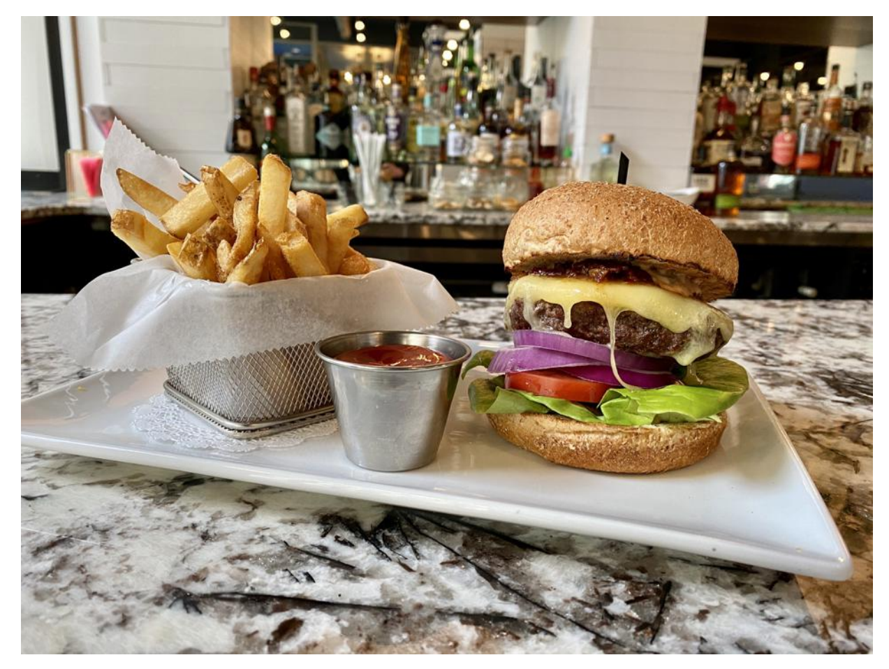
The burger is one of the most popular dishes served at Betts, a restaurant that opened in August of ... [+] BETTS