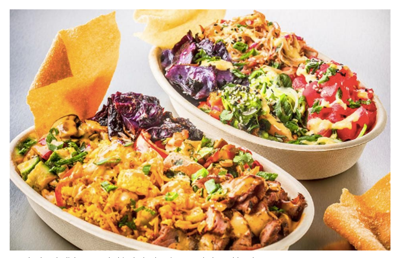
Popular lunch dishes at Rebol include the signature bols and broths. REBOL

option; it's made with hydroponic romaine, kale, white anchovies and parmesan. The bar serves a nice selection of beer, wine and mixed drinks.