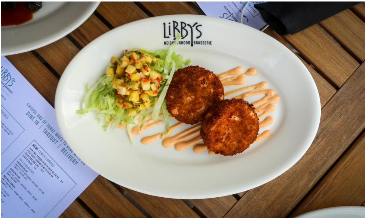
The crab cakes are one of the most popular dishes at Libby's. LIBBY'S NEIGHBORHOOD BRASSERIE

Grove restaurant opened just a few years ago (December 2018) but has quickly become a popular spot. They have an expansive menu with the focus on locally sourced ingredients made from scratch in the kitchen. The craft bar is a big draw and has unique infusions and four types of house-made bitters. The bar itself is a great place to take in the vibe of the restaurant and interact with locals. Some of the most popular dishes are the crab cakes, scallops benedict, ahi tuna nachos, and prime rib (offered Friday and Saturday nights).