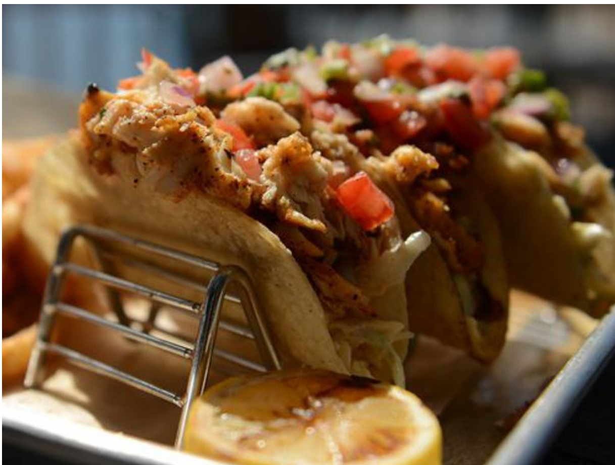
The fish tacos are a big hit. SEAFOOD SHACK, MARINA, BAR & GRILL

is the perfect portion for a snack or dessert. Everyone has their fan favorite. Grandma’s Key Lime always sells out and is most requested, but other favorites include Peanut Butter Dream, Chocolate Delight, Chocolate Chip, Salted Caramel, Snickers, and Blueberry Lemon. They are so delicious that after sampling them, people often order a dozen to go to share with friends and family. (You’ll be the favorite, for sure.) In addition to cheesecake, the café serves lunch with includes a variety of sandwiches, flatbreads, and salads. The Greek and Italian salad dressings are family recipes that date back for decades (and are delicious).