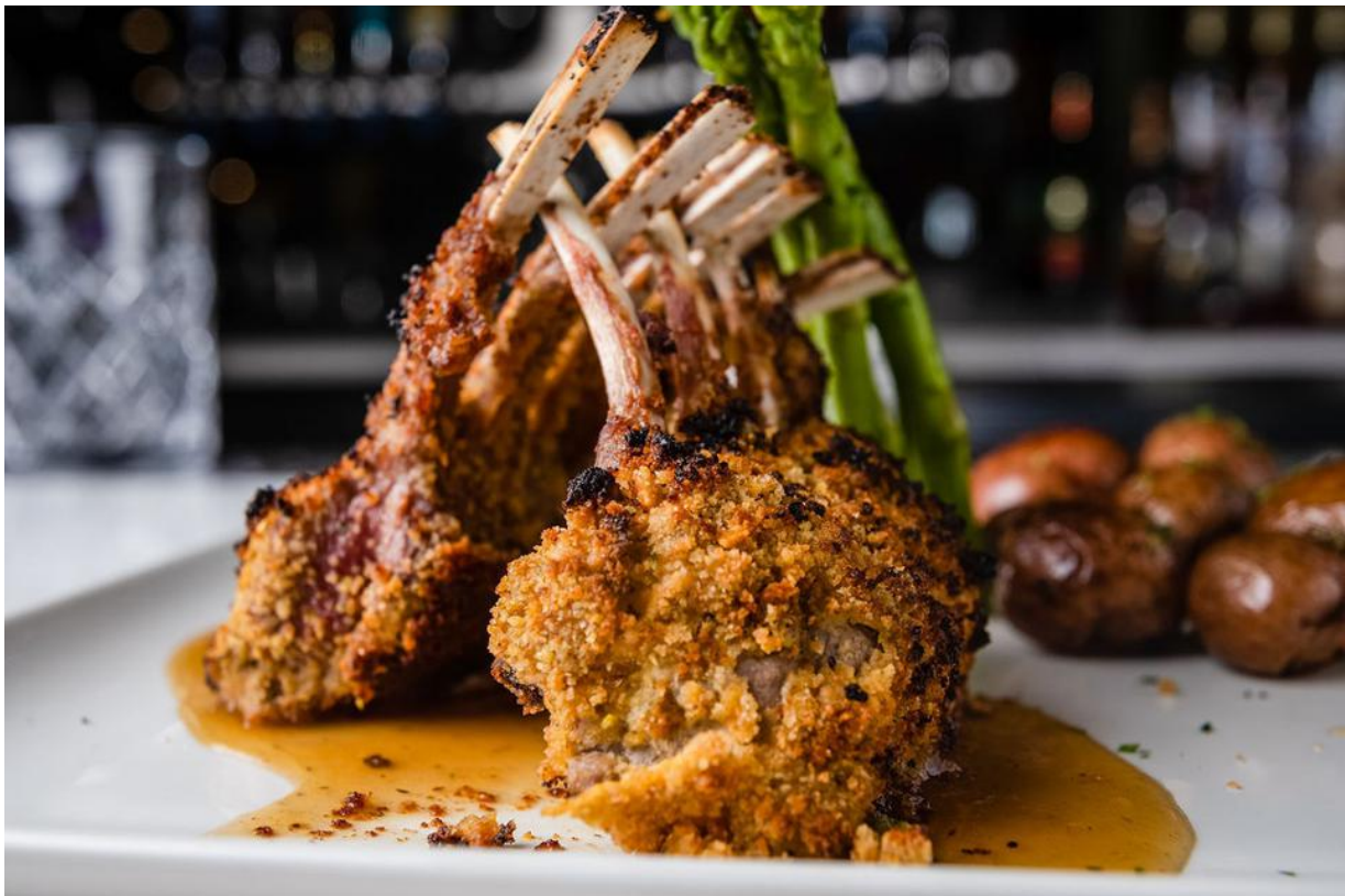
The Grove has an extensive menu of food items as well as a craft bar. GROVE

Scott's Deli has a great selection of sandwiches, salads, and breakfast items—a great option if you want to pack a picnic for the beach. Everything is made fresh to order. Breakfast favorites include the steak-and-egg sandwich and the avocado toast. Kids will love the create-your-own-hotdogs (with options like bacon, corn, or chili powder). Sandwich lovers have plenty of choices in both hot and cold offerings as well as make-your-own specials. Other favorites include the street tacos and salads. (The Southwest salad is a popular choice.)