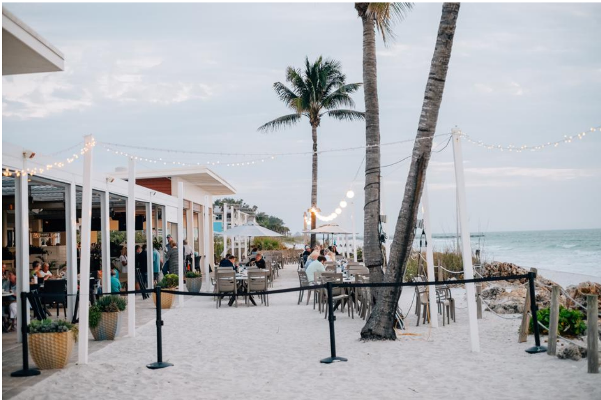
The Beach House has an enviable location right on the sand. STEPHEN SWETT

staff embodies. Popular dishes include the freshly caught local grouper—it can be served on a bun as a sandwich or plated and served as an entrée. Pair it with one of their award-winning margaritas or, a Pier favorite, the White Sandy Beaches cocktail, which is made with Svedka vanilla vodka, Cruzan coconut rum, pineapple and cranberry juice. There’s nothing more medicinal than a margarita and fresh Florida seafood while sitting on the water to put you in vacation mode. The restaurant embodies the traditional Aloha spirit of hospitality blended with today’s Anna Maria Island flavors.