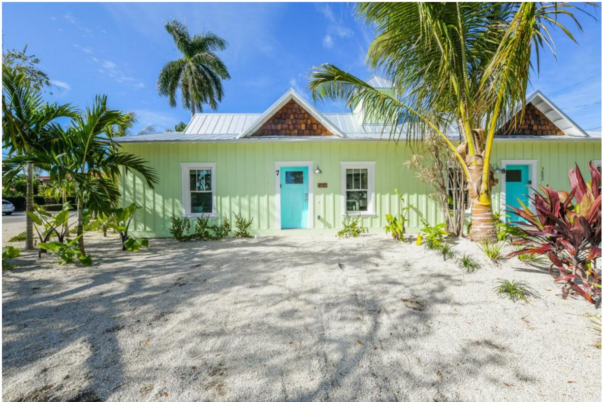
Islands West Resort villas are a stone's throw from Holmes Beach on Anna Maria Island.

The Bradenton-Anna Maria Island-Longboat Key area is located on Florida’s west coast between St. Petersburg and Sarasota. It is bordered on the north by Tampa Bay and to the west by the Gulf of Mexico. Many people feel that this region has successfully preserved the characteristics of “Old Florida.”