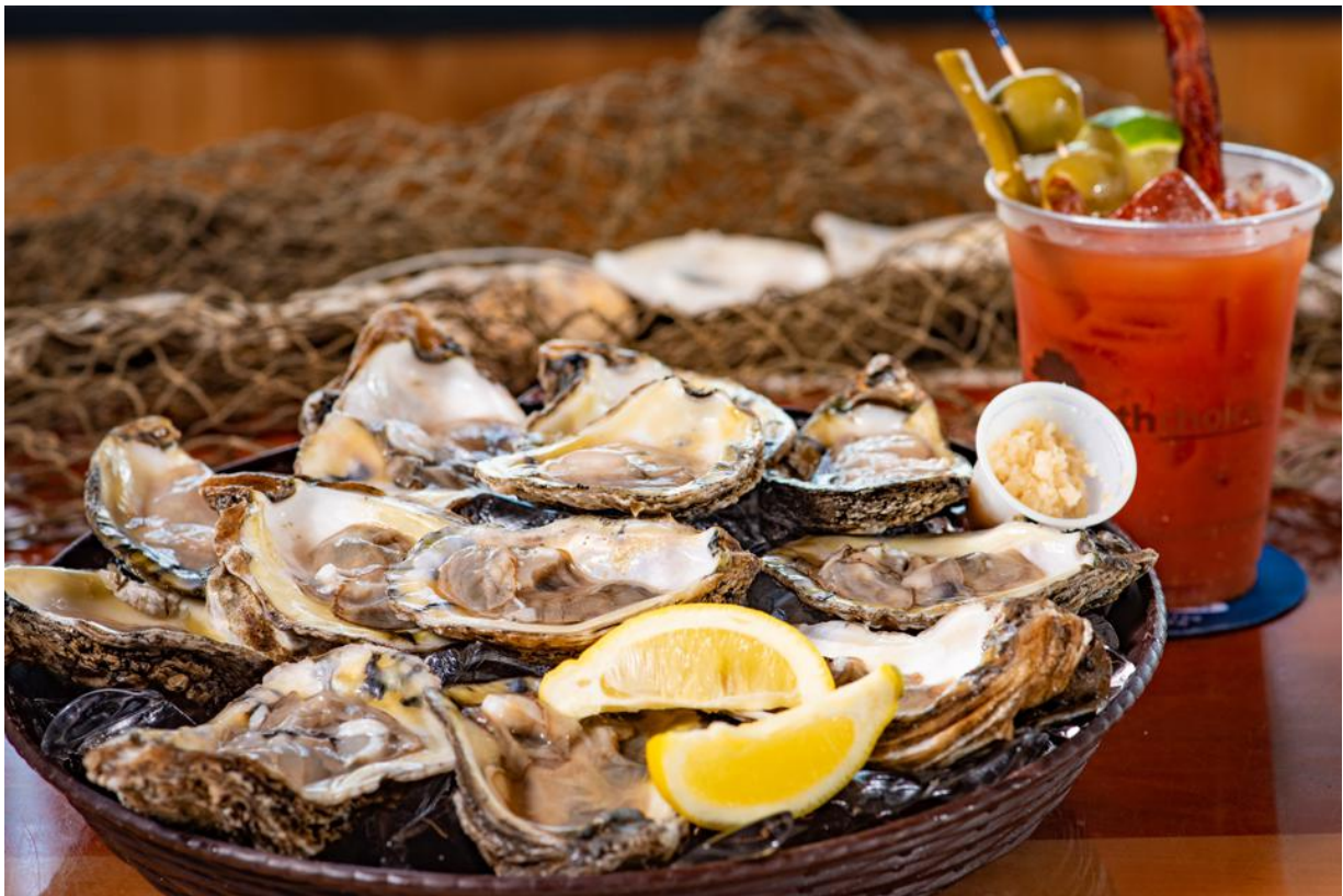
Fresh Gulf oysters along with a signature Bloody Mary is a favorite combo at Anna Maria Oyster Bar.

Anna Maria Oyster Bar on the Pier is one of four locations throughout the Bradenton area. The pier location offers stunning views of the Intracoastal Waterway. Guests arrive by car, boat, and even golf-cart shuttle. The fun, friendly atmosphere is directly related to the warm spirit of hospitality the