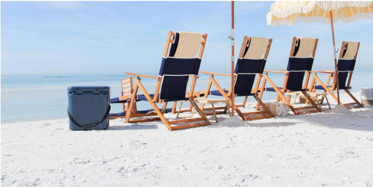
Beach Suites makes a day at the beach stress-free. BEACH SUITES

Beach Suites , run by owners Tiffany Adell and Audrey McLoughlin (who are also sisters-in-law), is a new business (they started operating in October 2020) that has really hit the ground running and to great success. It's a luxury beach setup experience that requires no work. (Everything is set up when you arrive, and they clean up when you leave.) Each beach suite experience includes setup and cleanup, wood and canvas adjustable lounge chairs, umbrellas, both still and sparkling water and a cooler with ice, sunscreen, hand sanitizer, first-aid kit, beach towels, beach blankets and ground pillows, Bluetooth speaker, portable phone charger, giant games like Connect Four and cornhole, paddleball, trash can and trash removal. You book the number of people and the beach suites team does everything else. It's the most stress-free day at the beach imaginable (and any family with kids knows that's priceless). It's a wonderful setup for a day at the beach—be it with friends, family, or a romantic partner. They book a variety of suites for guests ranging in sizes from two to eight people. They also offer beach suites for groups larger than eight for special events. The experience can be set up during the day between the hours of 10 a.m. and 4 p.m. or a three-hour sunset experience.