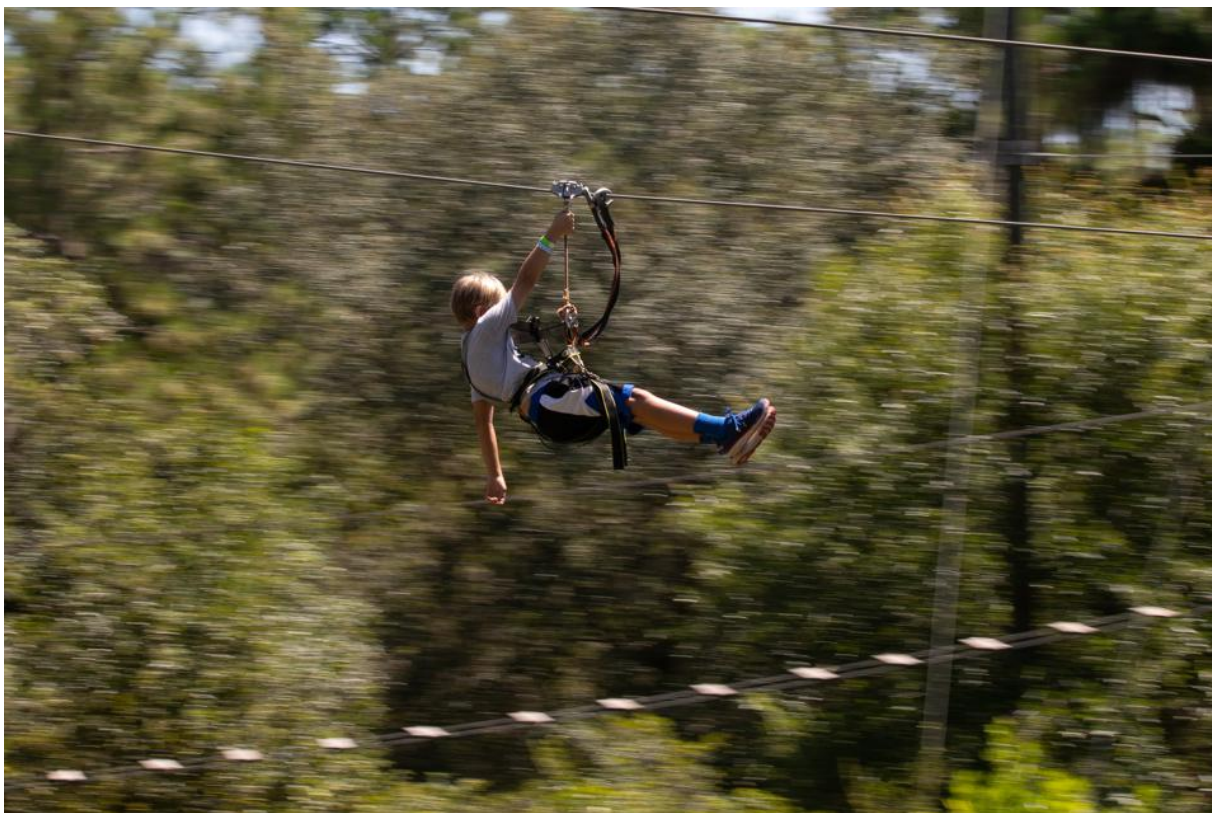
Many kids (and adults) love the ziplines on the course. TREEUMPH ADVENTURE COURSE

Royale Bridge and into Bimini Bay, there's a chance of spotting manatees. Stops include a bird rookery, where roseate spoonbills, blue herons and white egrets can be found; Mangrove Island, where people can wade in the seagrass to view fish eggs, hermit crabs, and jumping mullets; and the oyster shoal.