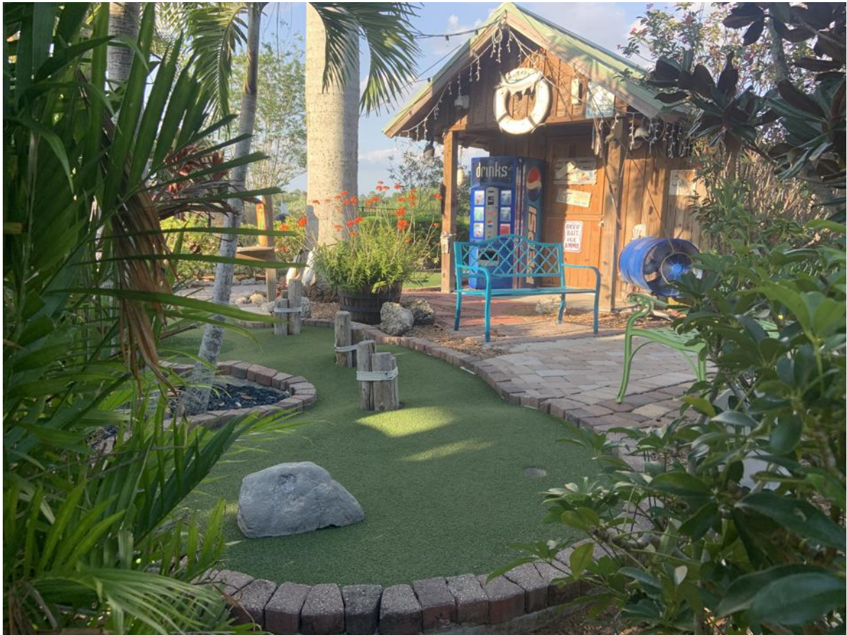
The Fish Hole Mini Golf at Lakewood Ranch JUDY KOUTSKY

narrated wildlife tour has a very good chance of seeing dolphins. There's also a possibility to view manatees, rays, and other wildlife.