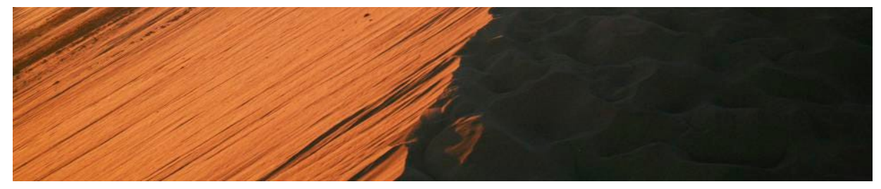
Jockey's Ridge State Park OUTER BANKS VB/OUTERBANKS.ORG

A visit to the Outer Banks is not complete without a visit here. This 426-acre state park is home to the tallest and largest natural sand dune system in the eastern United States. Hike across the dunes to reach the water (it's a workout for sure) or for those adventure seekers, book a hang gliding lesson. People also come here to fly kites, have picnics and watch the sunset.