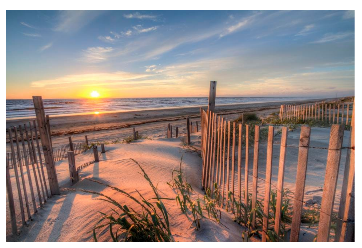
Sunrise over the sand dunes at Corolla Beach in the Outer Banks, NC.

The Outer Banks, located in North Carolina, is a chain of barrier islands known for their undeveloped and starkly beautiful coastlines. In fact, the region is recognized as having one of the largest tracts of undeveloped