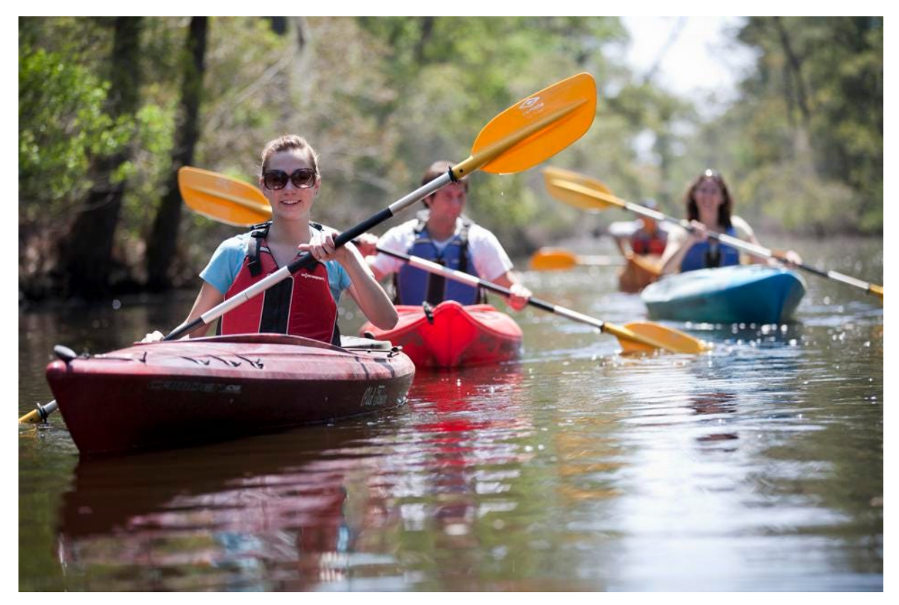
Kayaking is a great way to experience the wildlife of the Outer Banks.

A great way to explore nature and get a chance to see alligators up close is through a kayak tour to Alligator River National Wildlife Refuge. There's more than 154,000 acres of wetland habitats and a wide variety of wildlife, including alligators and black bears (plus, turtles and a wide variety of birds). The scenery is stunning with Atlantic white cedar, bald cypress, wildflowers and shrubs. The kayak guide has a plethora of information on the flora and fauna in the area.