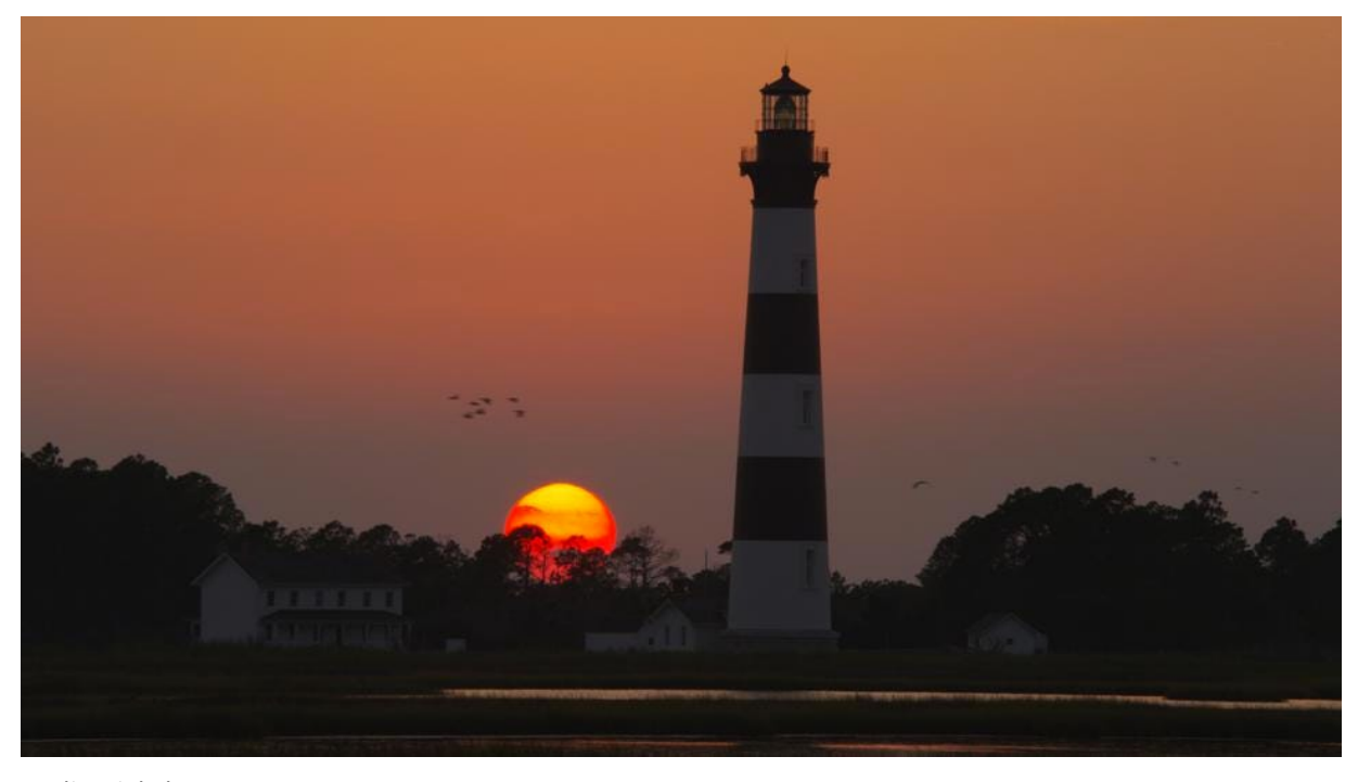
Bodie Lighthouse OUTER BANKS VB/OUTERBANKS.ORG