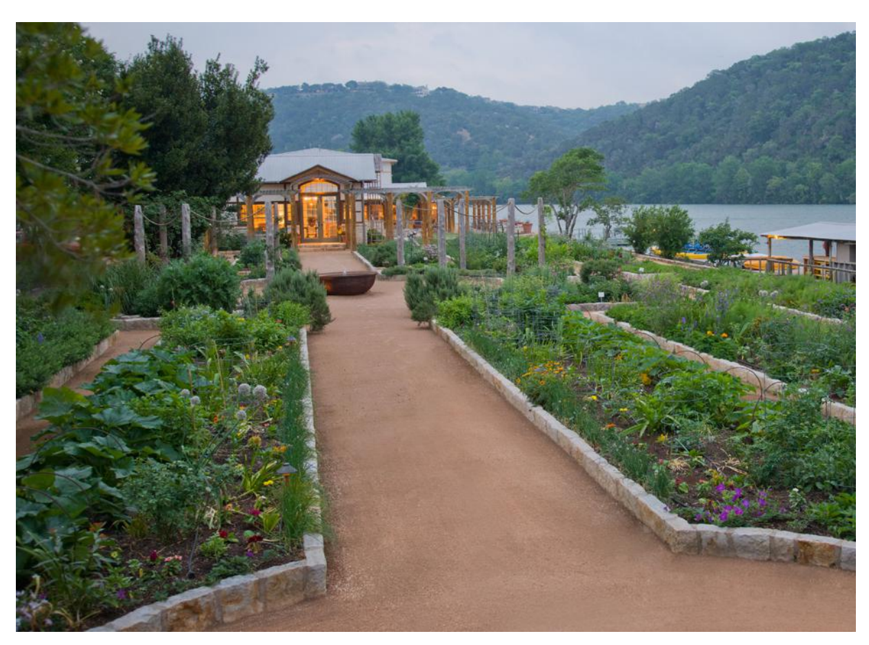
The property is located right on the water. LAKE AUSTIN SPA RESORT

Lake Austin Spa Resort is an award-winning destination spa nestled on 19 lakefront acres in Central Texas' legendary Hill Country on the shores of Lake Austin. Located near both downtown Austin and the airport, this