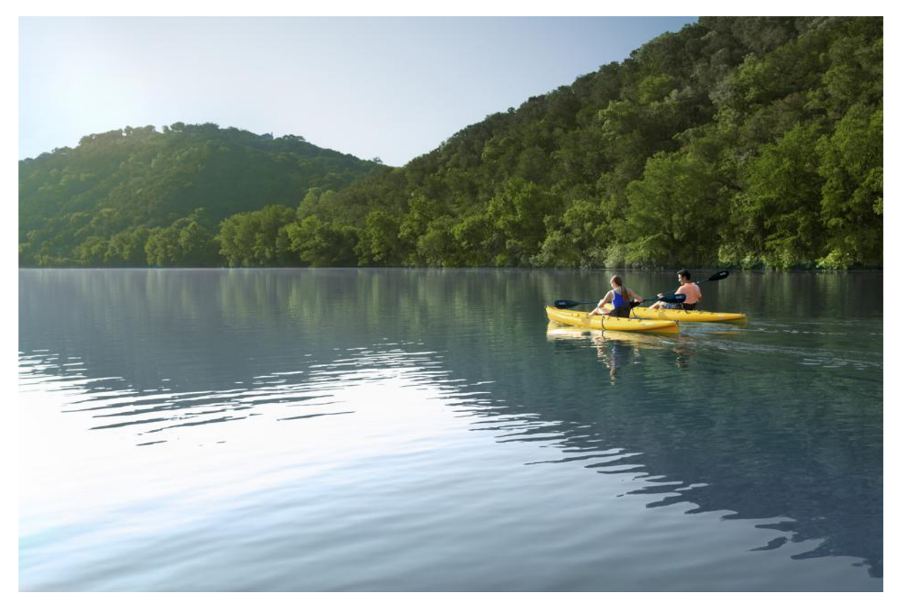
There are dozens of water activities offered. LAKE AUSTIN SPA RESORT

Lake Austin Spa Resort is located right on the water. And it doesn't just overlook the water—it sits right on the banks of Lake Austin. If in real estate, it's all about location, well, the same goes for hotels. Whether it's napping in a hammock inches from the lapping water, sitting on a chaise lounge on the dock or actually going out on the lake, this location is pretty unbeatable.