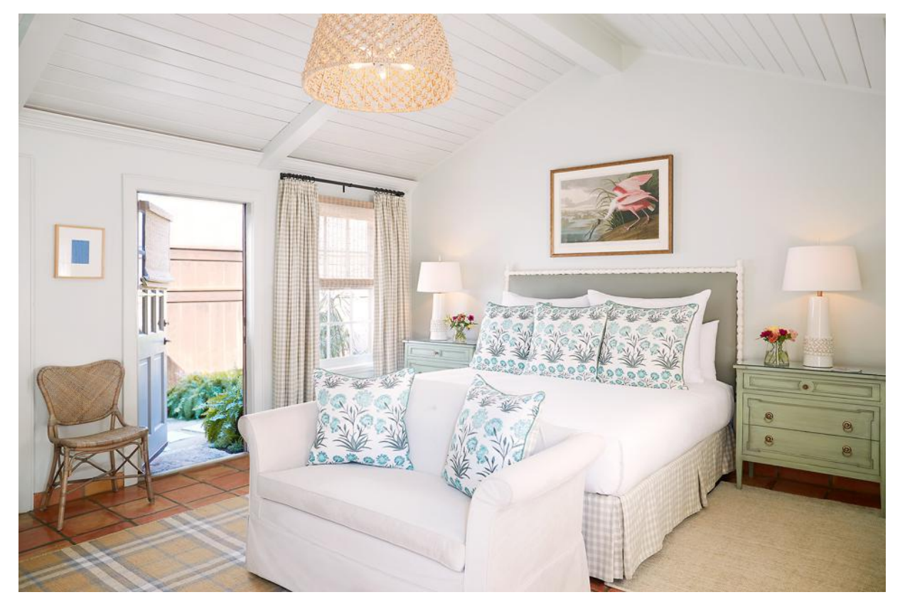
The rooms are comfortable and spacious. LAKE AUSTIN SPA RESORT

The oversize bathtub is divine. The front patio has a table and two chairs for enjoying a glass of wine or reading a book, while the back patio is a private secluded area that's fully enclosed for privacy.