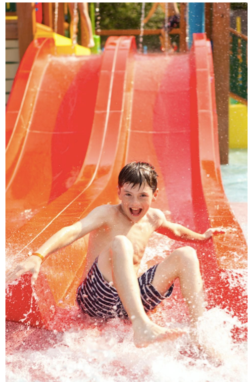
water slides YOGI BEAR'S JELLYSTONE PARK CAMP-RESORT—QUARRYVILLE

There are two pools—one is heated—and there are water volleyball and basketball hoops built into the pool. For the younger set, there's also a water zone area with slides, a fort, water cannon and spray features. Want to elevate the pool experience even further? Rent a cabana for the day. Each cabana has a private mini-fridge, table and chairs, a couch, ceiling fan and plenty of shade and privacy.