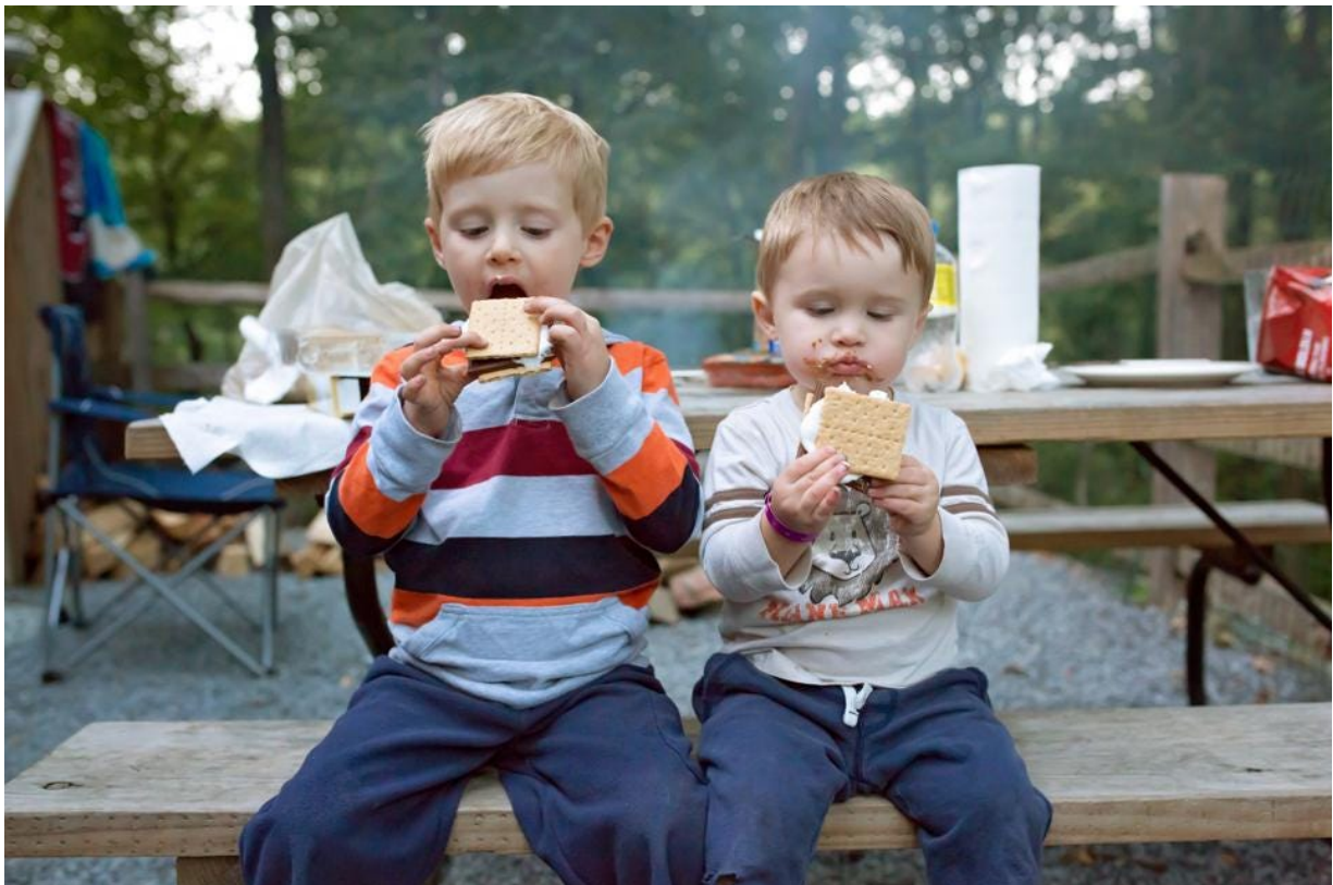
Happy campers YOGI BEAR'S JELLYSTONE PARK CAMP-RESORT—QUARRYVILLE

Everyone is rethinking their summer trips this year due to the coronavirus, and camping is seeing a huge boost in numbers. Want family camping at its best? Then head to Yogi Bear's Jellystone Park Camp-Resort—Quarryville .