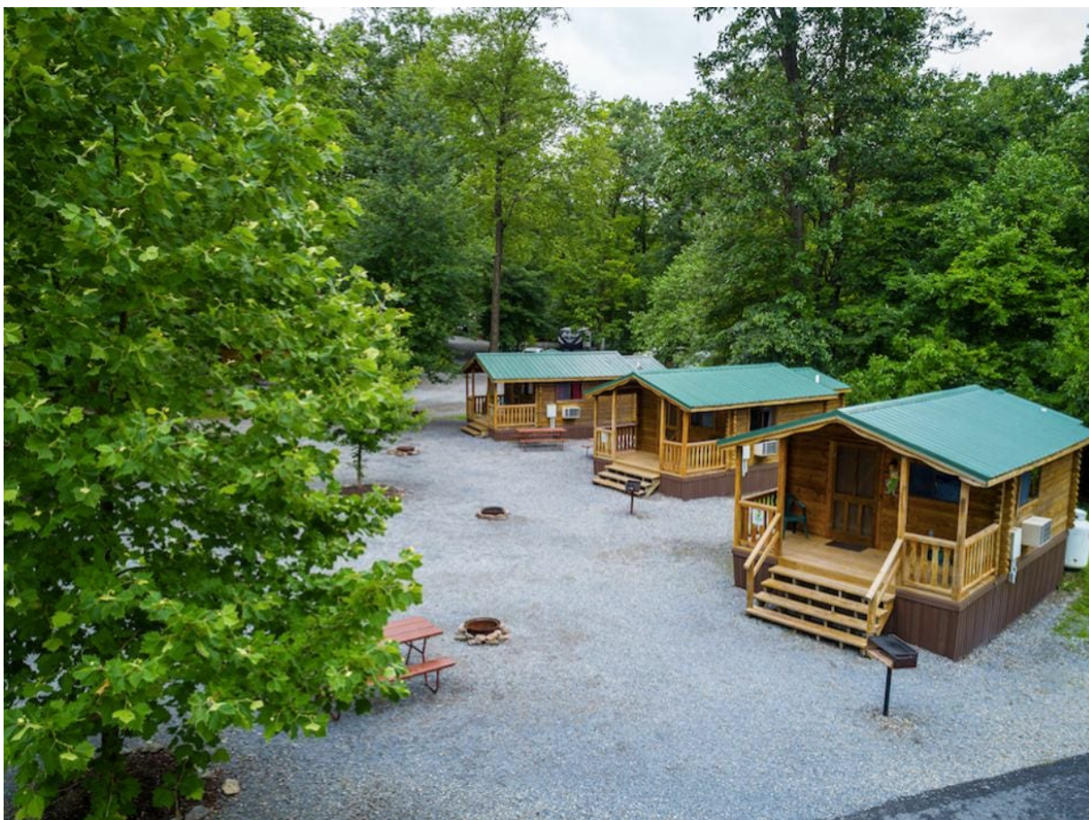
cabins YOGI BEAR'S JELLYSTONE PARK CAMP-RESORT—QUARRYVILLE

The campground has tent sites, but if you're looking for something spacious and with the most amenities, go for the Stewart's Creek Cabin. It sleeps up to 10 people and has a full kitchen (with a refrigerator, oven, stove, microwave, sink, dishes and kitchen table). Sleeping options include a futon, bunk beds,